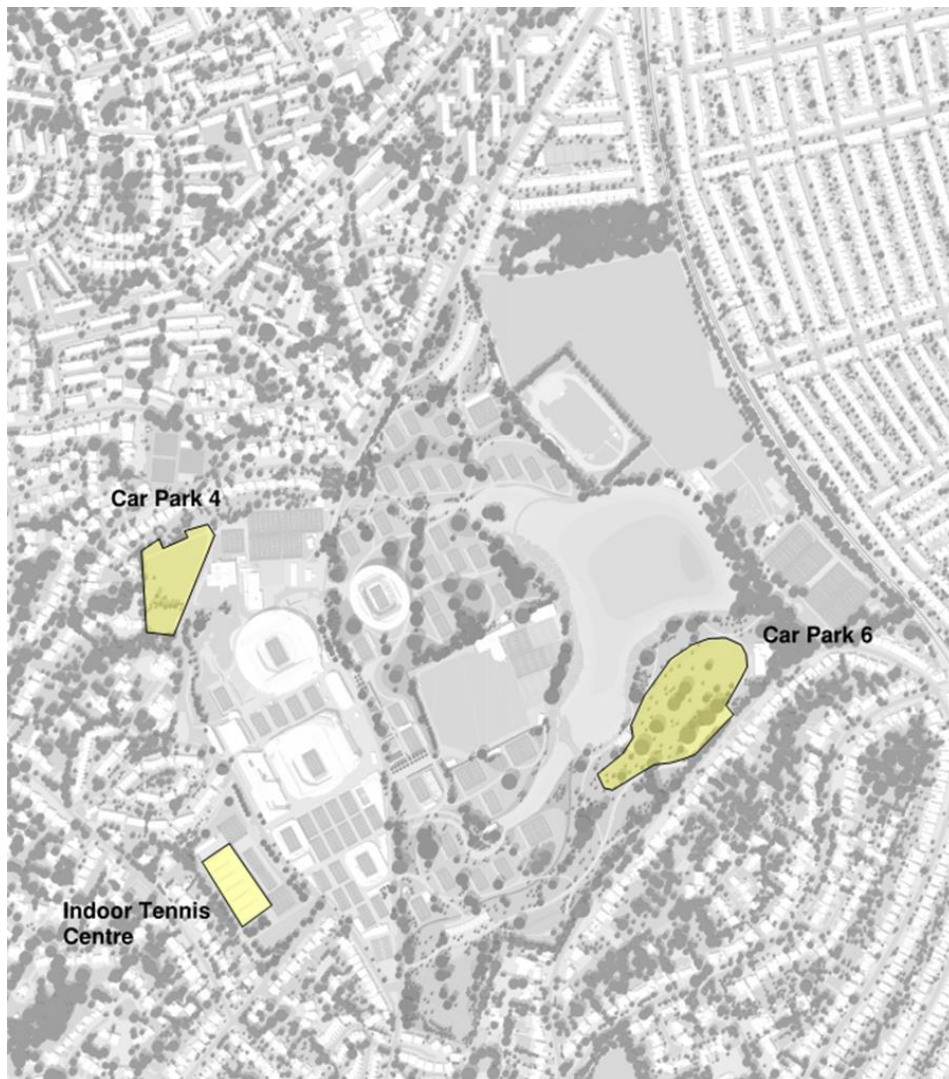
Figure 2.2 Proposed Parking Locations (Opening Year)

2.2.4 Whilst the table provides the capacity of each car park, it is important to note that there does need to be some flexibility in how this capacity is used to take account of a great many variables during the Championships, including: