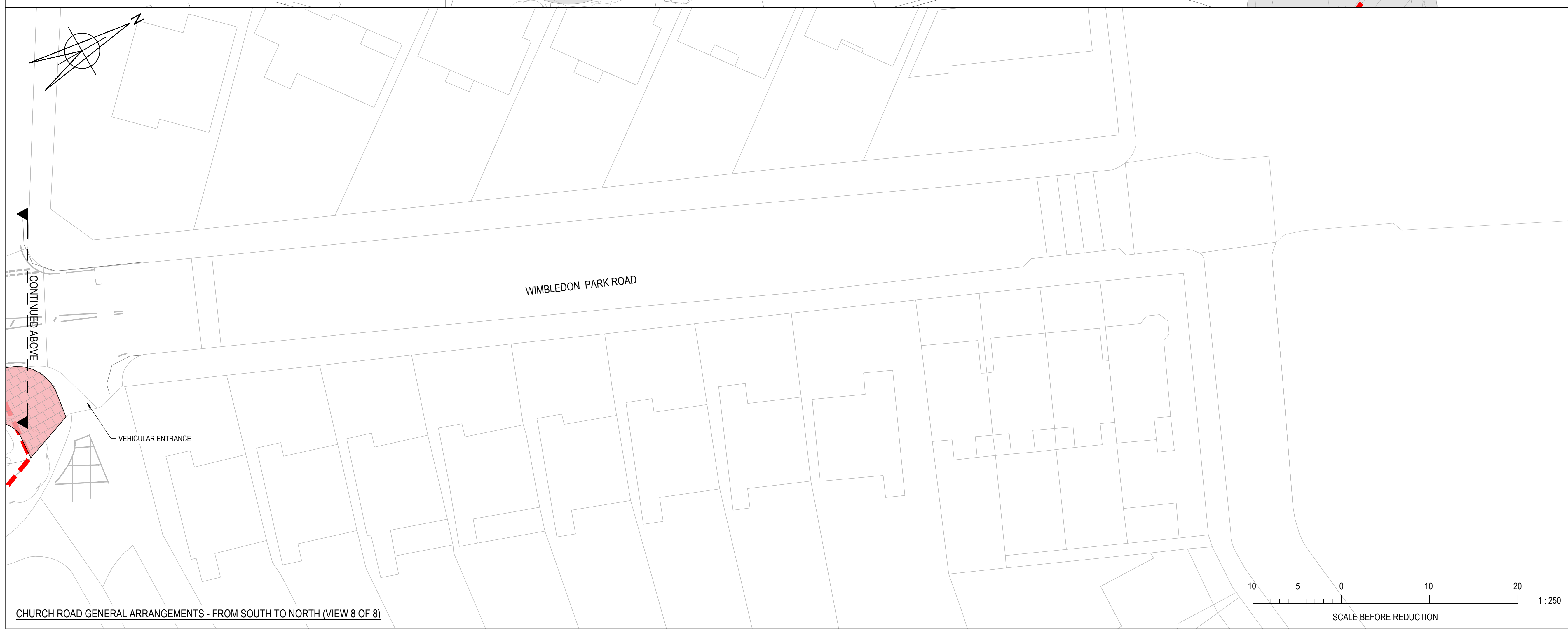
CHURCH ROAD GENERAL ARRANGEMENTS - FROM SOUTH TO NORTH (VIEW 8 OF 8)