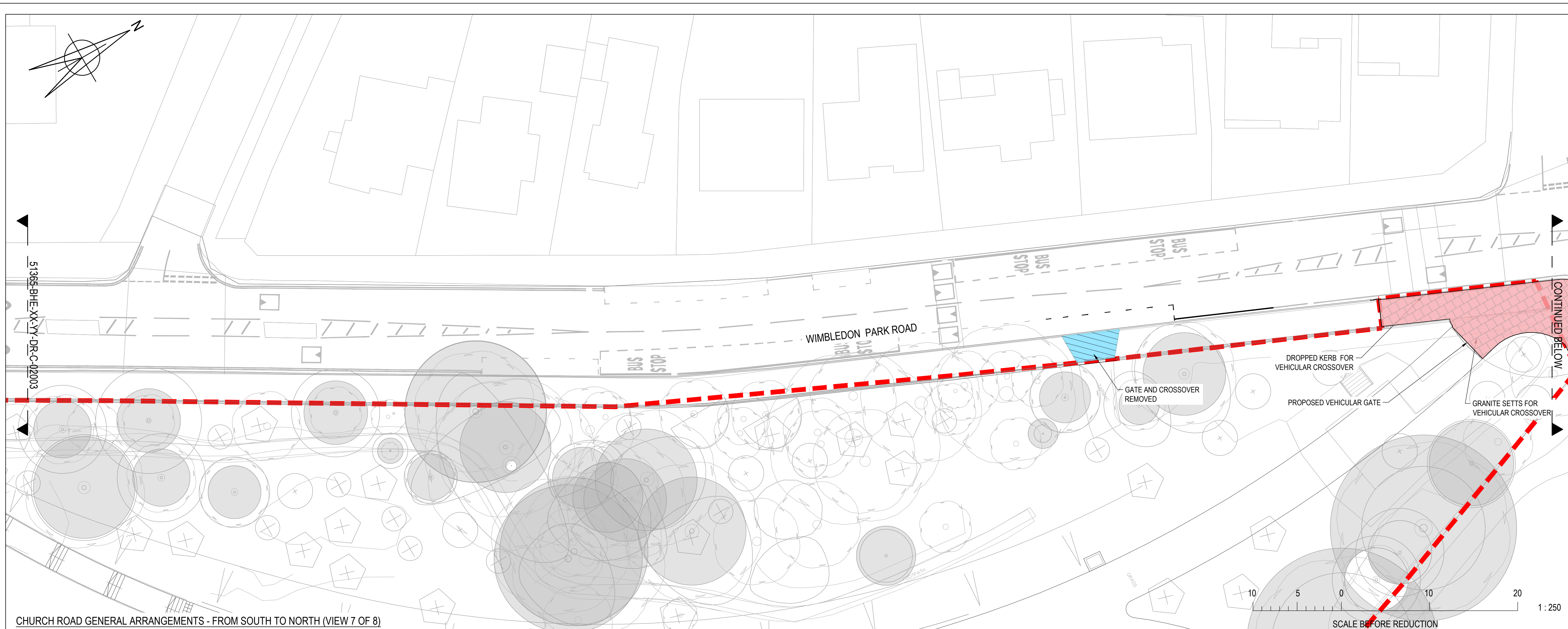
CHURCH ROAD GENERAL ARRANGEMENTS - FROM SOUTH TO NORTH (VIEW 7 OF 8)