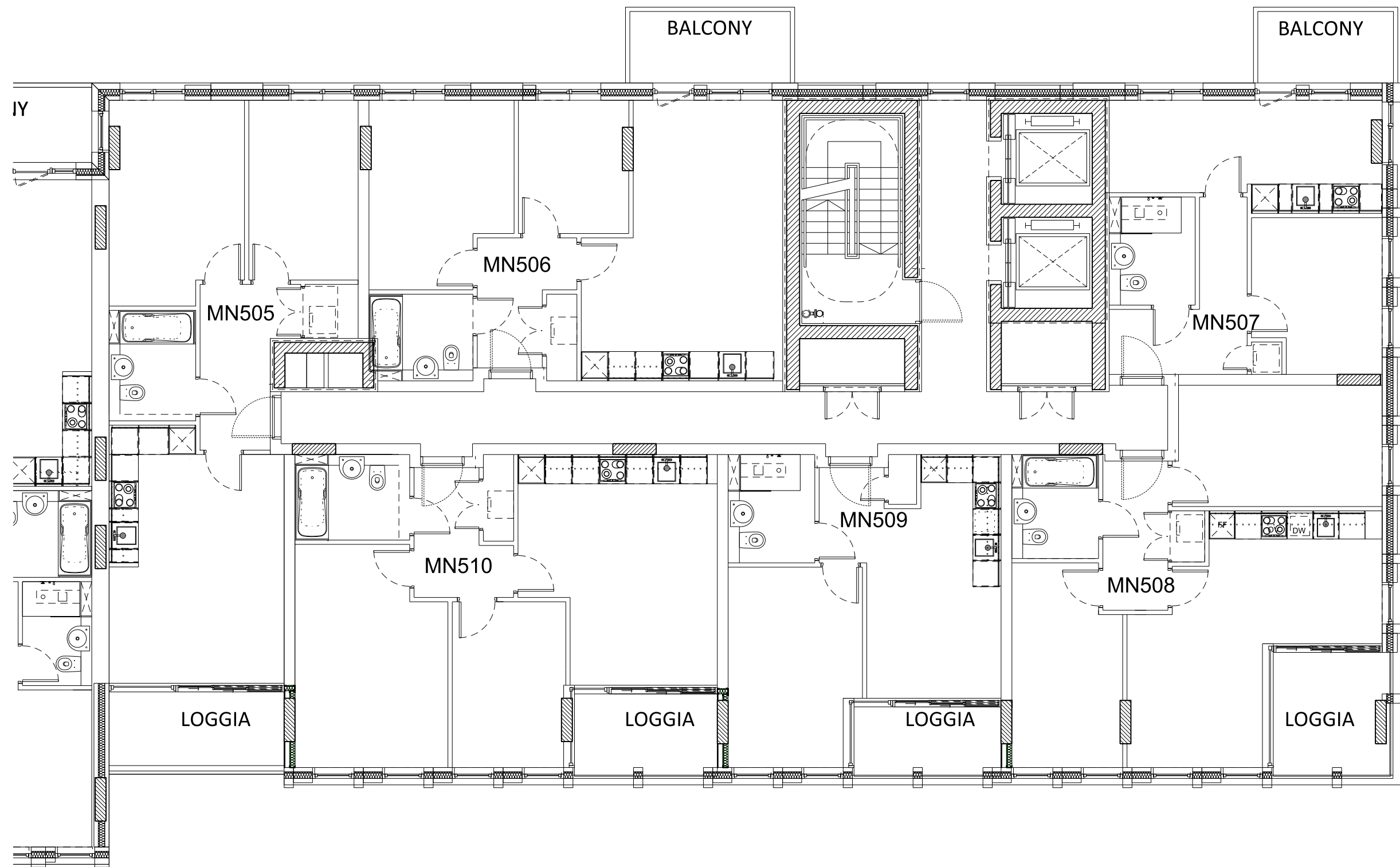
02 Level 05 Plan Plan section 2

This drawing is copyright Do not scale off dimensions. All dimensions to be checked on site by contractor. Contractor to report any dimensional discrepancies, errors or omissions prior to commencing on site. NOTE: 1- All internal layouts and furnishings are shown for indicative purposes only. 2- All landscape layouts are shown for indicative purposes only.