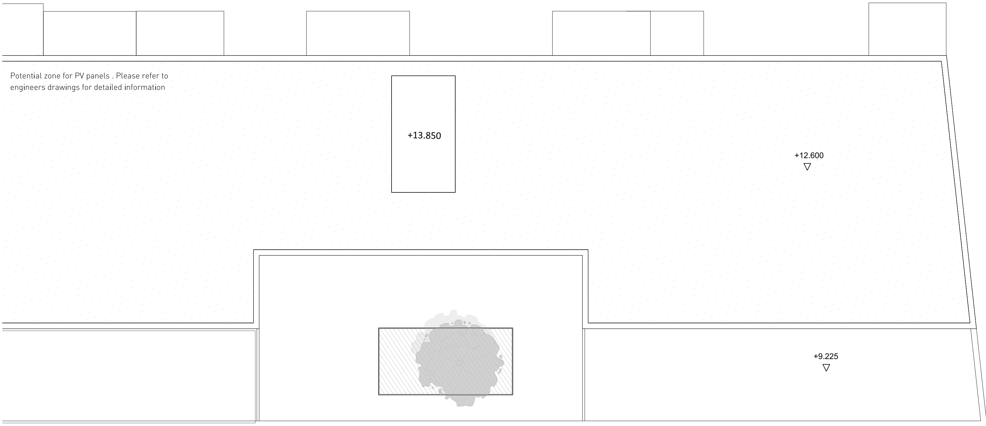
02 Level 04 - Roof plan Section 2

This drawing is copyright Do not scale off dimensions. All dimensions to be checked on site by contractor. Contractor to report any dimensional discrepancies, errors or omissions prior to commencing on site. NOTE: 1- All internal layouts and furnishings are shown for indicative purposes only. 2- All landscape layouts are shown for indicative purposes only.