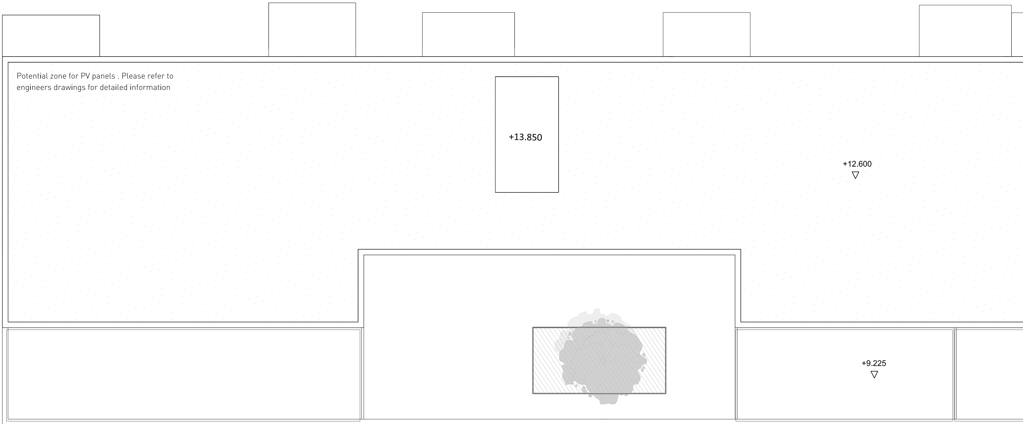
01 Level 04 - Roof plan Section 1