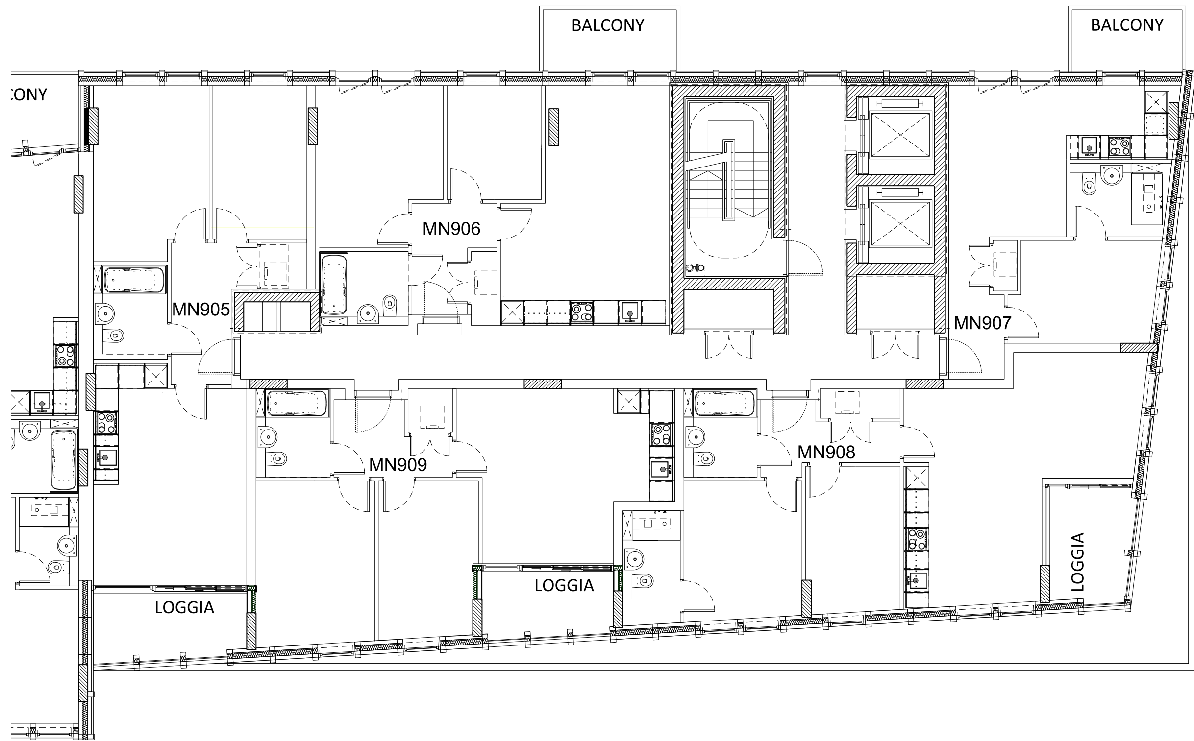
02 Level 09 Plan Plan section 2

This drawing is copyright Do not scale off dimensions. All dimensions to be checked on site by contractor. Contractor to report any dimensional discrepancies, errors or omissions prior to commencing on site. NOTE: 1- All internal layouts and furnishings are shown for indicative purposes only. 2- All landscape layouts are shown for indicative purposes only.