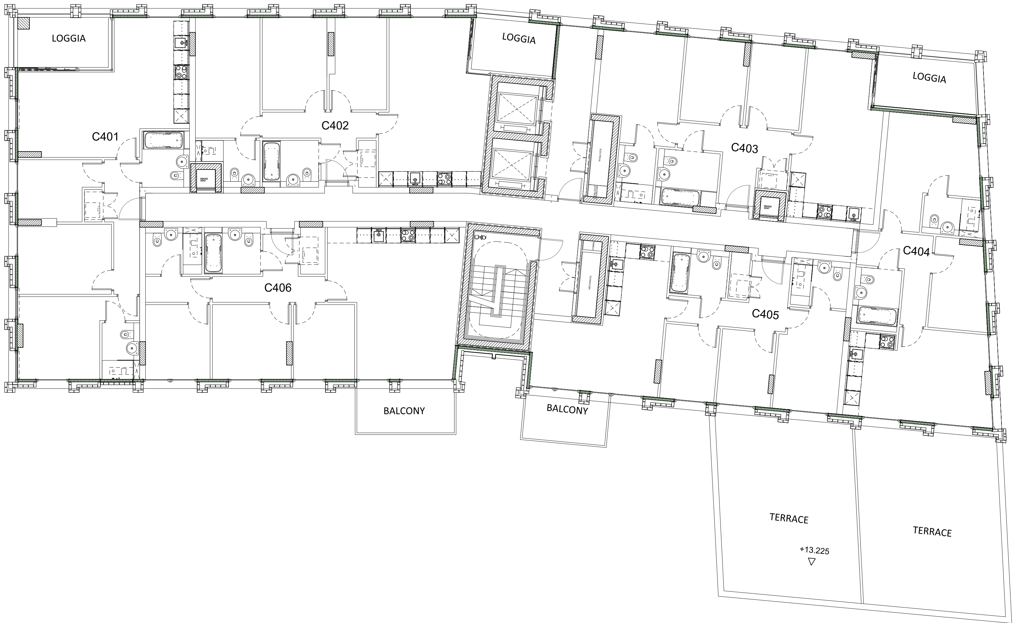
01 Level 04 plan Section 1

This drawing is copyright Do not scale off dimensions. All dimensions to be checked on site by contractor. Contractor to report any dimensional discrepancies, errors or omissions prior to commencing on site. NOTE: 1- All internal layouts and furnishings are shown for indicative purposes only. 2- All landscape layouts are shown for indicative purposes only.