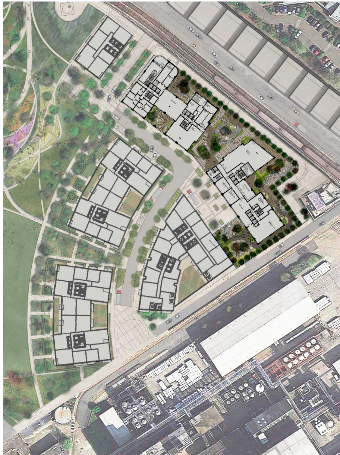
PROPOSED COMPOSITE PODIUM LEVEL PLAN