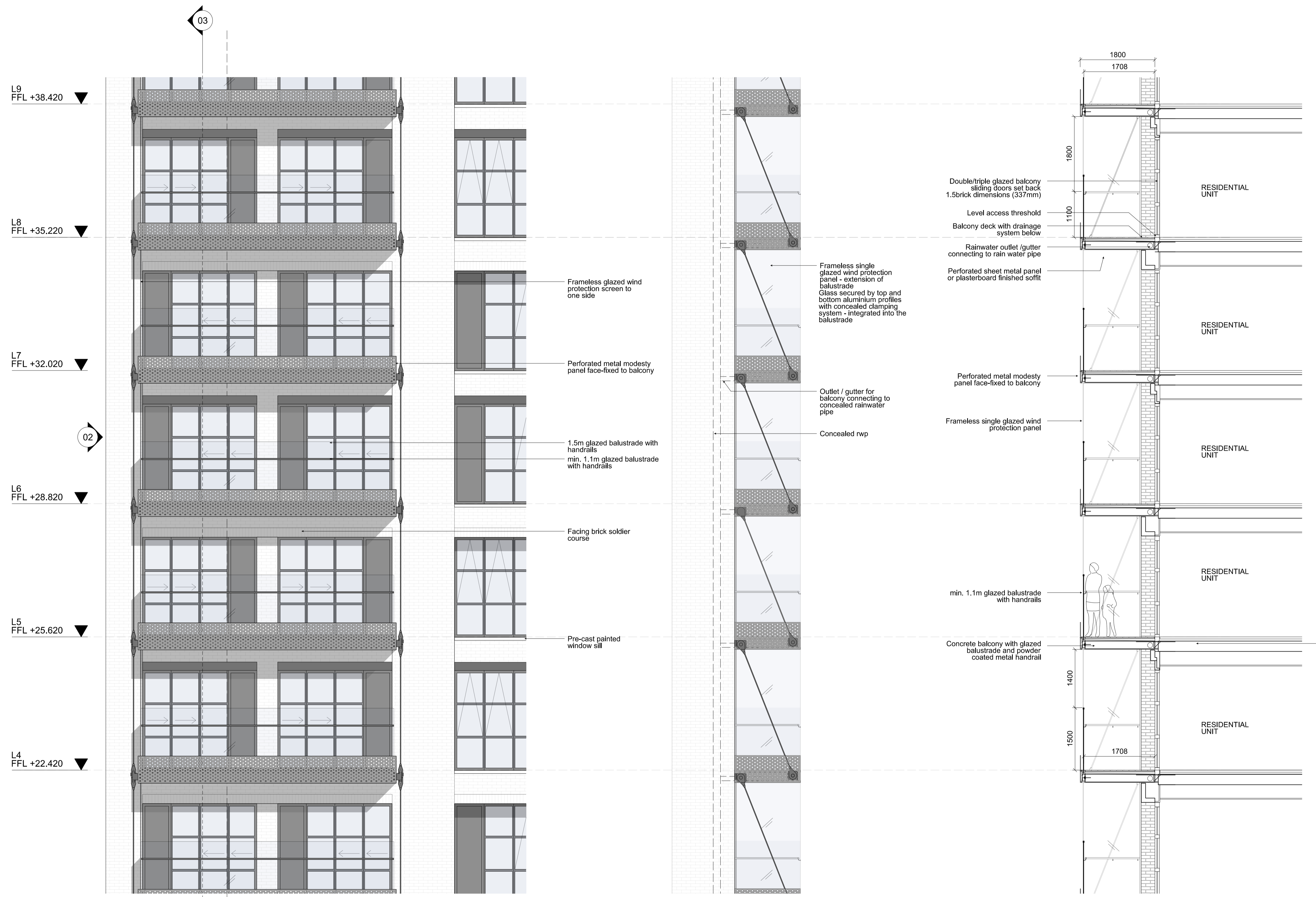
01 TYPICAL BAY 05 - ELEVATION 1:50