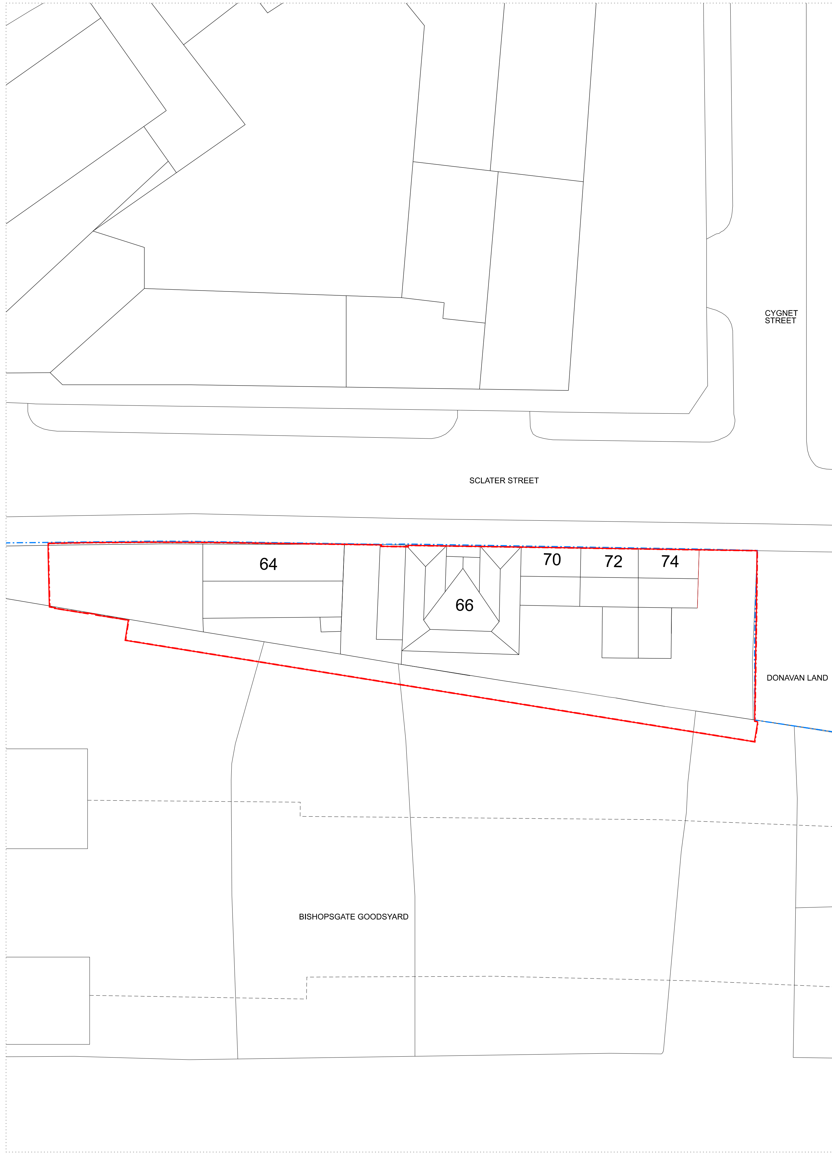
1 1:1250@A1 1:2500@A3 LOCATION PLAN

0 1 2 3 4 5 6 7 8 9 10 SCALE IN METRES @ 1:200