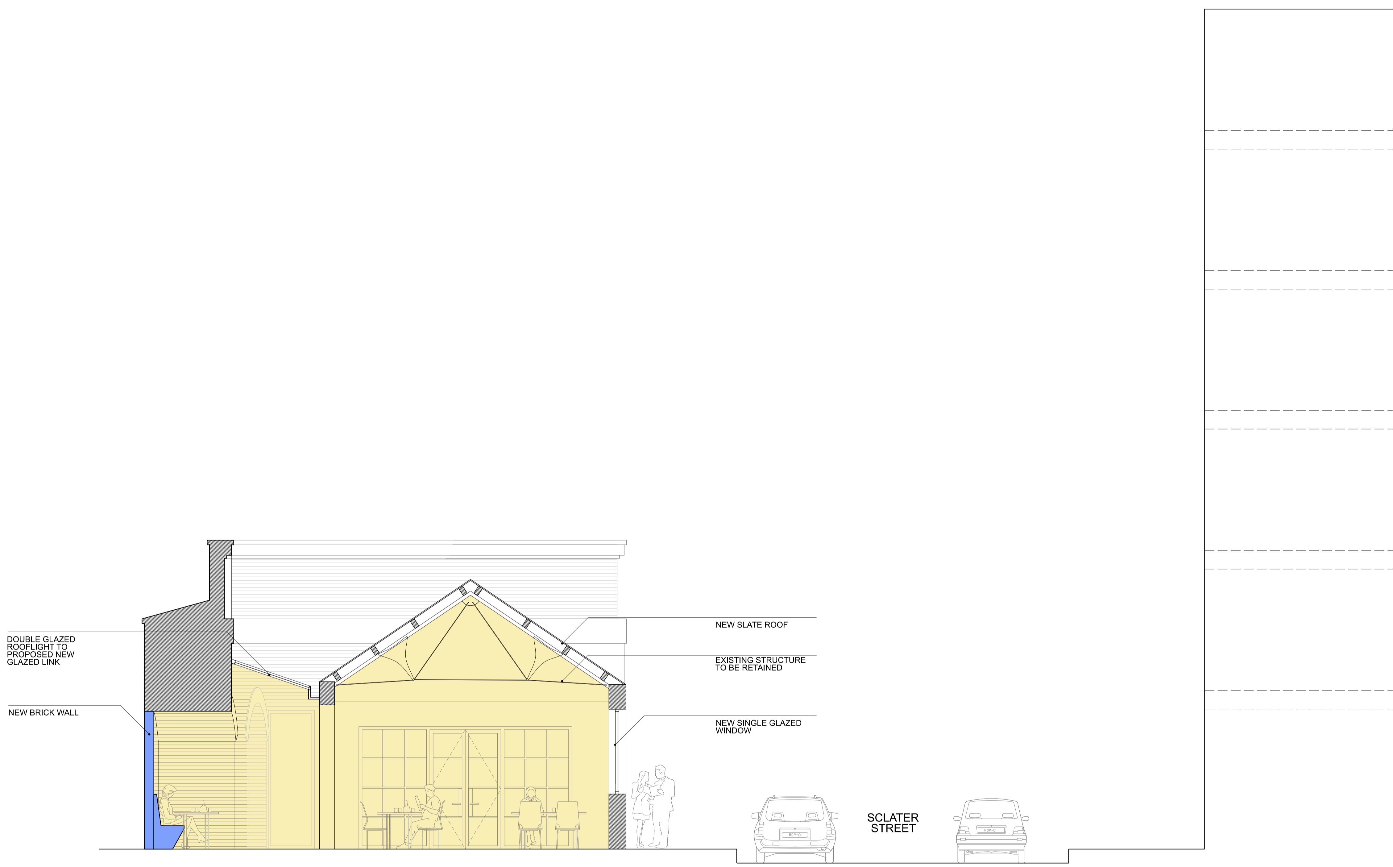
1 1:50 @ A1/ 1:100 @ A3 PROPOSED SECTION AA - THROUGH MISSION HALL