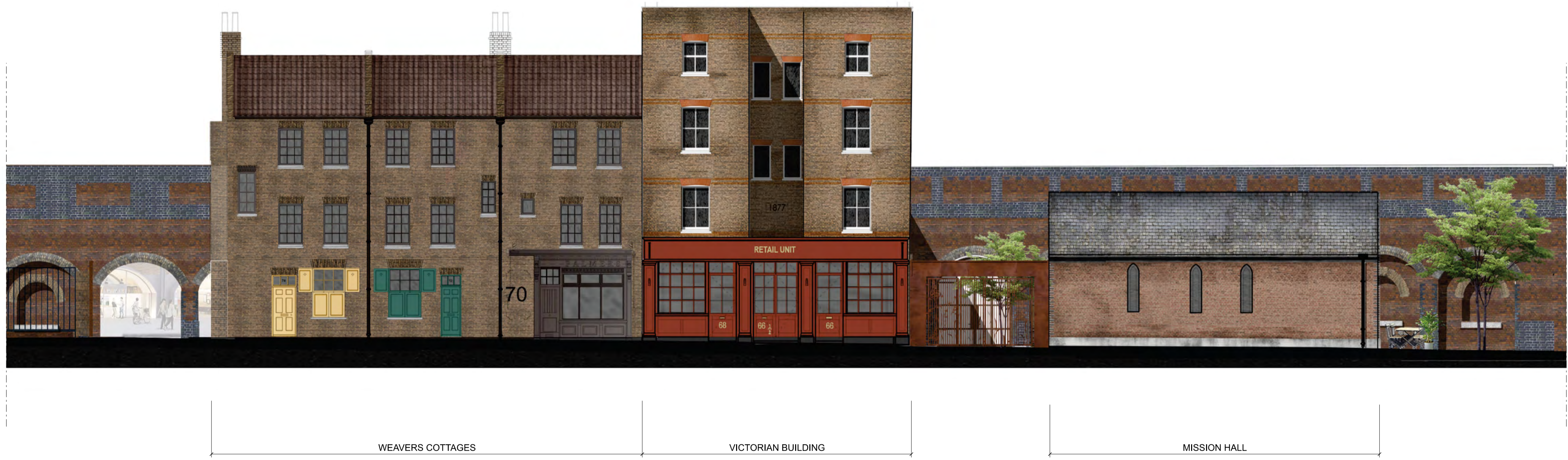
1 1:100 @ A1 / 1:200 @ A3 PROPOSED FRONT ELEVATION

This drawing is protected by copyright and must not be copied or reproduced without the written consent of Chris Dyson Architects LLP. No dimensions are to be scaled from this drawing. All dimensions and sizes to be checked on site. North points shown are indicative. © Do not scale off this drawing except for planning purposes. Dimensions, area and levels are only approximate and subject to site survey. All dimensions to be checked on site. Any discrepancies or variations to be reported to the architect before work commences. This drawing to be read in conjunction with the specification, where provided, and all relevant consultants drawings and / or specialists drawings / documents and any discrepancies or variations to be reported to the architect before the affected work commences.