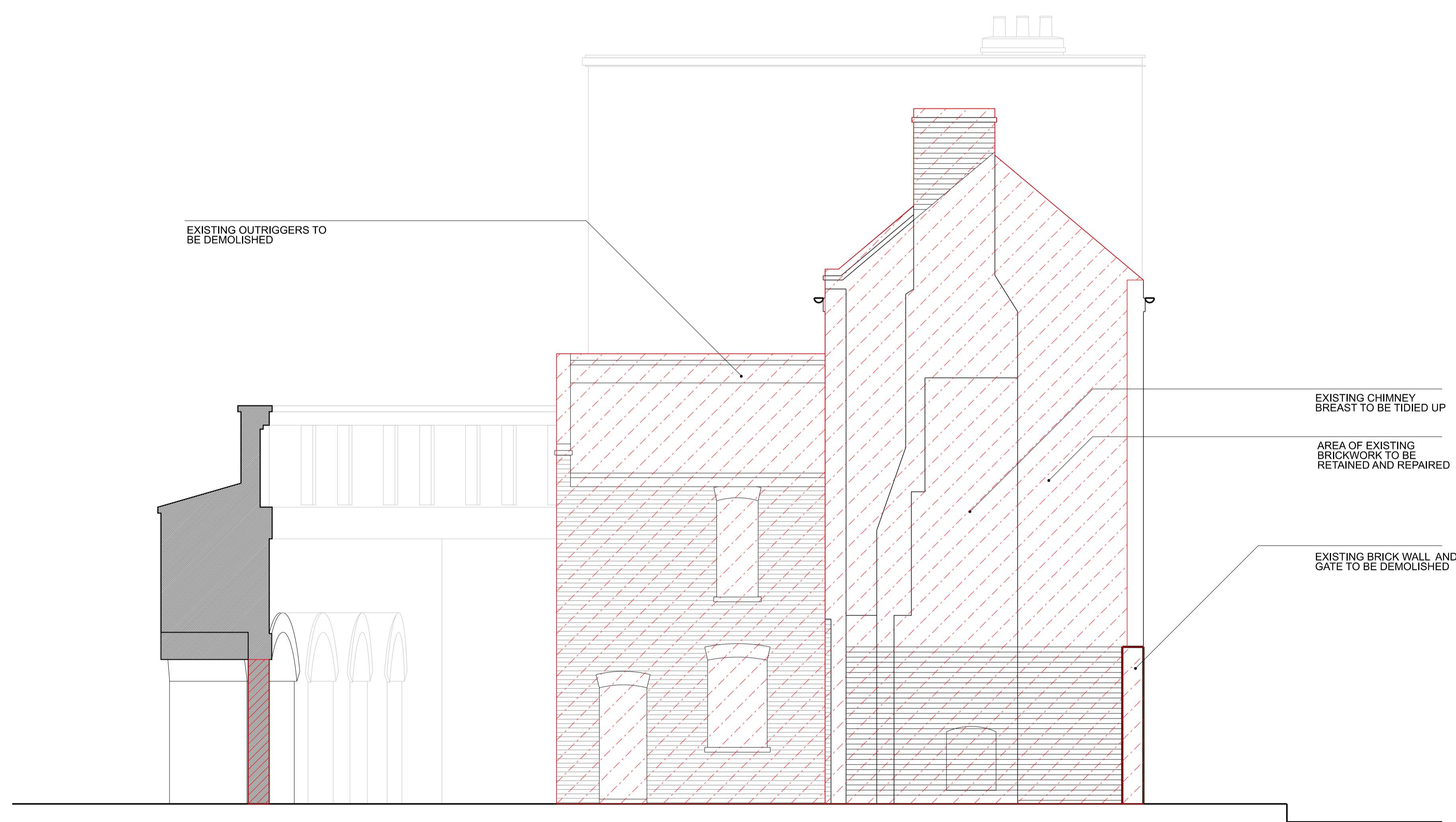
1 1:50 @ A1 / 1:100 @ A3 EXISTING EAST ELEVATION - 6