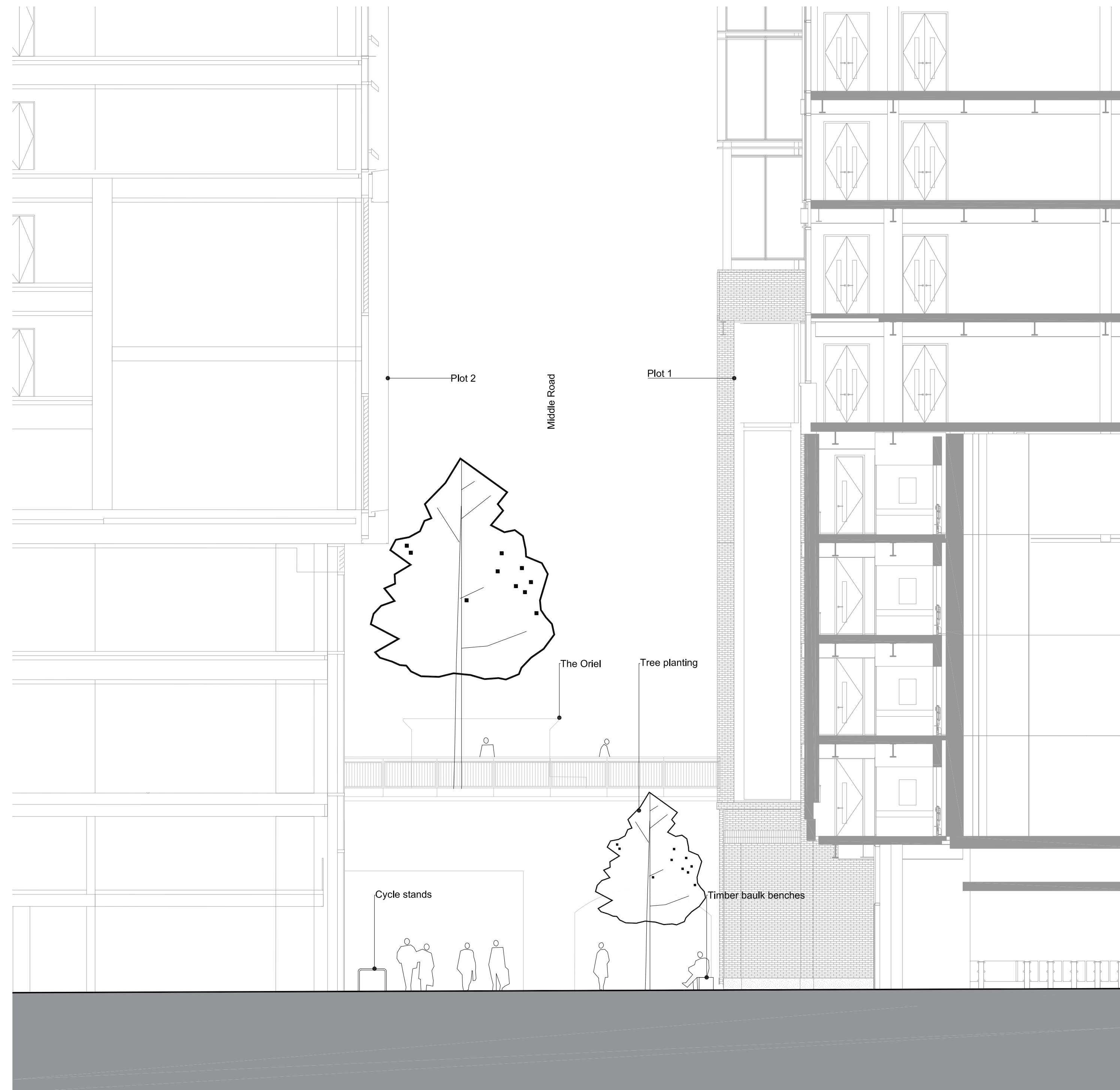
01 Section 04 SCALE: 1:100