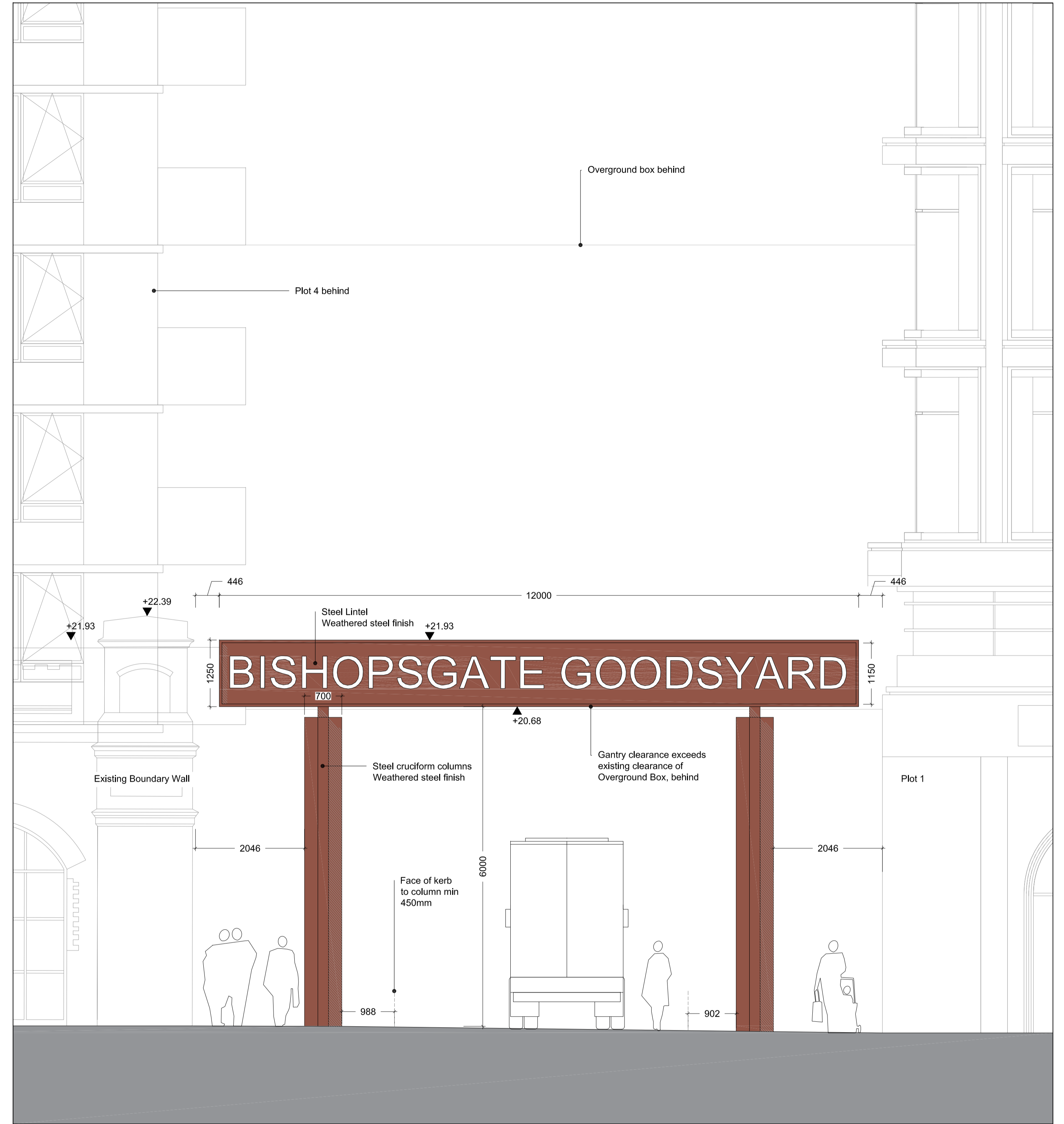
02 Station Gantry - Elevation SCALE: 1:50