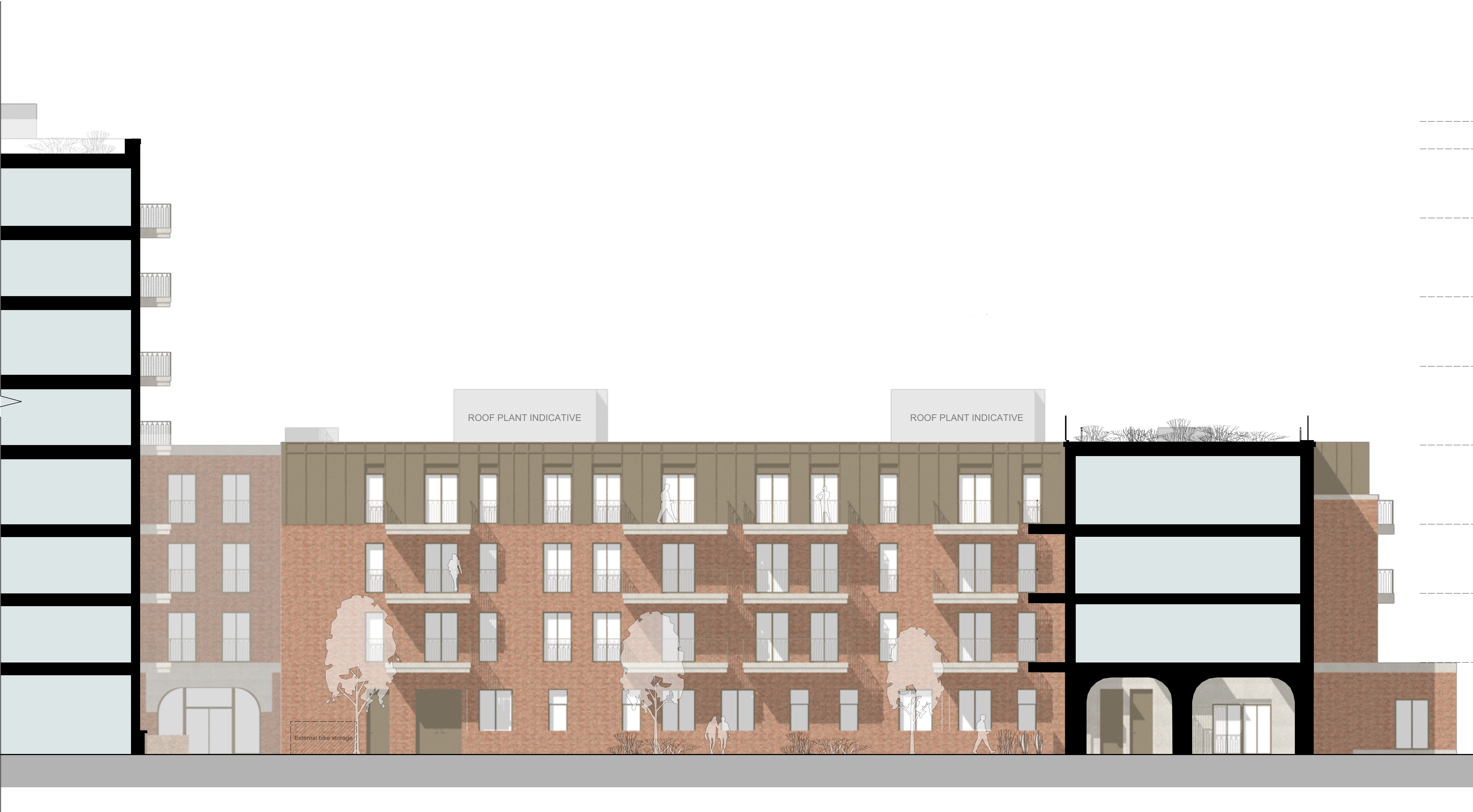
5 Internal Courtyard Elevation - West Scale: 1:100