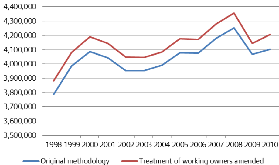
Figure 2: Employee jobs estimates adjusted for change in BRES

Source: BRES and ABI/1, additional modelling by GLA Economics.