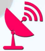
Information & communication