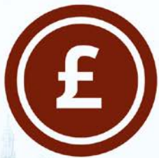
Financial & insurance activities