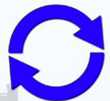
Other service activities