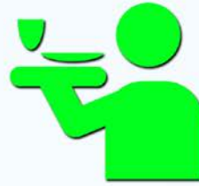
Accommodation & food service activities