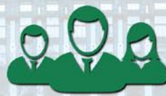
Public administration & defence activities