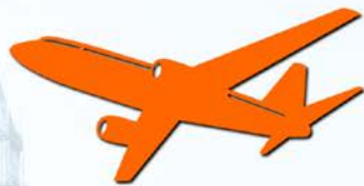
Transportation and storage