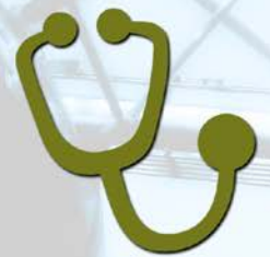
Human health & social work activities