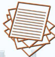
Administrative & support service activities