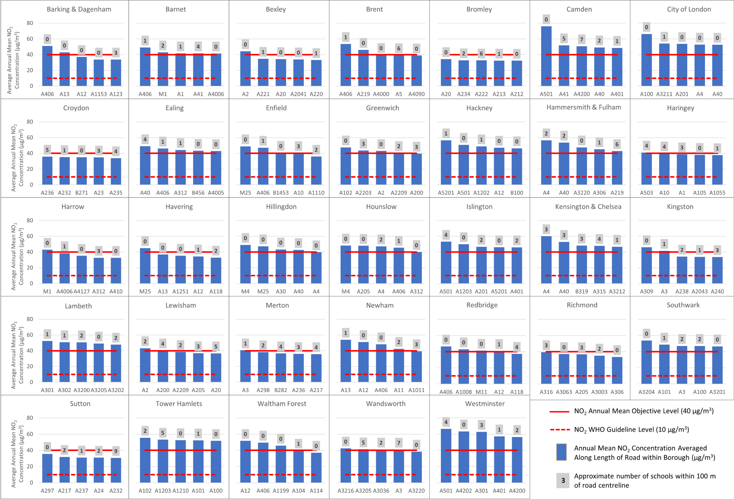
Figure 1: Annual mean 2019 NO 2 concentrations from the LAEI averaged along each road (within 25 m of the centre of the road), split by Borough. The approximate numbers of schools within 100 m of the road centreline are shown in the grey boxes.