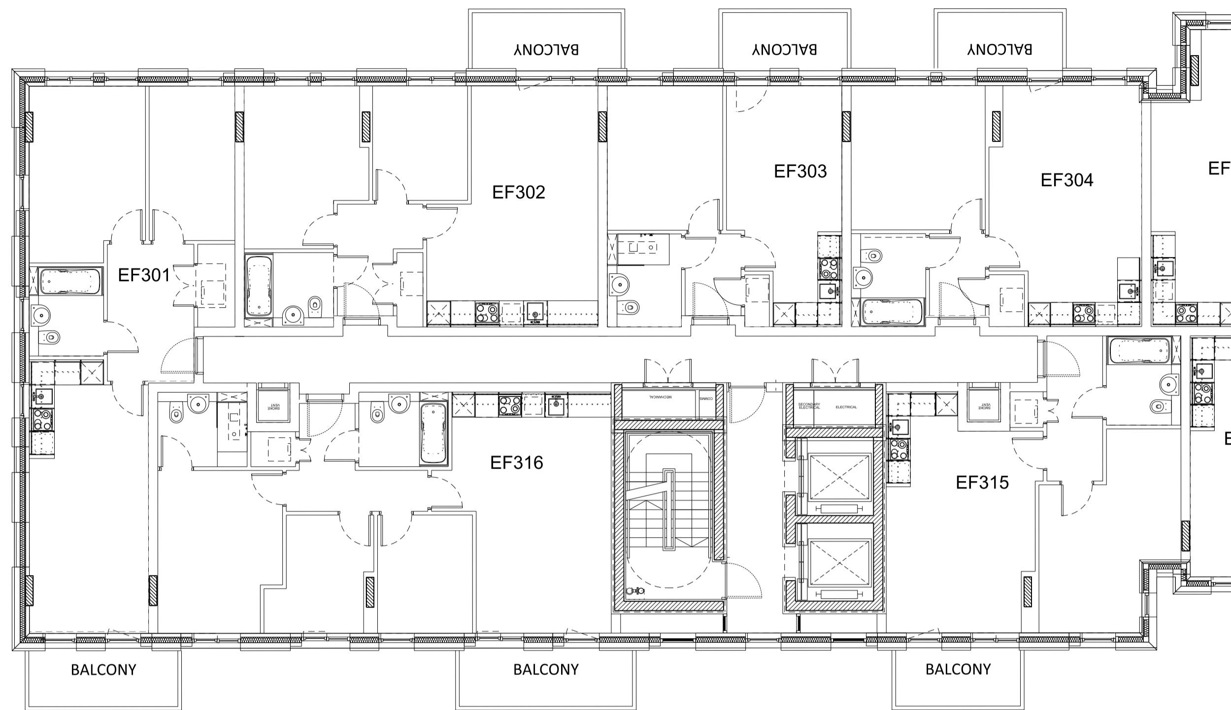
01 Level 03 plan Section 1