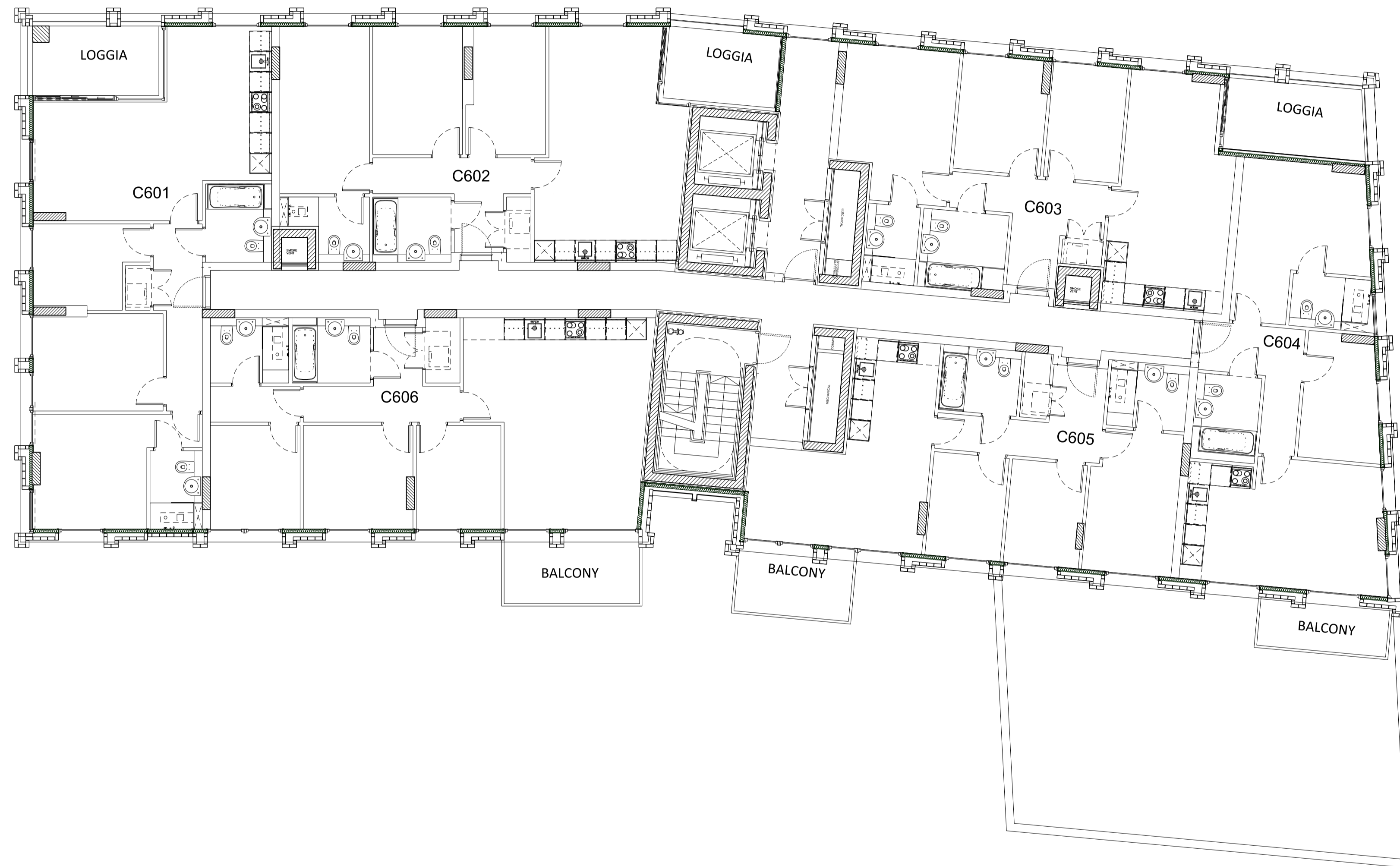
01 Level 06 plan Section 1

This drawing is copyright Do not scale off dimensions. All dimensions to be checked on site by contractor. Contractor to report any dimensional discrepancies, errors or omissions prior to commencing on site.