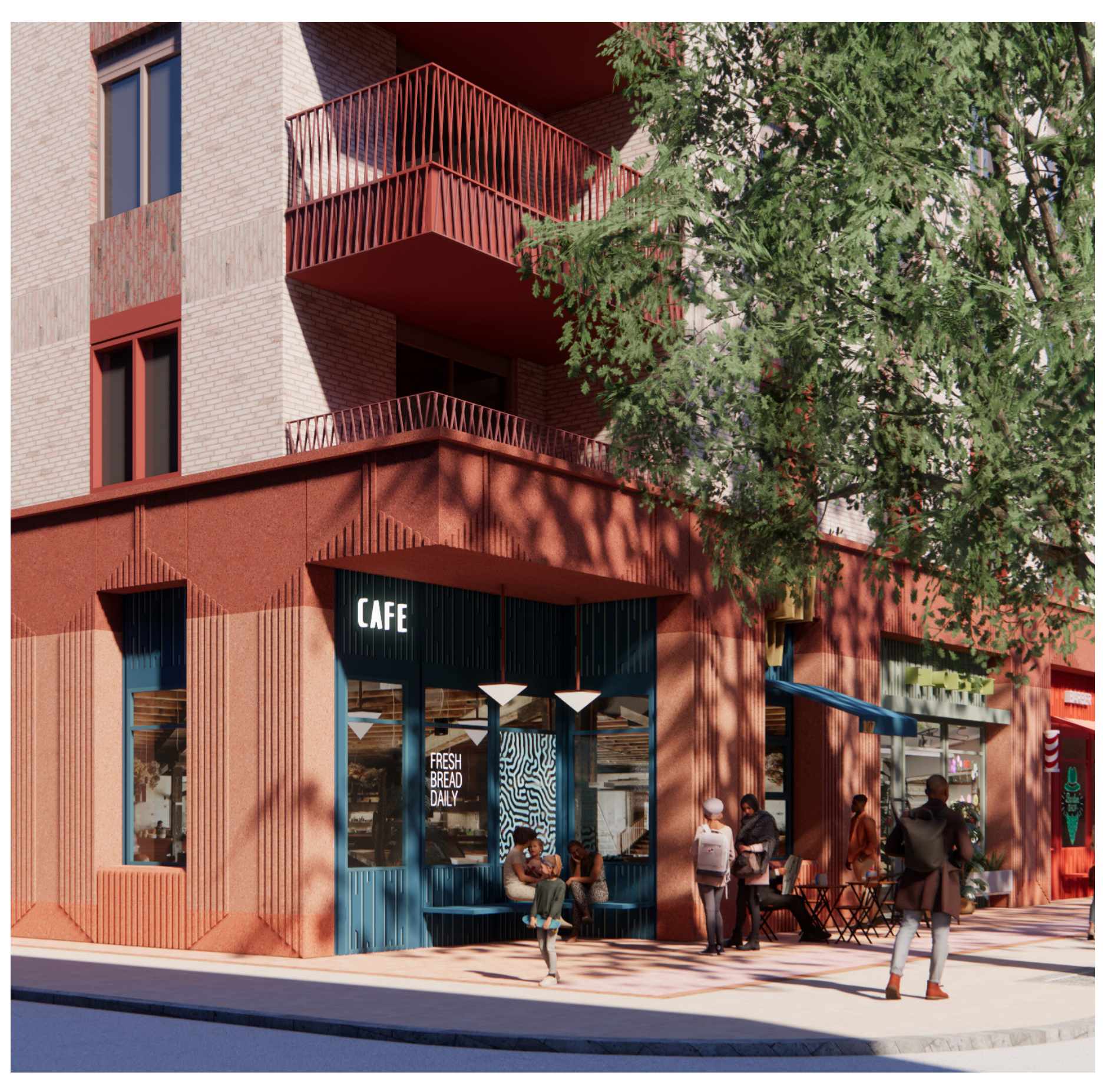
Proposed view to SE corner of H2