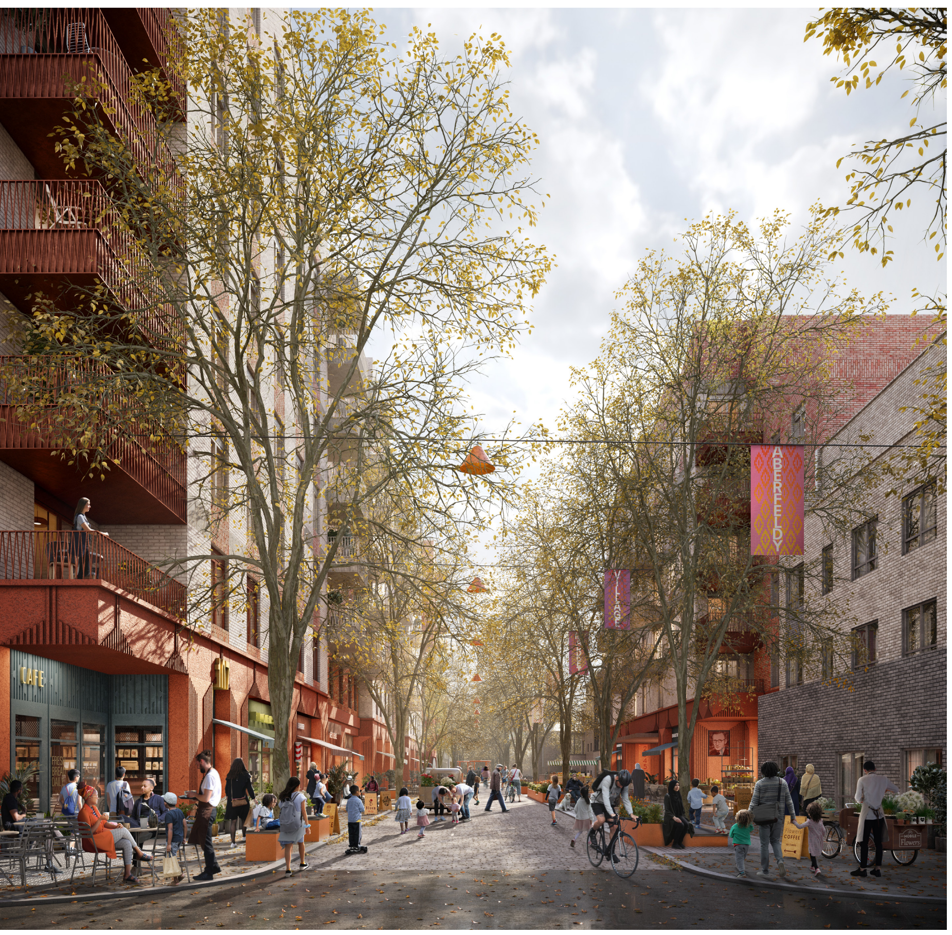
Proposed View up Aberfeldy Street