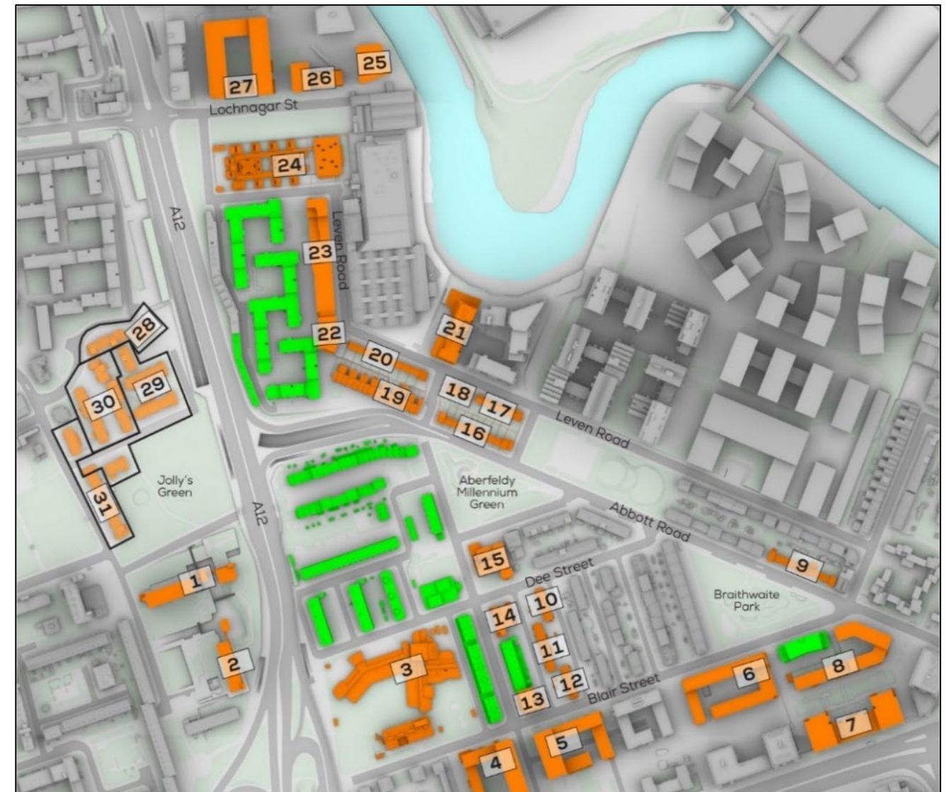
Figure 14.1 Existing Daylight and Sunlight Receptors