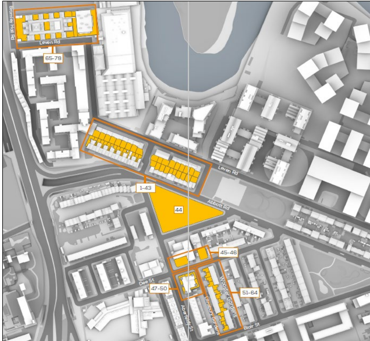
Figure 14.3 External Overshadowing Receptors