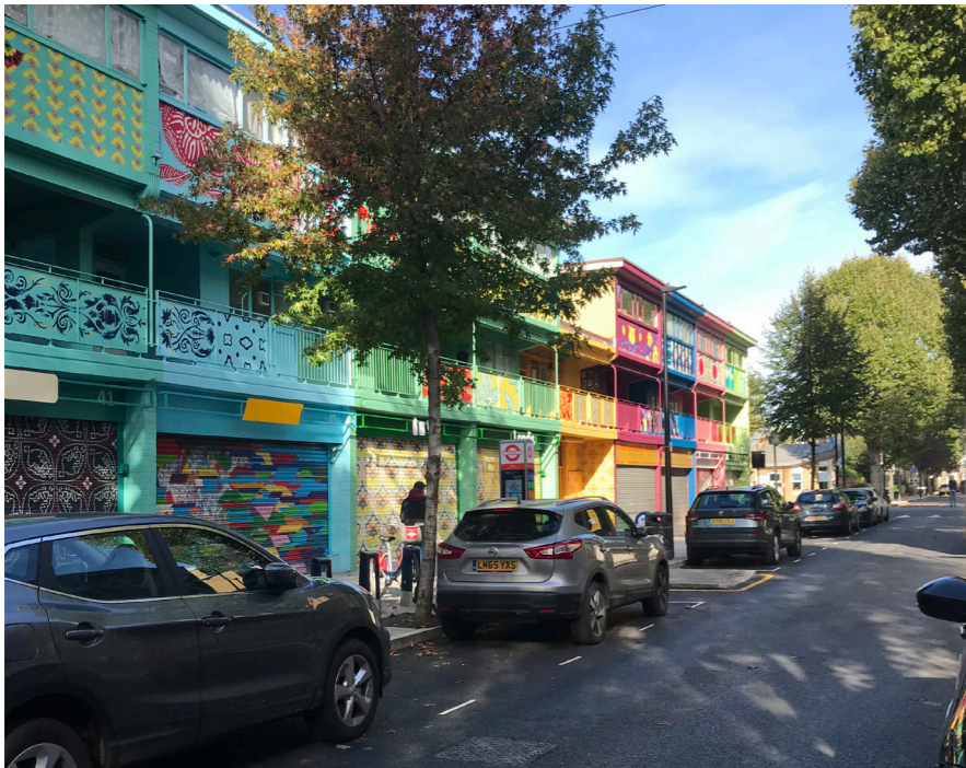
1 3 Existing buildings to the West of the plot looking North on Aberfeldy Street