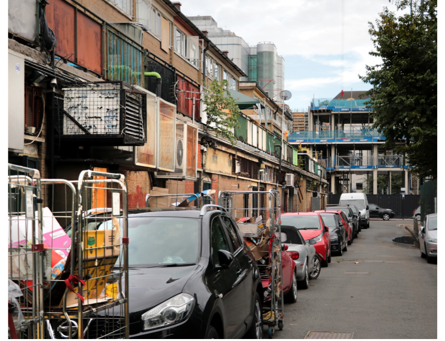
4 Kirkmichael Road looking South