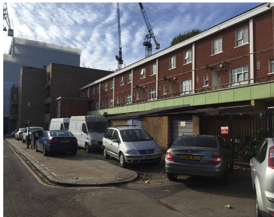
6 Lansbury Gardens existing parking looking South-West