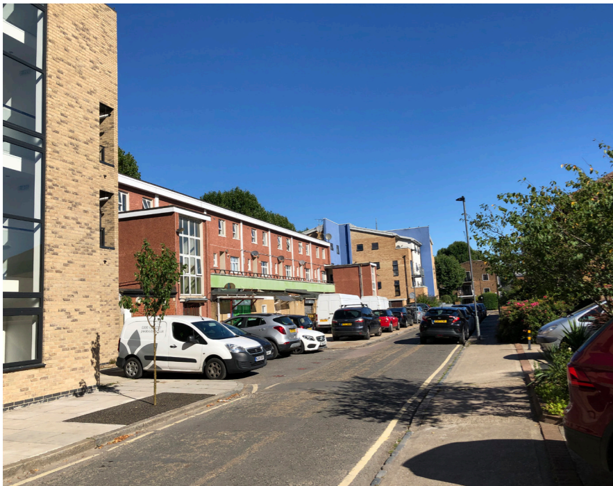
5 Lansbury Gardens looking North