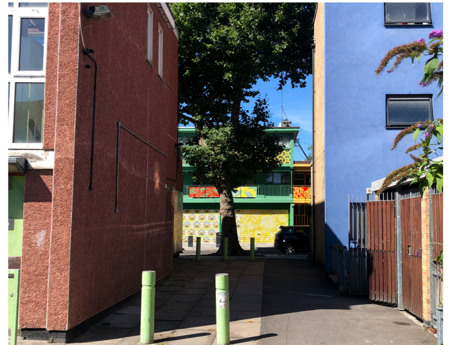
7 Connection between Aberfeldy Street and Lansbury Gardens