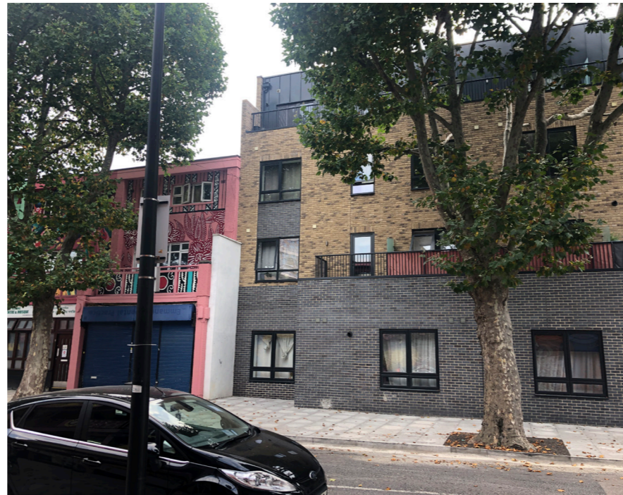
2 8 Loren Apartments to the South West of the plot showing the existing party wall condition.