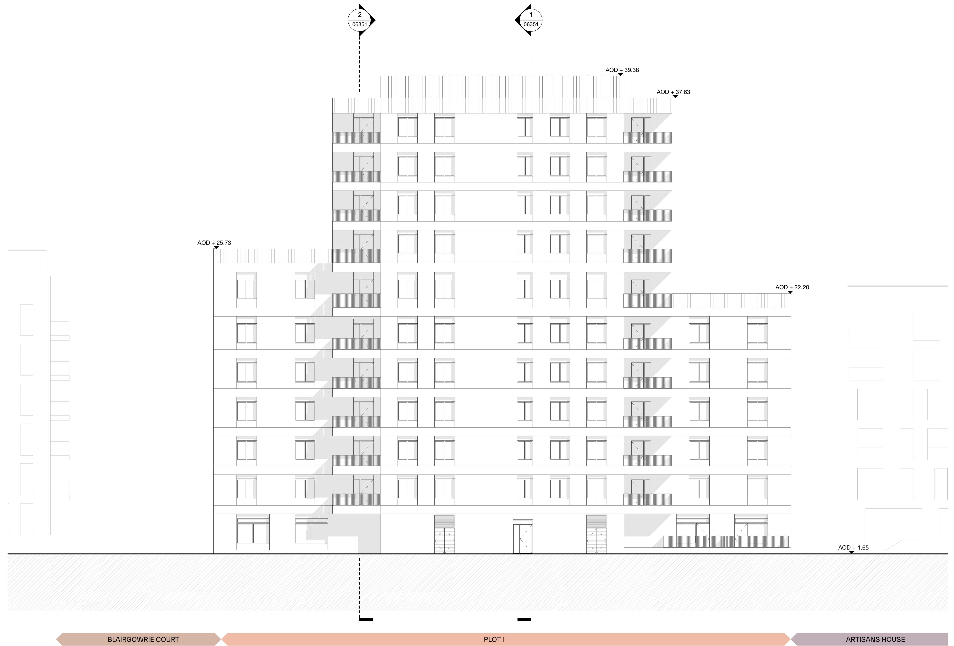
1 06252 Bi ELE S 1 : 150

SUPPLEMENTARY INFORMATION: These drawings reflect the current position of the scheme development at RIBA Stage 2, they should be read in conjunction with the following information prepared by Morris+Company: - Aberfeldy Village, Phase A, Design and Access Statement Drawings should be read in conjunction with information prepared by other consultants (where applicable): - Landscape Design Drawings (LDA) - Structural Engineers Drawings and Specification (MEINHARDT) - MEP Engineers Drawings and Specification (MEINHARDT) EXTENTS AND BOUNDARIES: These drawings combine survey and site information produced by others and as such should be verified for accuracy. Existing site information, context, surrounding infrastructure, neighboring building extents and plots are derived from 2D Surveys, produced by: 'Sumo Services Ltd' Drawing numbers: SOR018502 / SOR018561/ SOR016539 Date of creation: 17.12.2020 / 14.01.2021 / 09.12.2019 'Aworth Survey Consultants' Drawing numbers: 3553-2/5/6/7 Date of creation: 18.12.2009 The application boundary has been derived by title plan and land ownership reports and produced by: Velocity Transport Drawing no: 4060-1100-T-023 Produced: Dec 20 Spot levels are defined as AOD and reflected in metres NOTES: