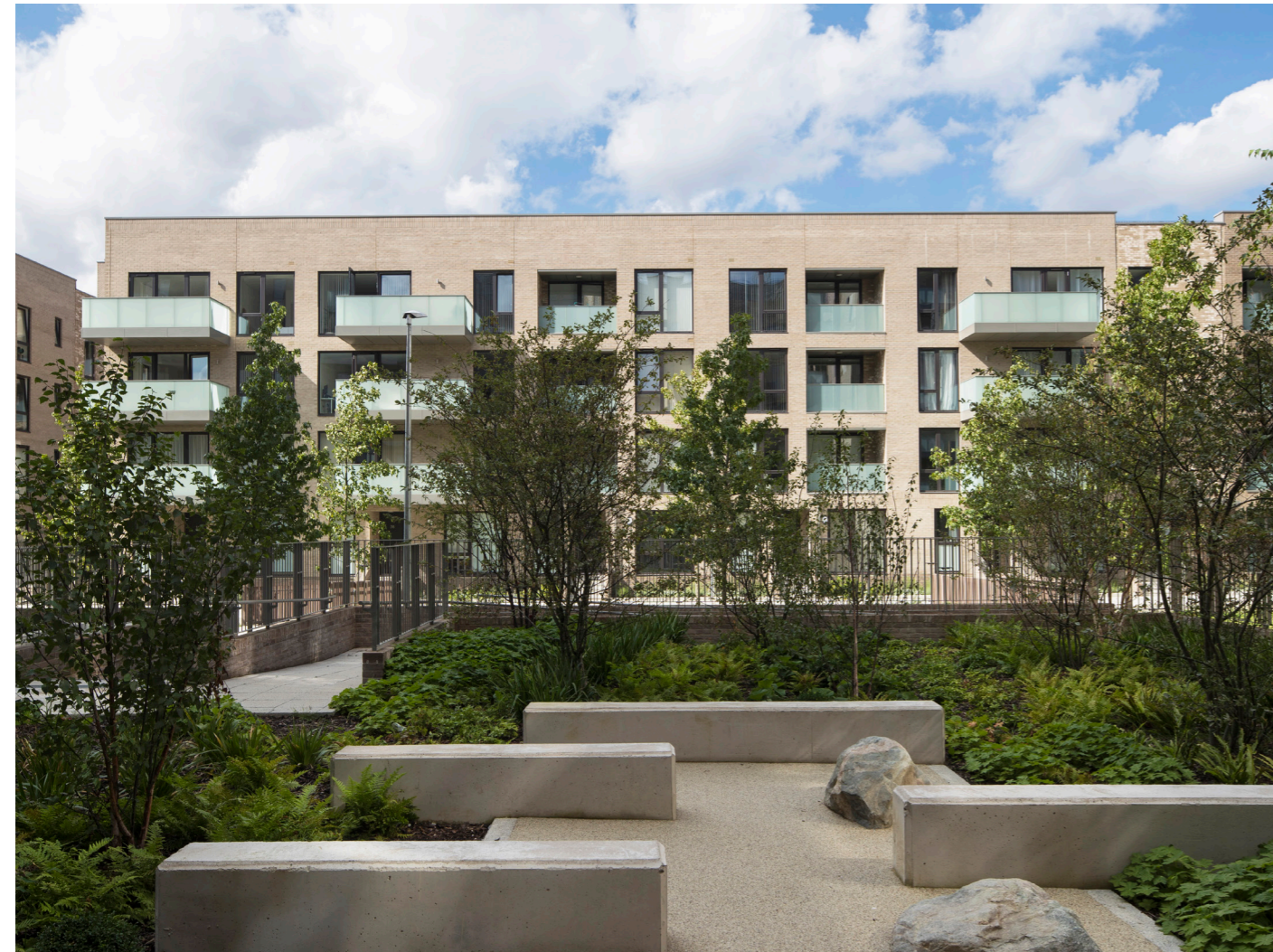
Fig.3 Phases 1-3 of the previously approved Aberfeldy Village Masterplan

The development would result in a substantial number of new homes of different sizes and tenures, including new affordable homes which will contribute significantly to the London Borough of Tower Hamlets' and London's housing need requirements.