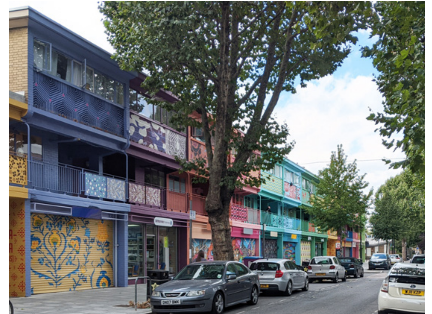
Fig.4 Aberfeldy Street today

However, notwithstanding the inherent complexities of this estate regeneration project, and the challenging viability context, it remains that the overall heights strategy for the Proposed Development, which includes tall buildings, fully align with LBTH's policy and guidance. In order to assist the Council in its assessment of the proposed tall buildings, a detailed commentary is provided in this document.