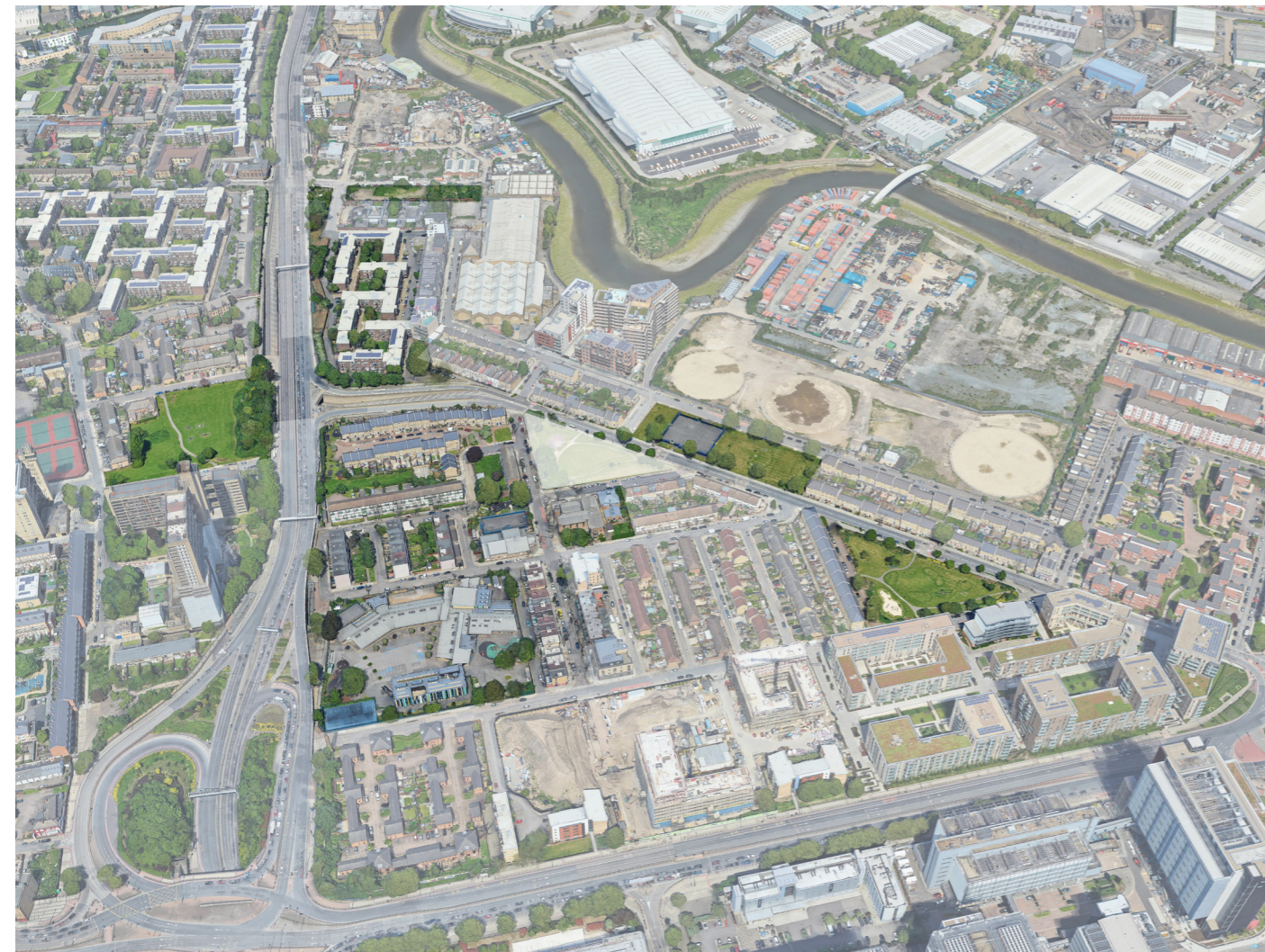
Fig.5 Aerial view showing the Site

A Built Heritage Assessment prepared by KM Heritage and a Townscape and Visual Impact Assessment prepared by The Townscape Consultancy have been undertaken in support of this hybrid planning application.