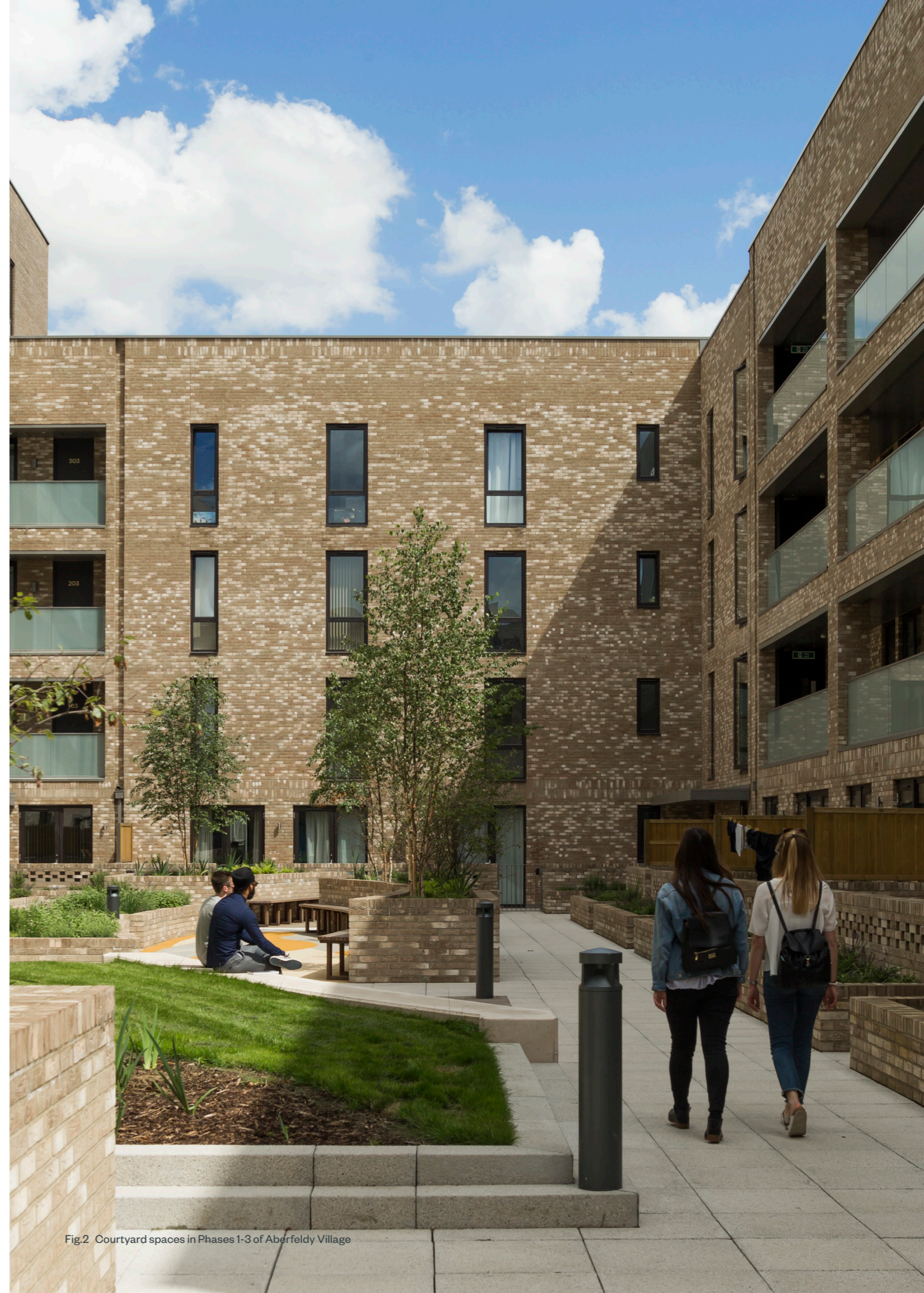
Fig.2 Courtyard spaces in Phases 1-3 of Aberfeldy Village

The Aberfeldy Village Masterplan sets out to deliver a substantial package of benefits for existing residents and the wider Poplar area. The plans have been shaped by the local community and reflect their desire for new homes, more attractive open spaces, safer streets, a stronger retail offering and upgraded community facilities. The Applicant is confident that the Proposed Development will match and exceed these expectations.