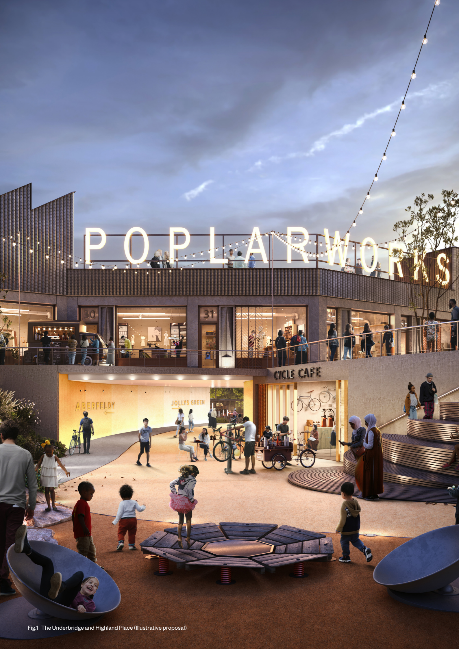
Fig.1 The Underbridge and Highland Place (Illustrative proposal)