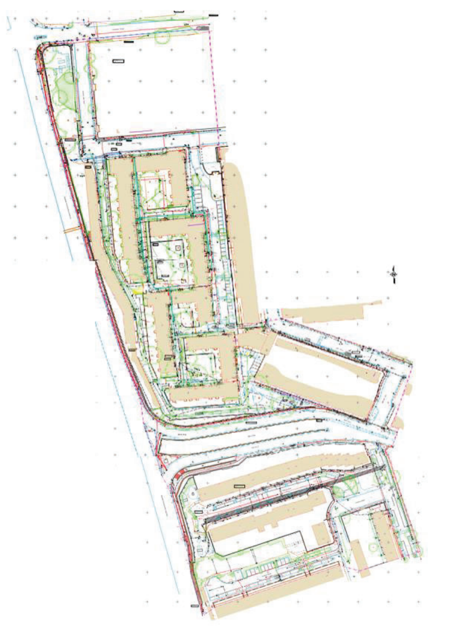
Figure 2: Topographical Survey

Based on these surveys the existing private drainage network consists of surface water, foul water and combined water pipes and manholes. All of the existing private drainage has been shown to be draining to the closest Thames Water public sewer via multiple existing connections to the Thames Water surface and combined water sewers crossing through the site.