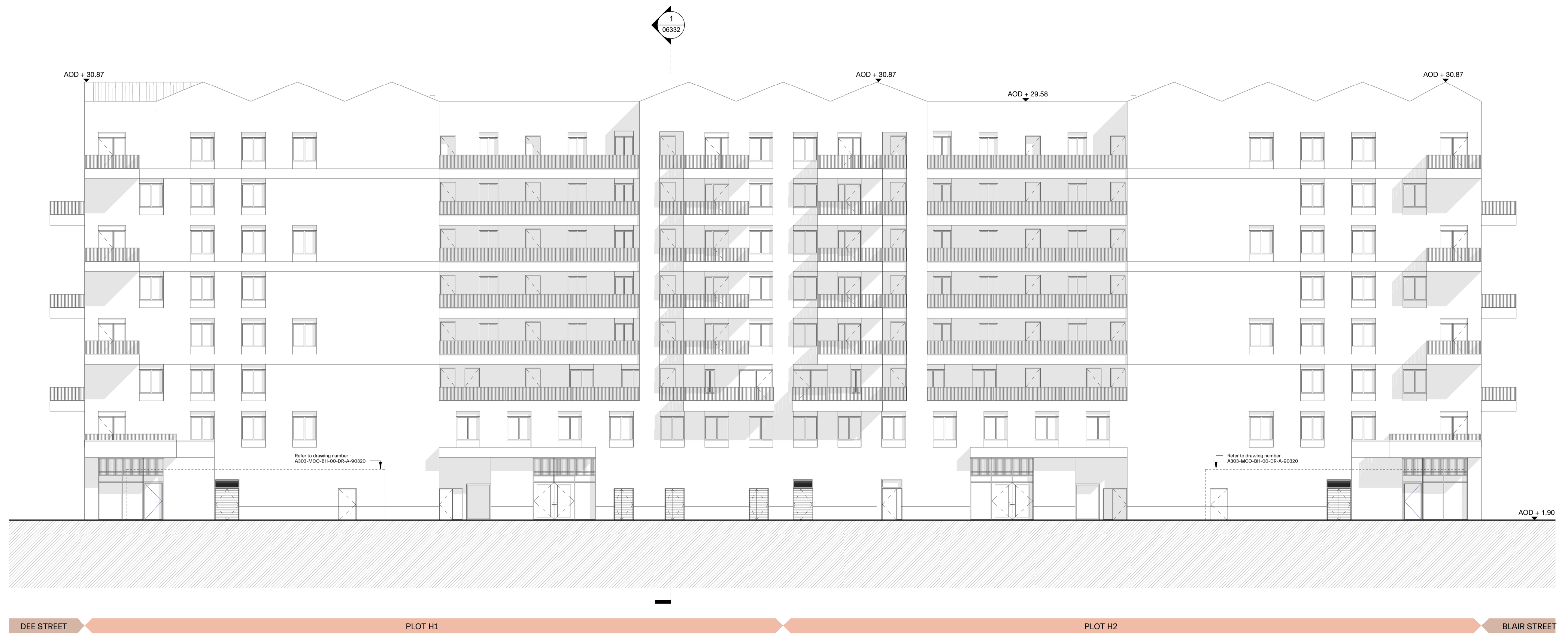
1 06232 BH1/2 ELE W 1 : 150