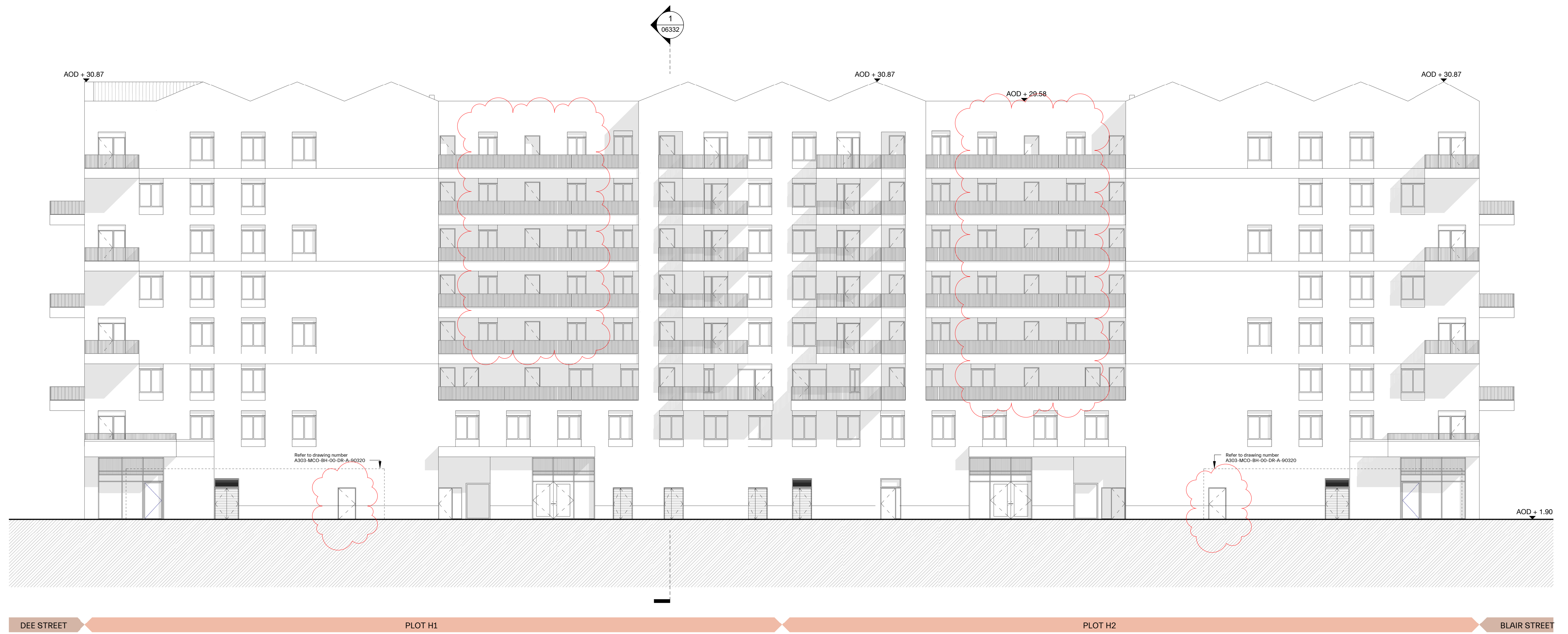
1 06232 BH1/2 ELE W 1 : 150

SUPPLEMENTARY INFORMATION: These drawings reflect the current position of the scheme development at RIBA Stage 2, they should be read in conjunction with the following information prepared by Morris+Company: - Aberfeldy Village, Phase A, Design and Access Statement Drawings should be read in conjunction with information prepared by other consultants (where applicable): - Landscape Design Drawings: (LDA) - Structural Engineers Drawings and Specification: (MEINHARDT) - MEP Engineers Drawings and Specification: (MEINHARDT)