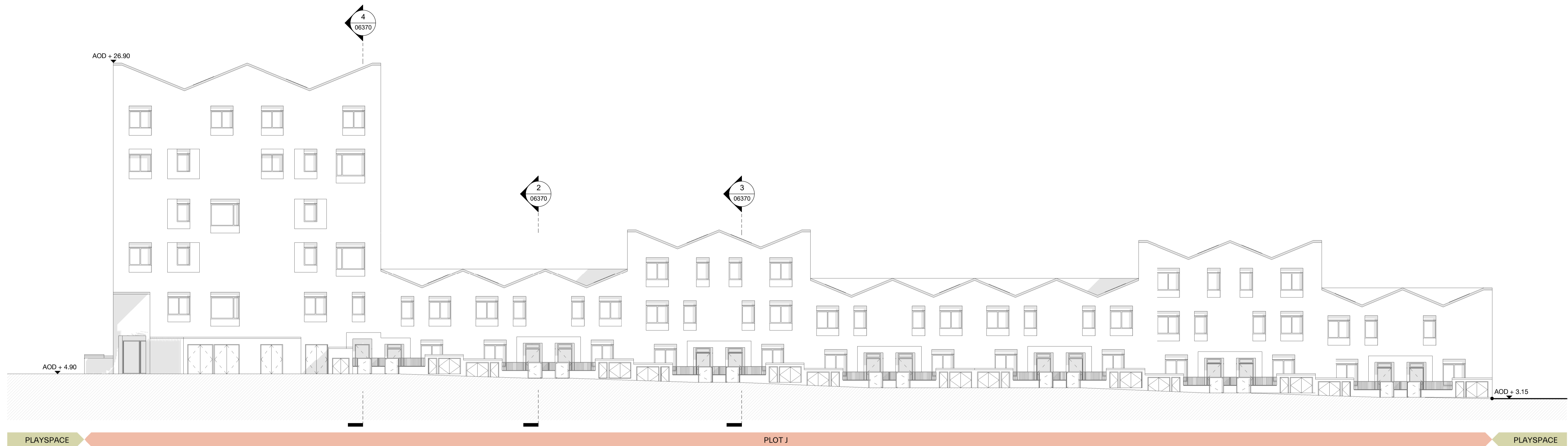
1 BJ ELE N 06270 1 : 150