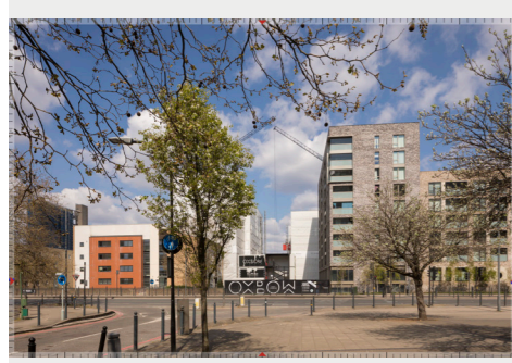
25 | Nutmeg Lane