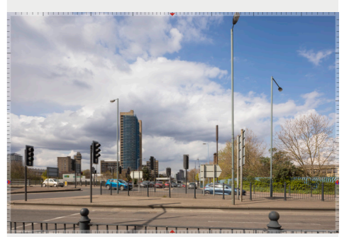
30 | A12, junction with East India Dock Road, looking north