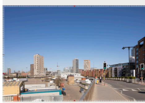
27 | Trafalgar Way