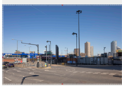
26 | Upper Bank Street