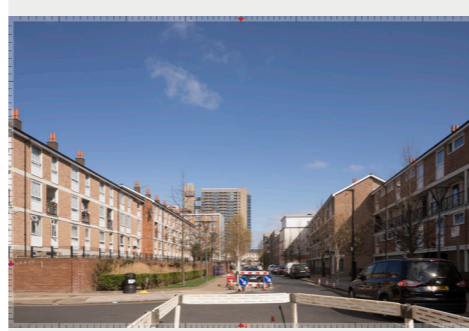
33 | Brownfield Street, outside no.30