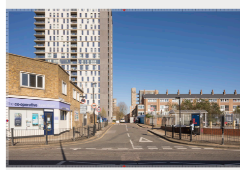
29 | Crisp Street, looking along Willis Street