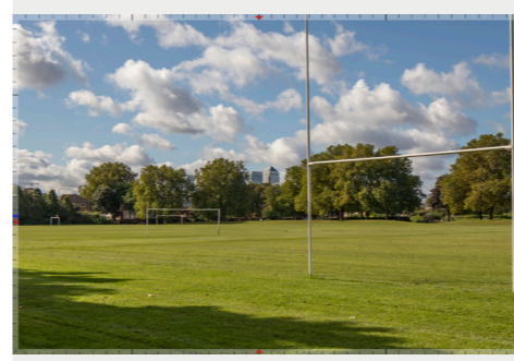
34 | Memorial Recreation Ground