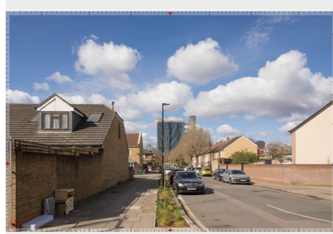
31 | Dee Street / Abbott Road