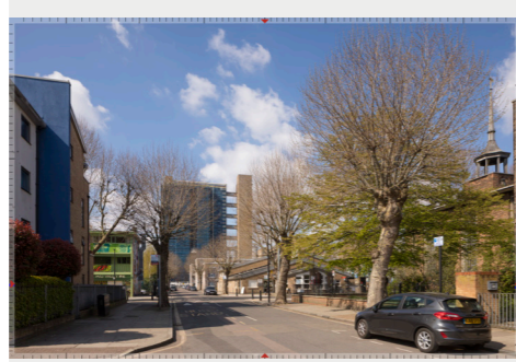
32 | Dee Street, midway