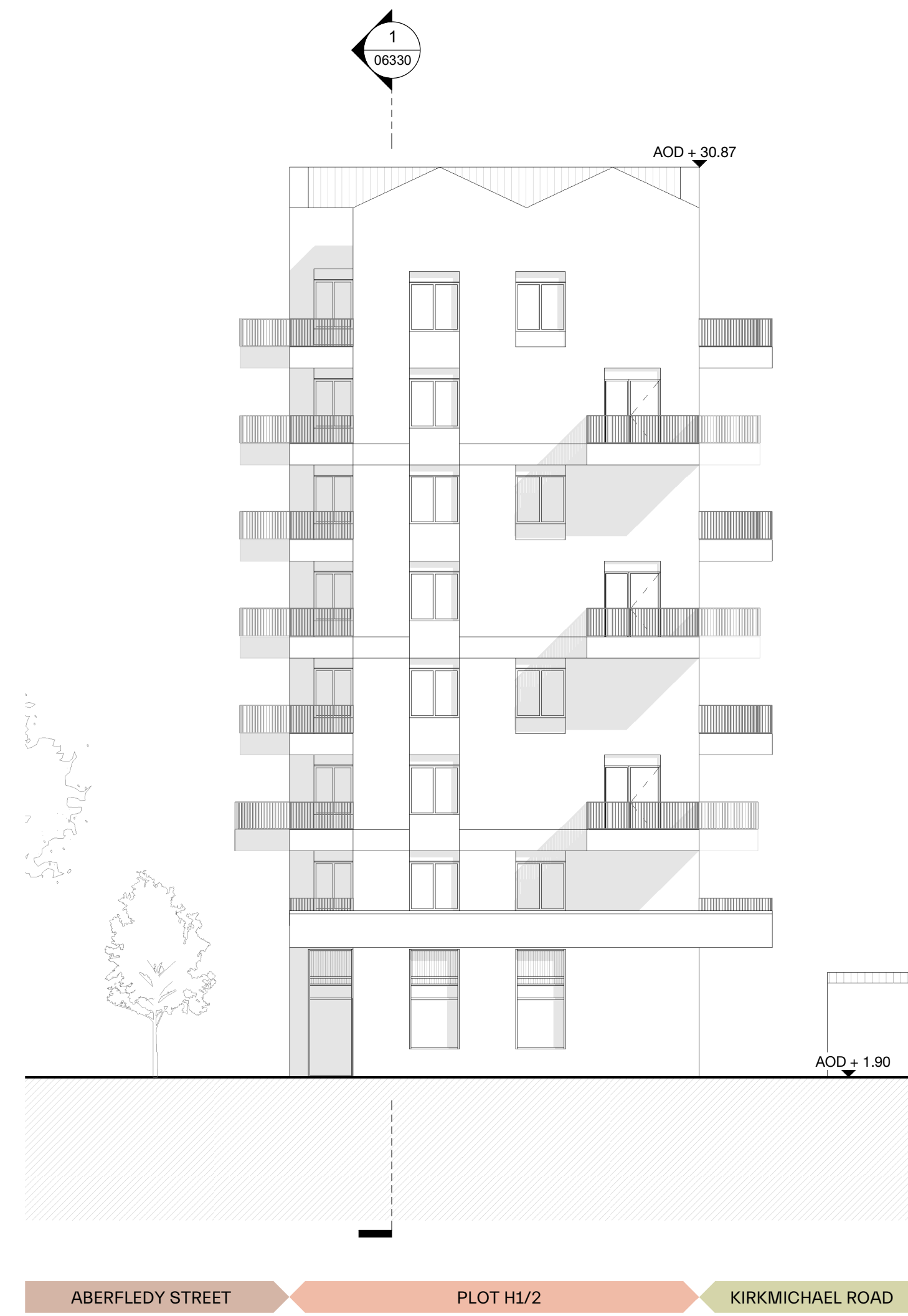
1 06230 BH1/2 ELE N 1 : 150