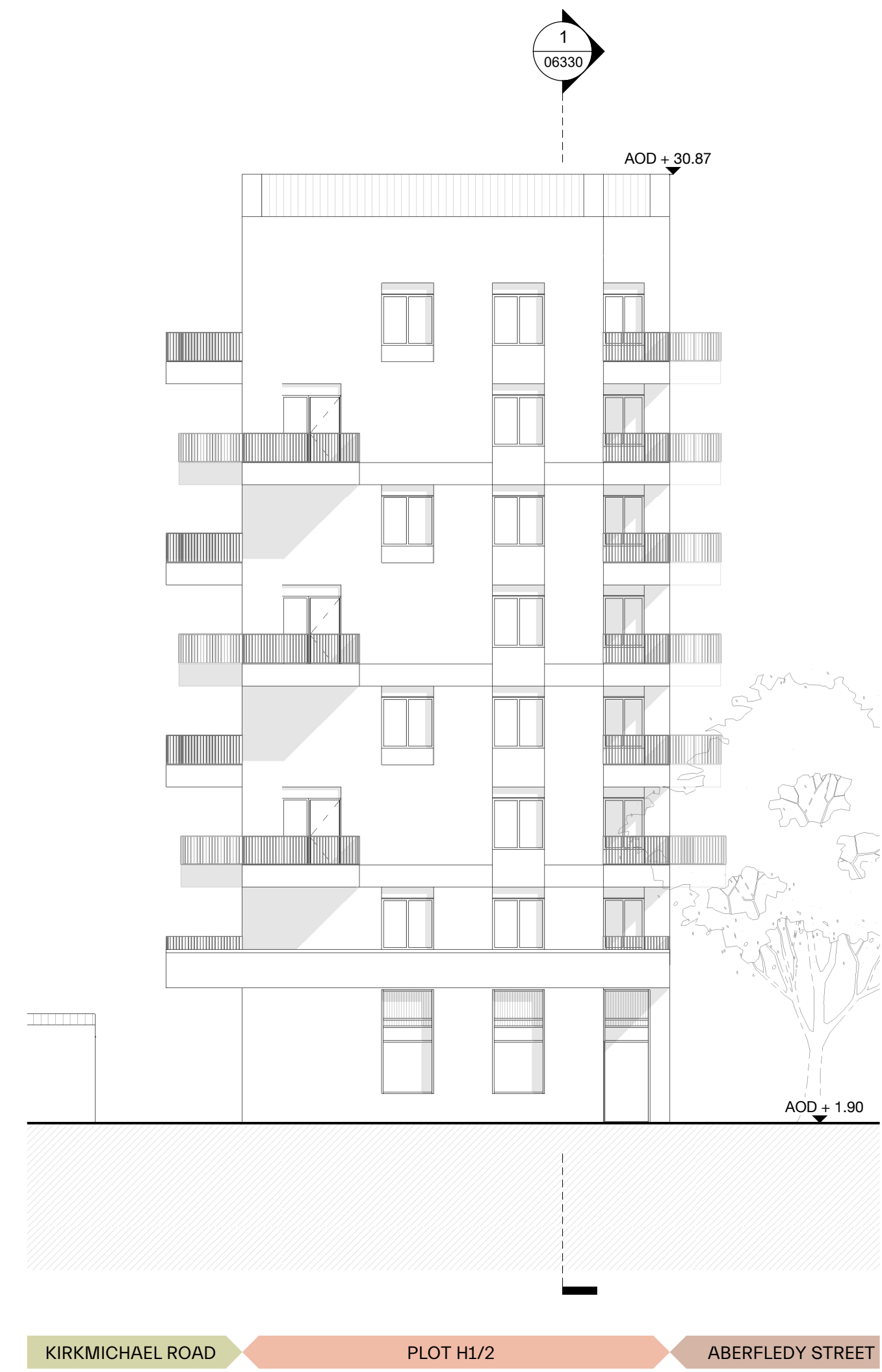
2 06230 BH1/2 ELE S 1 : 150

SUPPLEMENTARY INFORMATION: These drawings reflect the current position of the scheme development at RIBA Stage 2, they should be read in conjunction with the following information prepared by Morris+Company: - Aberfeldy Village, Phase A, Design and Access Statement Drawings should be read in conjunction with information prepared by other consultants (where applicable): - Landscape Design Drawings (LDA) - Structural Engineers Drawings and Specification. (MEINHARDT) - MEP Engineers Drawings and Specification. (MEINHARDT)