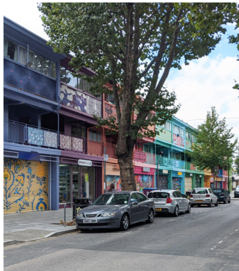
5 Fig.12 Aberfeldy Street