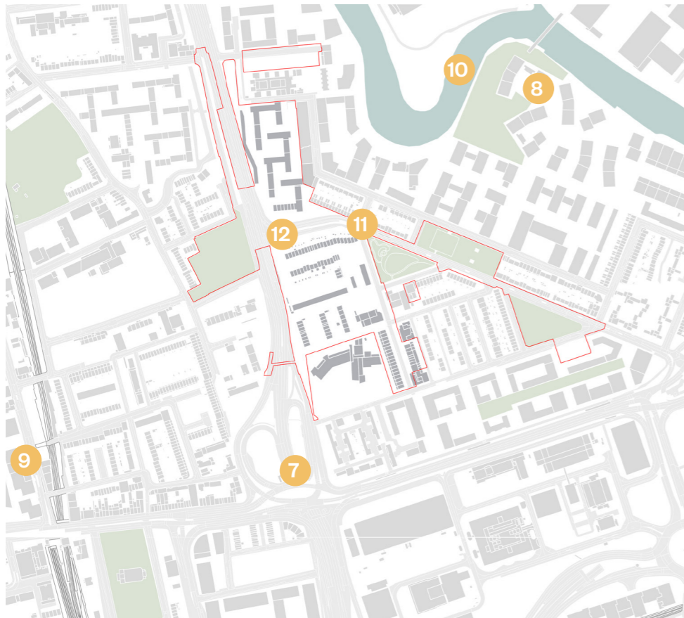
Fig.18 Key location plan