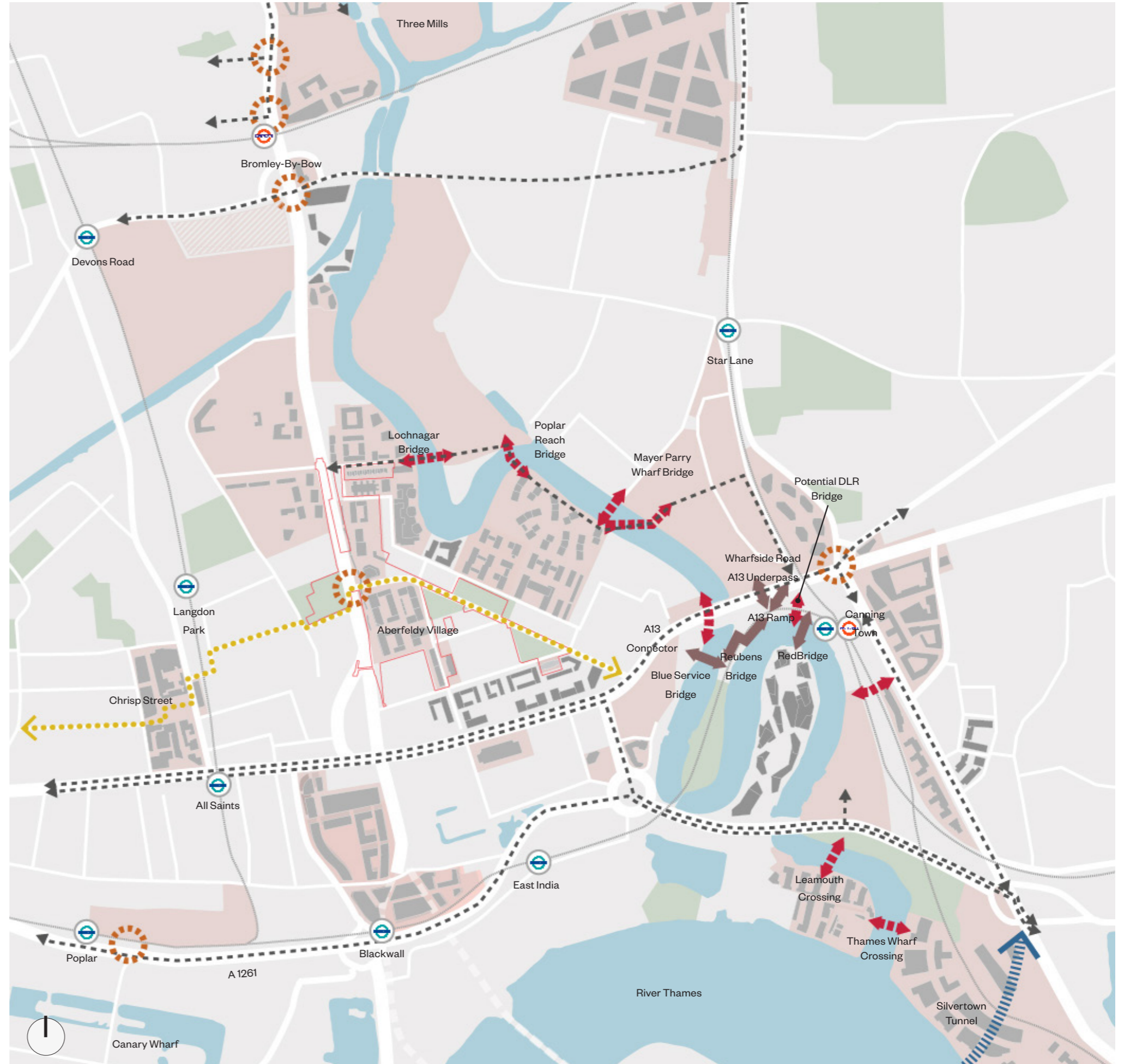
Fig.21 Diagram showing emerging connections and development