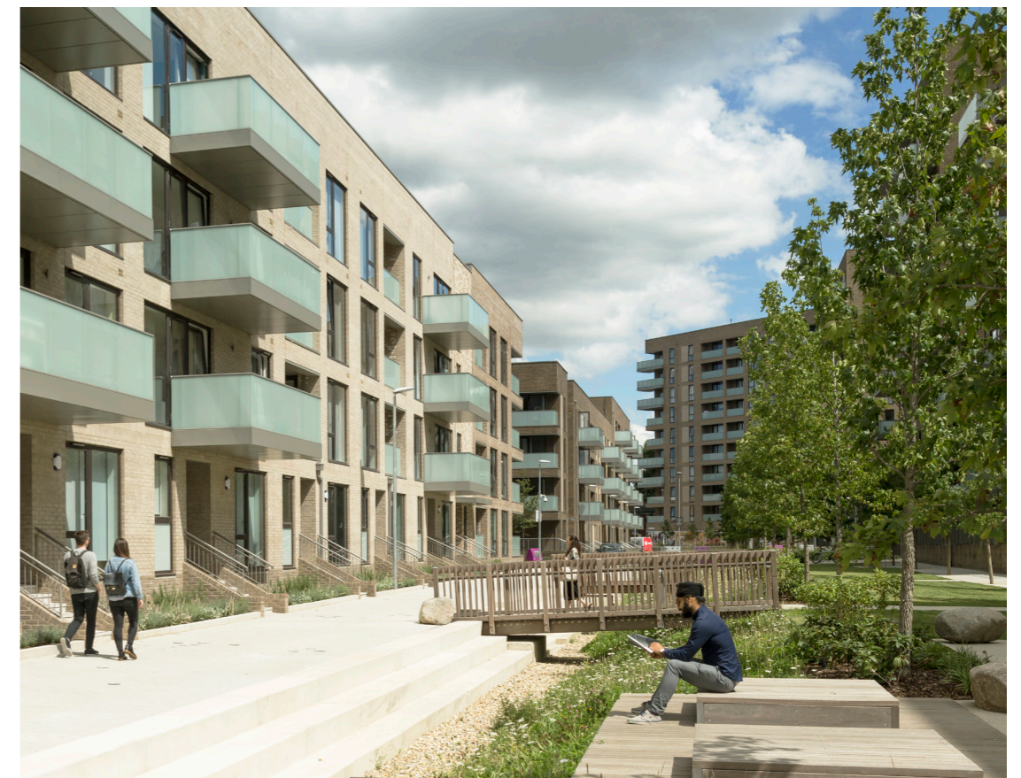
6 Fig.13 Aberfeldy Village Phases 1-3 and East India Green