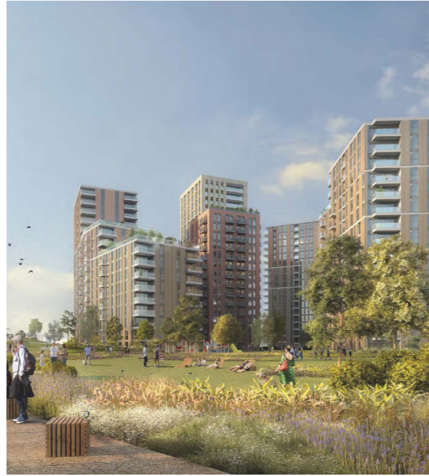
8 Fig.15 CGI of the emerging Poplar Riverside Park and Leven Road Gasworks development