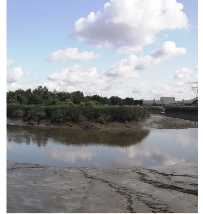
10 Fig.17 Views to the Lea River. Emerging bridges will improve connections across the river to the Leaway.