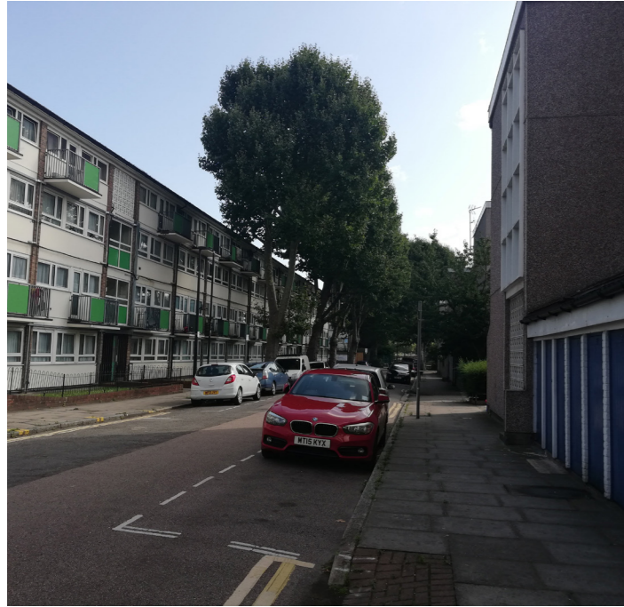
1 Fig.7 Homes on the estate today

Images of the Site and its immediate surroundings are shown across the following pages.