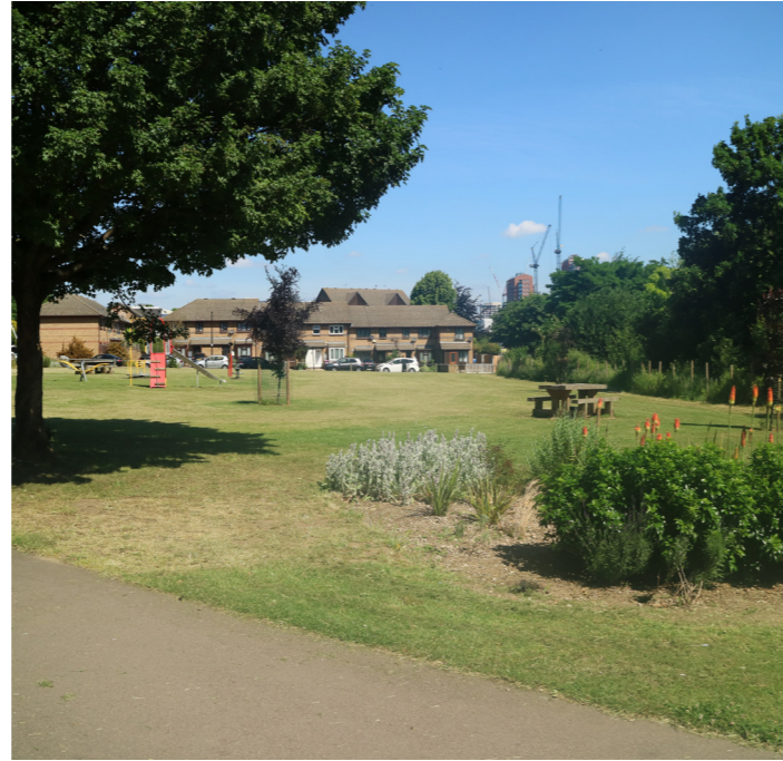
2 Fig.8 Jolly's Green