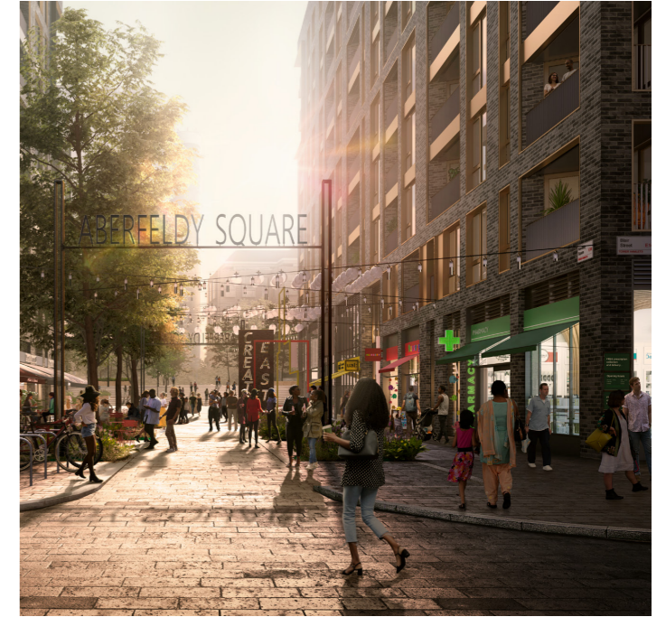
4 Fig.10 CGI of the now completed Aberfeldy Square in Phase 3B of the previously approved Aberfeldy Village Masterplan