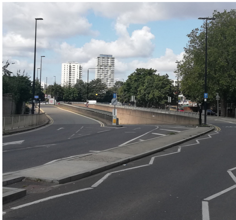
11 Fig.19 Vehicular underpass along Abbott Road crossing the A12. This creates a barrier between Aberfeldy Estate to the south and Nairn Street Estate to the north.