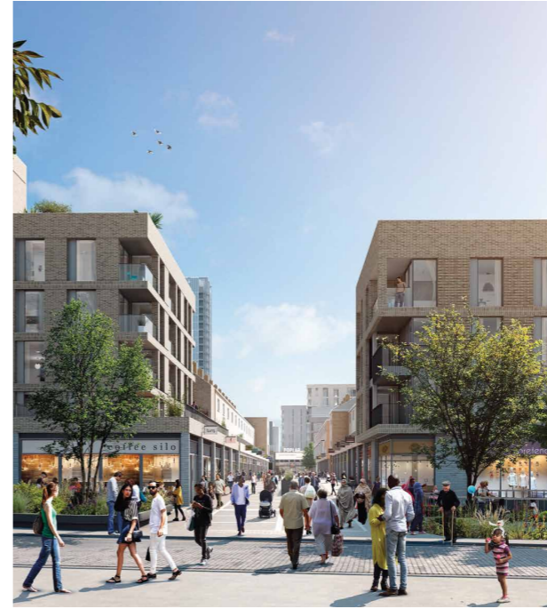
9 Fig.16 CGI of proposals for the Chrisp Street Market development