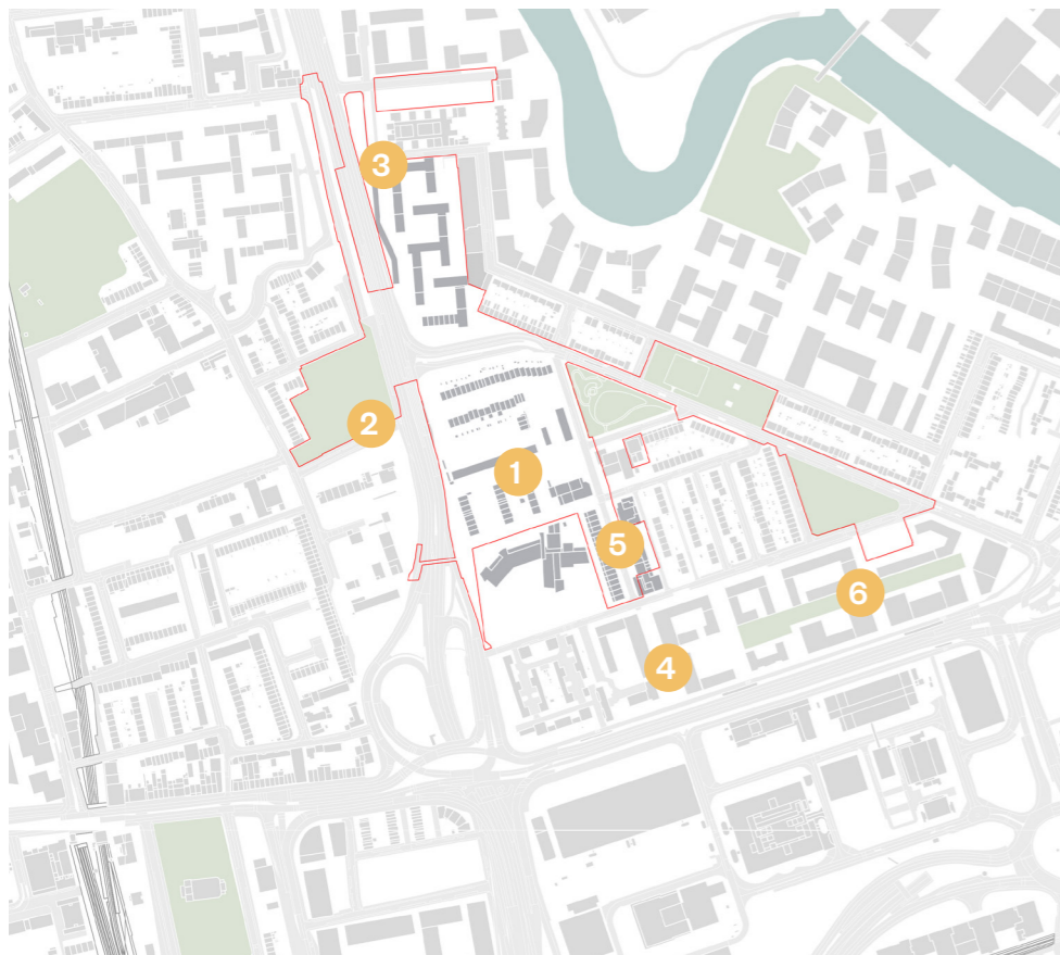
Fig.11 Key location plan