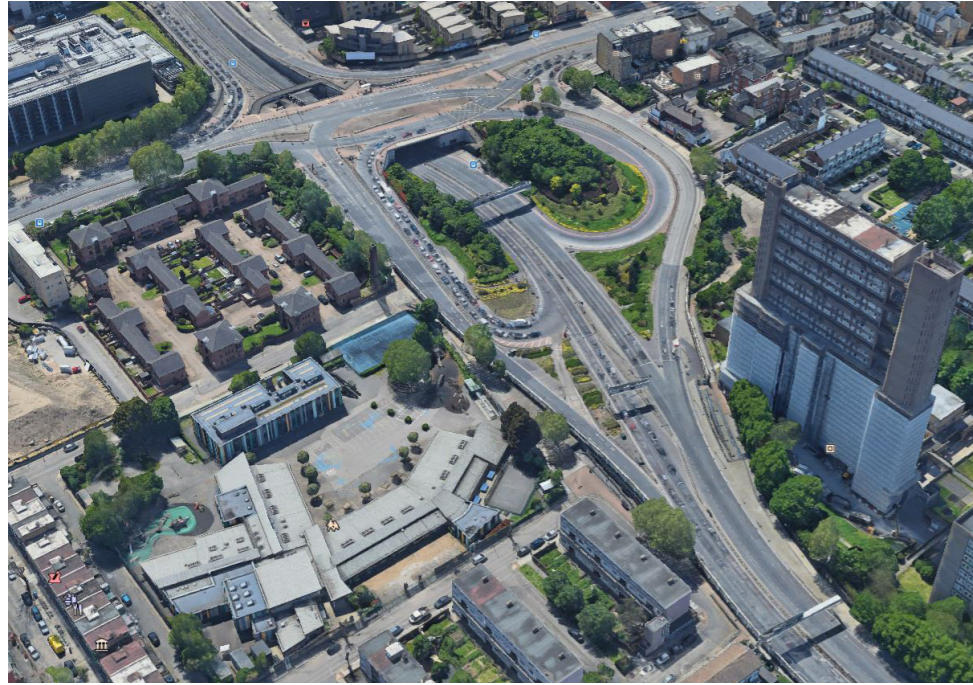
7 Fig.14 Aerial view of the road network at the A12/A13 interchange and entrance to the Blackwall Tunnel