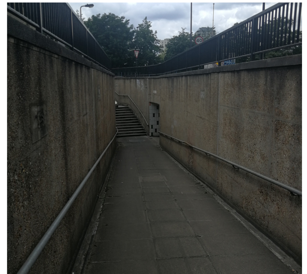
12 Fig.20 The pedestrian underpass through to Jolly's Green is in poor condition and can feel unsafe