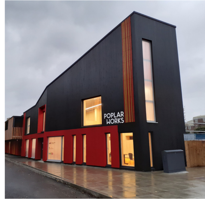
3 Fig.9 Poplar Works