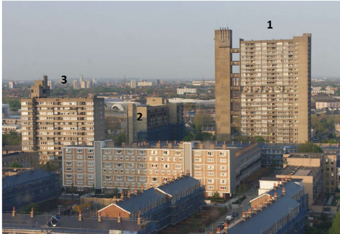
Figure 12: Brownfield Estate looking east, 2013 (1) Balfron (2) Carradale (3) Glenkerry