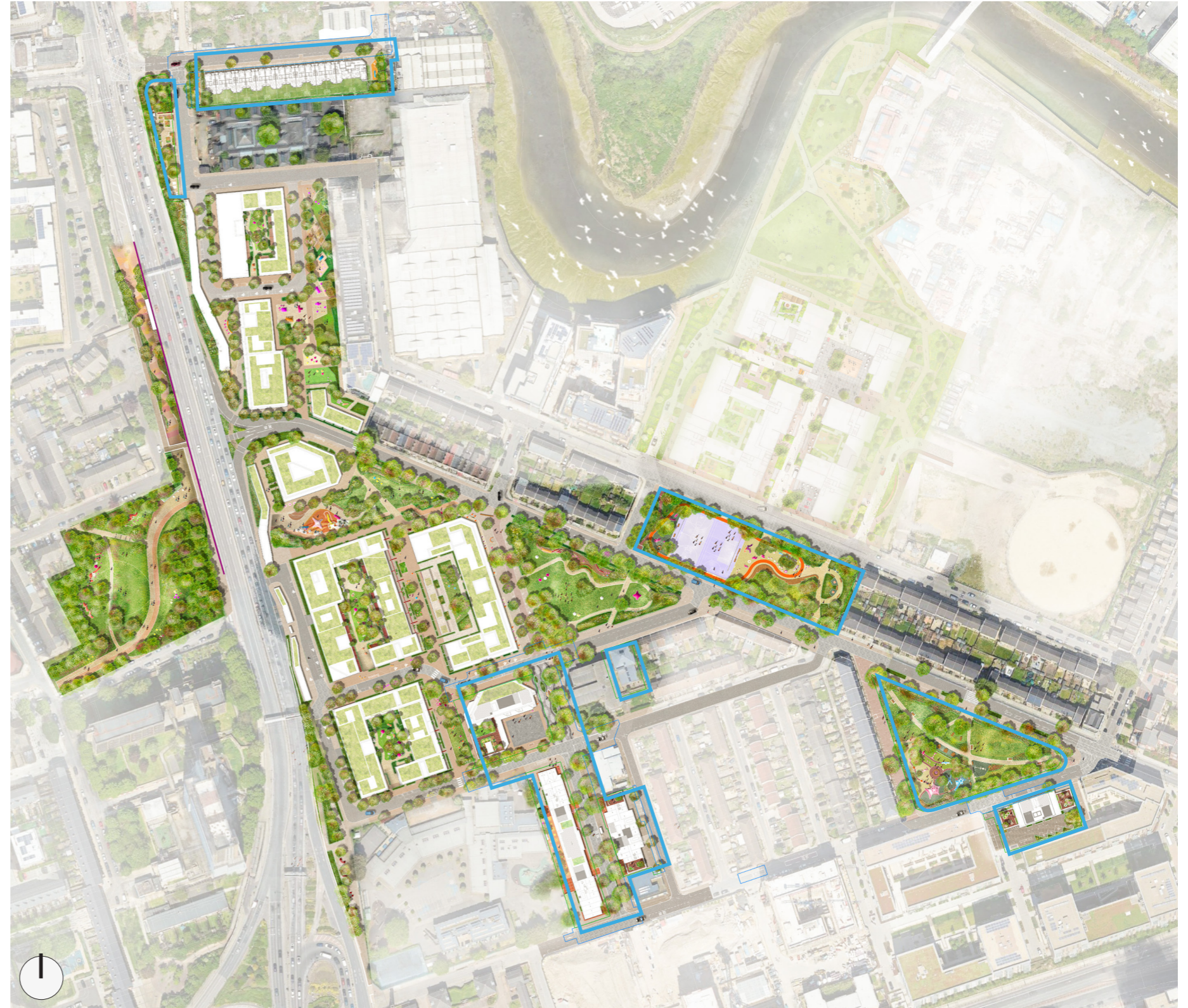
Landscape & public realm site plan.

The approach is to create a framework for the communal life of the public realm: contact with nature, sociability and community interaction, community events, play and independent child mobility