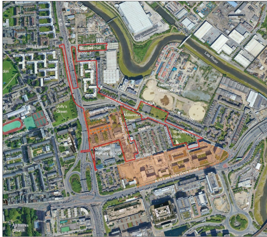
Figure 2 - Site Aerial View

A portion of the site benefits from an extant outline planning permission (ref: PA/11/02716/PO) for the construction of 1,176 residential units, of which 901 will have been constructed following completion of phase 3.