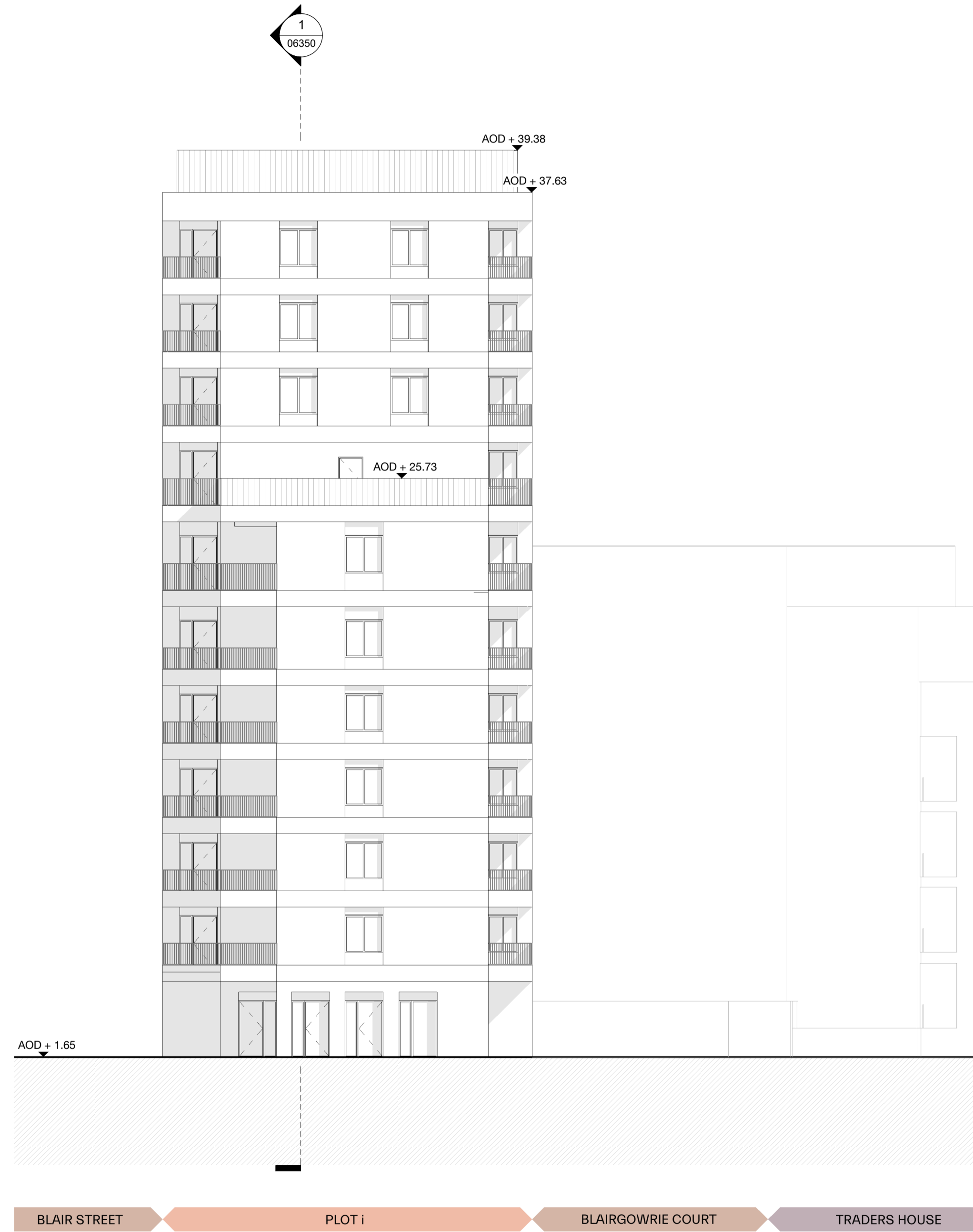
2 06251 Bi ELE W 1 : 150

SUPPLEMENTARY INFORMATION: These drawings reflect the current position of the scheme development at RIBA Stage 2, they should be read in conjunction with the following information prepared by Morris+Company: - Aberfeldy Village, Phase A, Design and Access Statement Drawings should be read in conjunction with information prepared by other consultants (where applicable): - Landscape Design Drawings (LDA) - Structural Engineers Drawings and Specification (MEINHARDT) - MEP Engineers Drawings and Specification (MEINHARDT) EXTENTS AND BOUNDARIES: These drawings combine survey and site information produced by others and as such should be verified for accuracy. Existing site information, context, surrounding infrastructure, neighboring building extents and plots are derived from 2D Surveys, produced by: 'Sumo Services Ltd' Drawing numbers: SOR018502 / SOR018561/ SOR016539 Date of creation: 17.12.2020 / 14.01.2021 / 09.12.2019 'Aworth Survey Consultants' Drawing numbers: 3553-2/5/6/7 Date of creation: 18.12.2009 The application boundary has been derived by title plan and land ownership reports and produced by: Velocity Transport Drawing no: 4060-1100-T-023 Produced: Dec 20 Spot levels are defined as AOD and reflected in metres