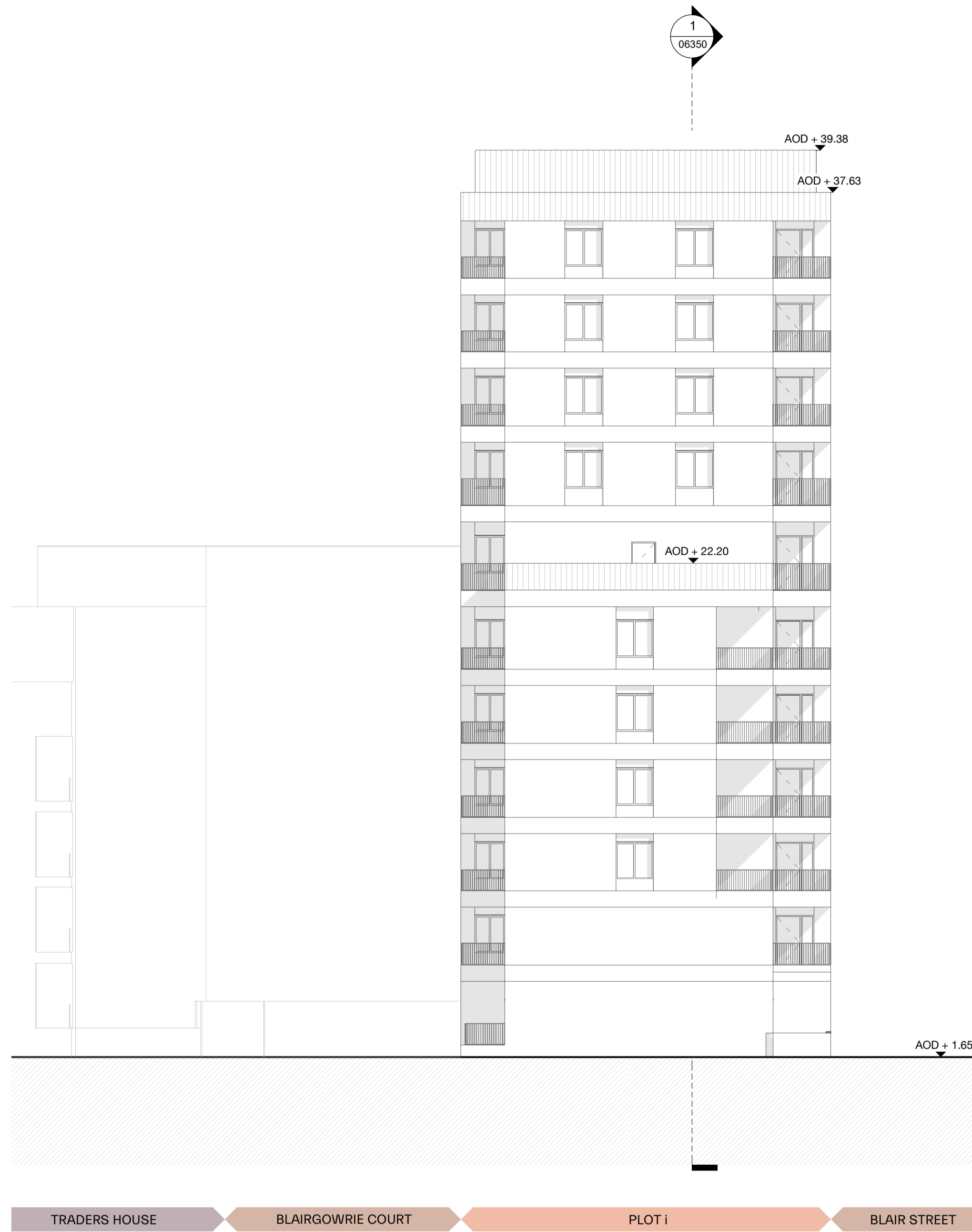
1 06251 Bi ELE E 1 : 150