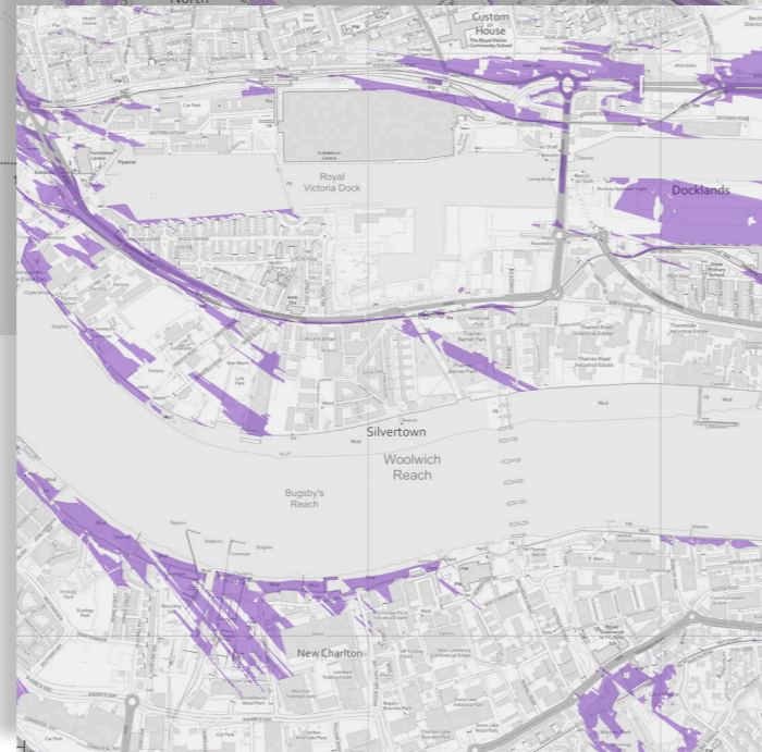
Plan diagram over The Thames Barrier – proposed condition