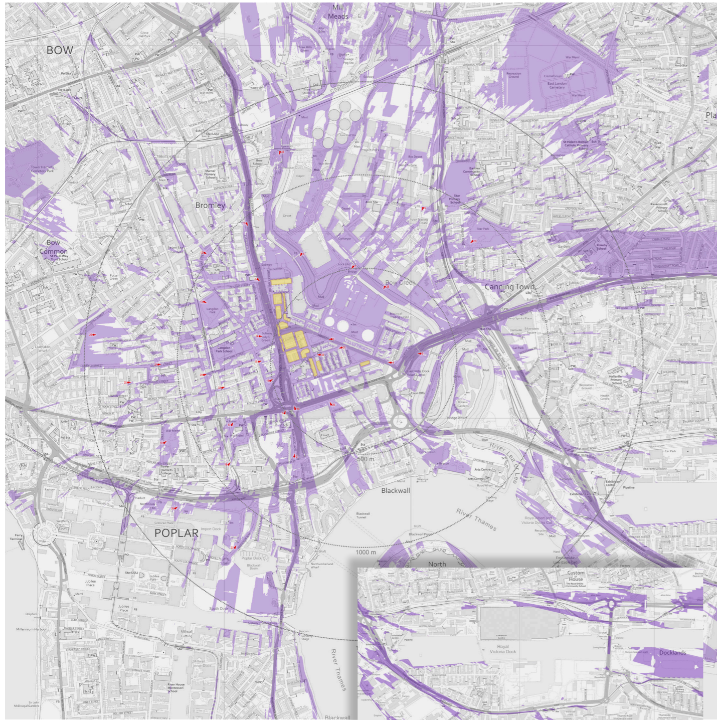
Plan diagram showing areas of visibility – proposed condition