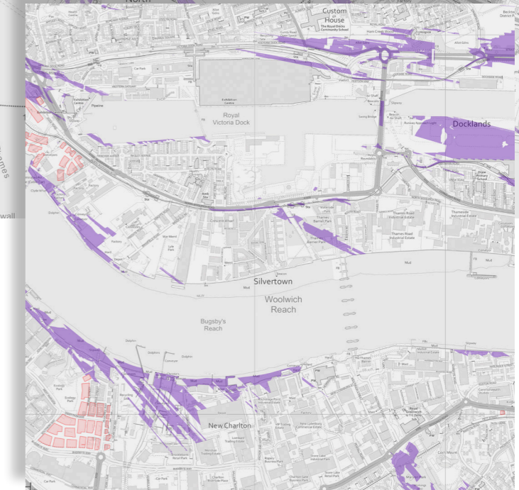
Plan diagram over The Thames Barrier – cumulative condition