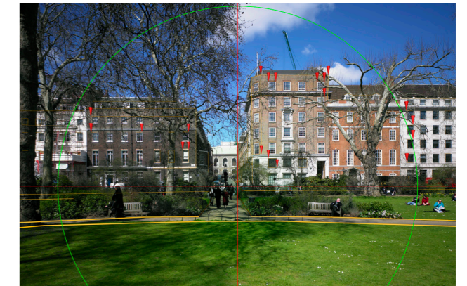
Example of alignment model overlaid on the photograph

alignment model as a record of the match. This was annotated to show the extents of the final views to be used in the study.