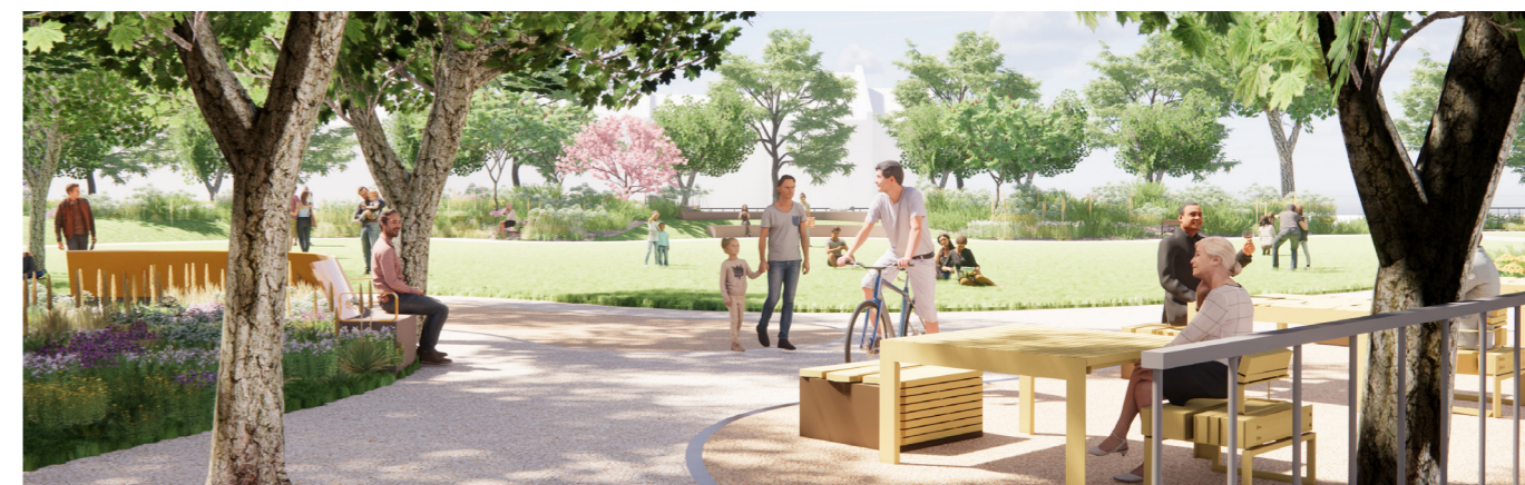
Fig.133 Illustrative view of Millennium Green flexible community space, looking east from the corner of Benledi Road and Aberfeldy Street