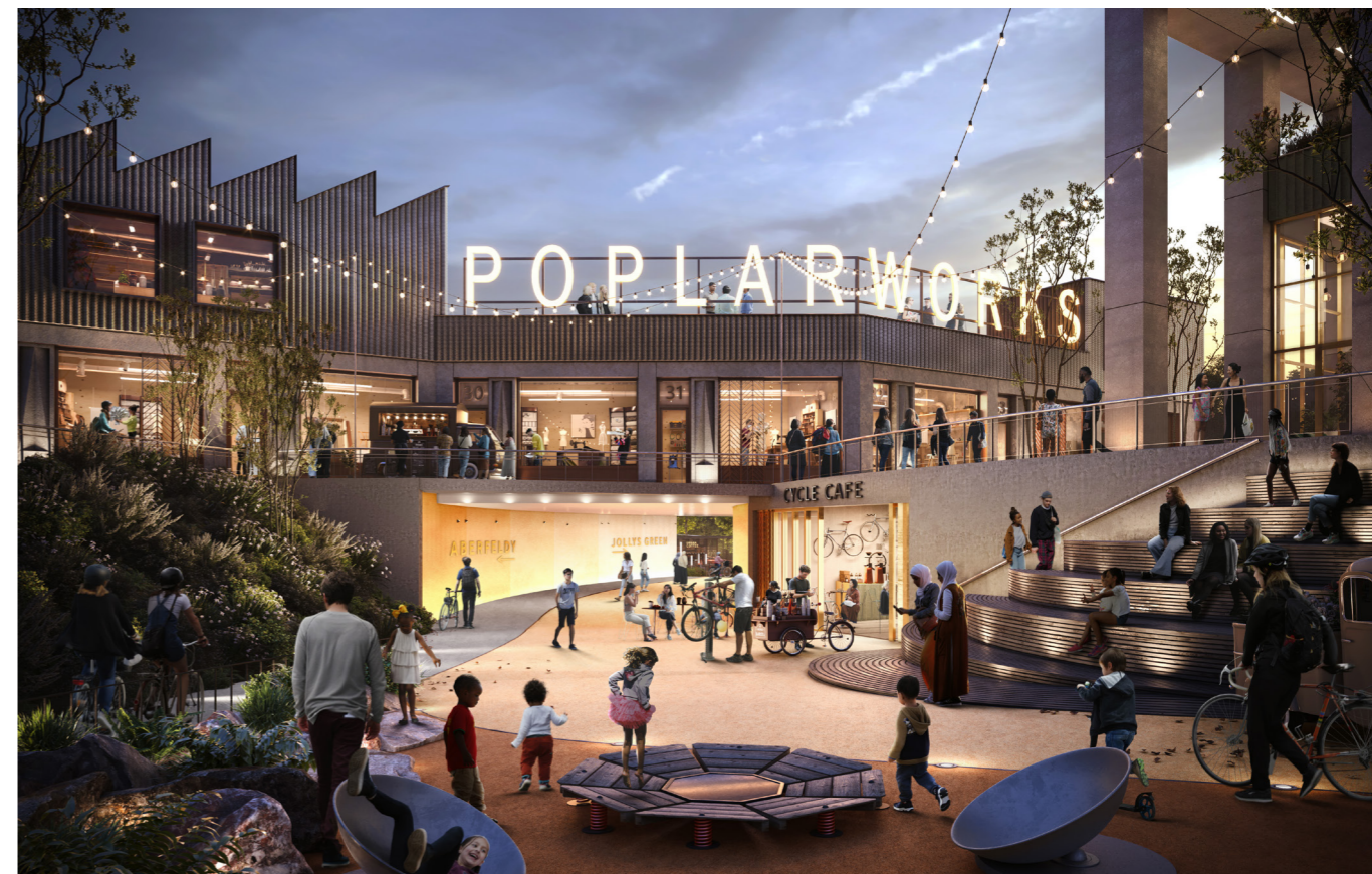
Fig.135 View 01 Illustrative view of Highland Place and the approach to the proposed Underbridge