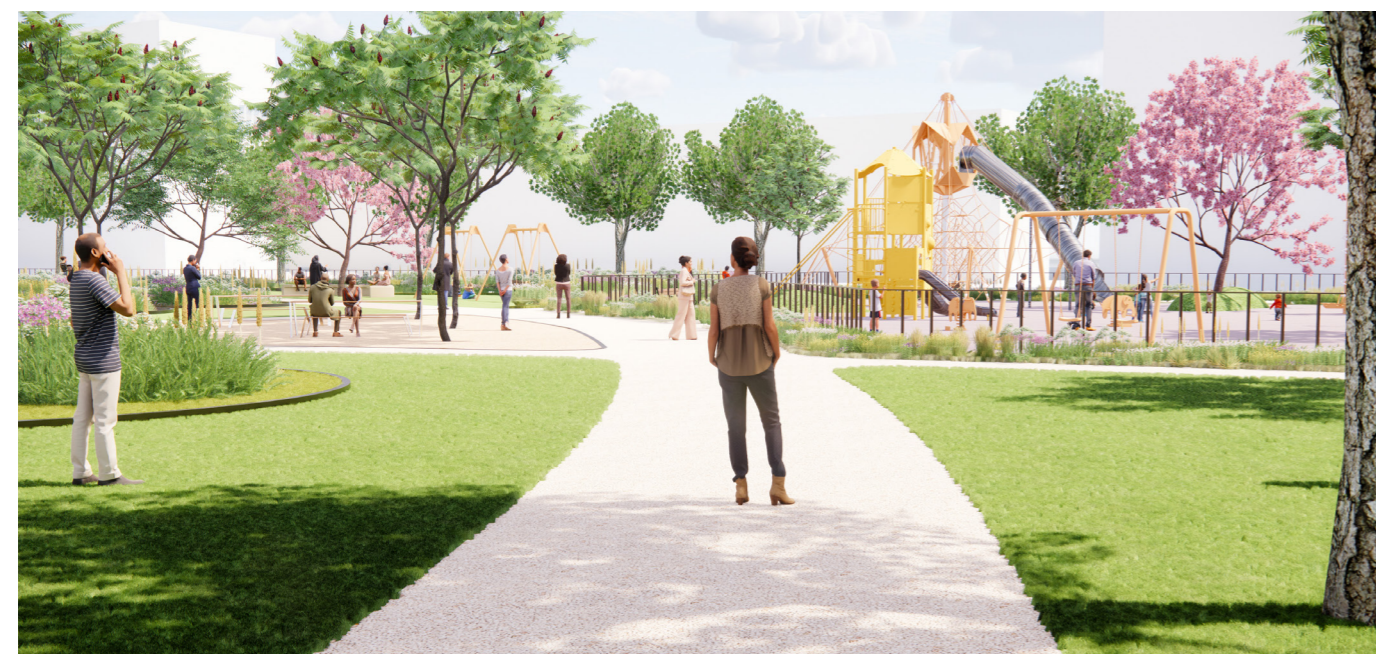
Fig.128 Illustrative view of Braithwaite Park and the dedicated play area, looking south from the entrance on the corner of Abbott Road and Benledi Road