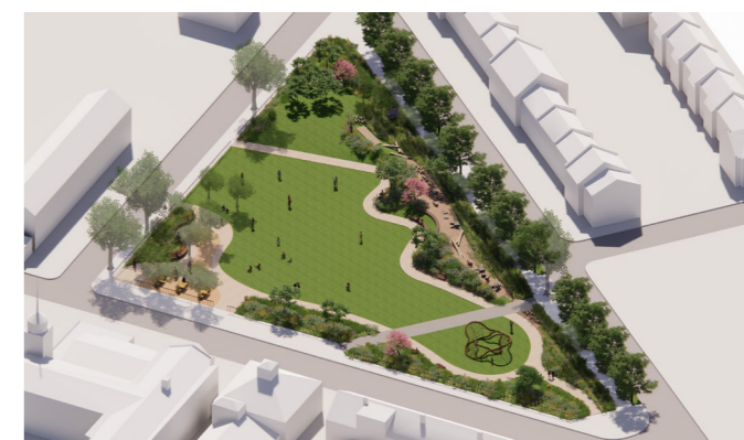
Fig.132 Illustrative aerial view of Millennium Green proposals

5.2.38. The delivery of the Millennium Green improvements sits outside the application red line boundary but will be subject to a separate Section 106 Agreement.