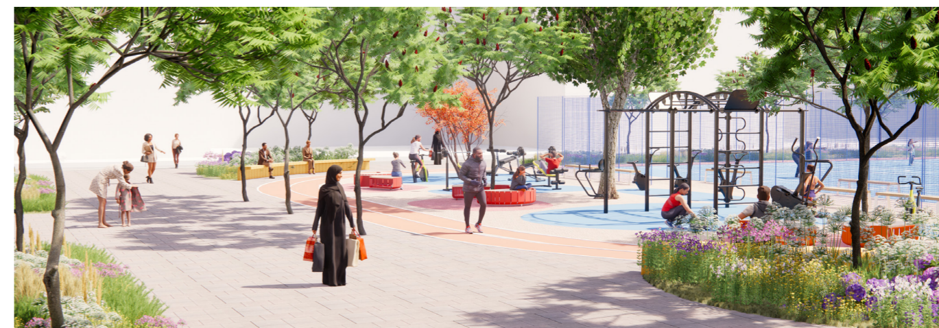
Fig.131 Illustrative View of Leven Road Open Space and the northern gym area with the MUGA in background, looking south from the entrance on the corner of Abbott Road