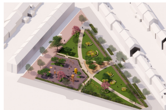
Fig.129 Illustrative aerial view of Braithwaite Park

Detailed information on can be found in Chapter 7 "Public realm" of the Design and Access Statement: Detailed Proposals to be delivered as part of the first phase of the development.