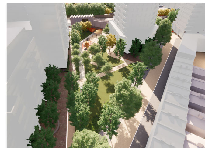
Fig.138 Illustrative aerial view of Highland Place