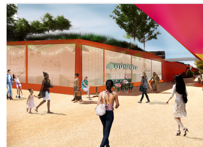
Fig.139 Highland Place to Jolly's Green walk through looking from underbridge to Slip Road illustrative visualisation