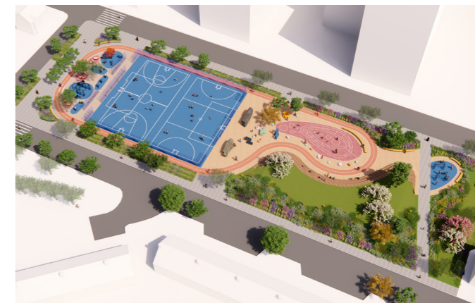
Fig.130 Illustrative aerial view of Leven Road Open Space proposals

Detailed information on can be found in Chapter 7. "Public realm" of the "Design and Access Statement: Detailed Proposals" to be delivered as part of the first phase of the development.