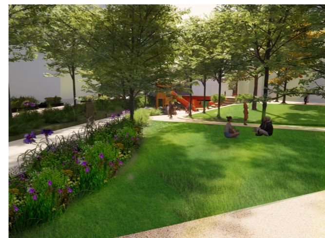
Fig.137 View 02 Highland Place looking towards the underbridge illustrative visualisation