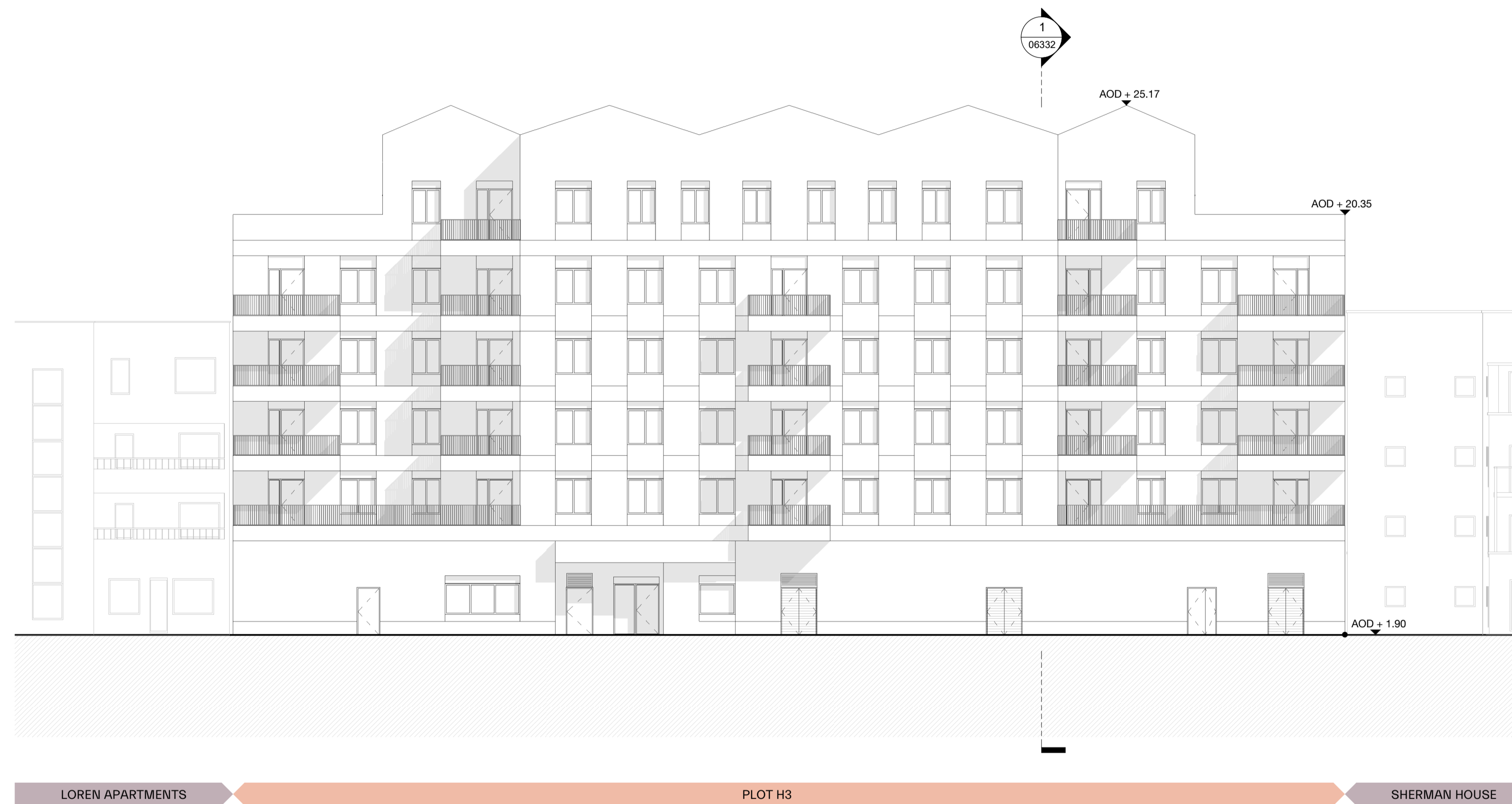
1 BH3 ELE E 06241 1 : 150