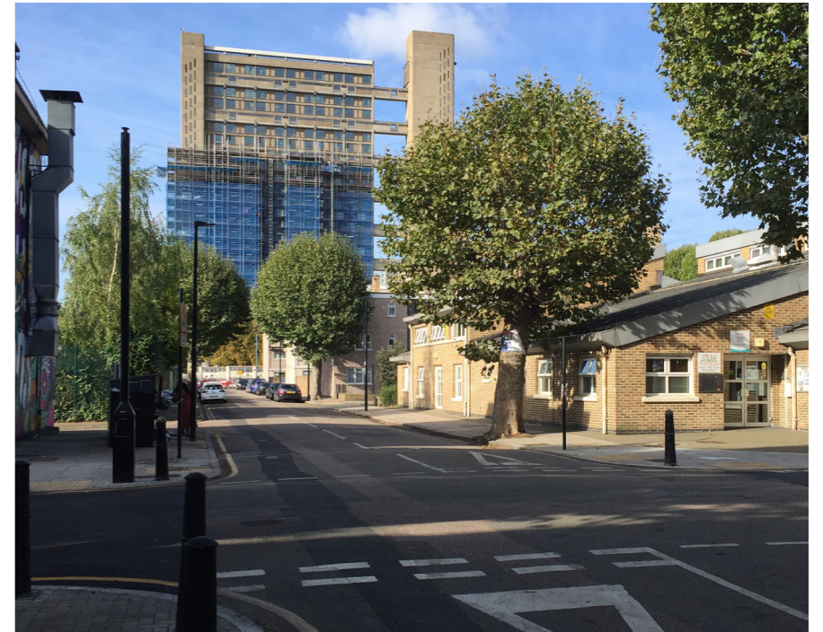
4 View of Balfour Tower looking West across Plot F, along Dee St.