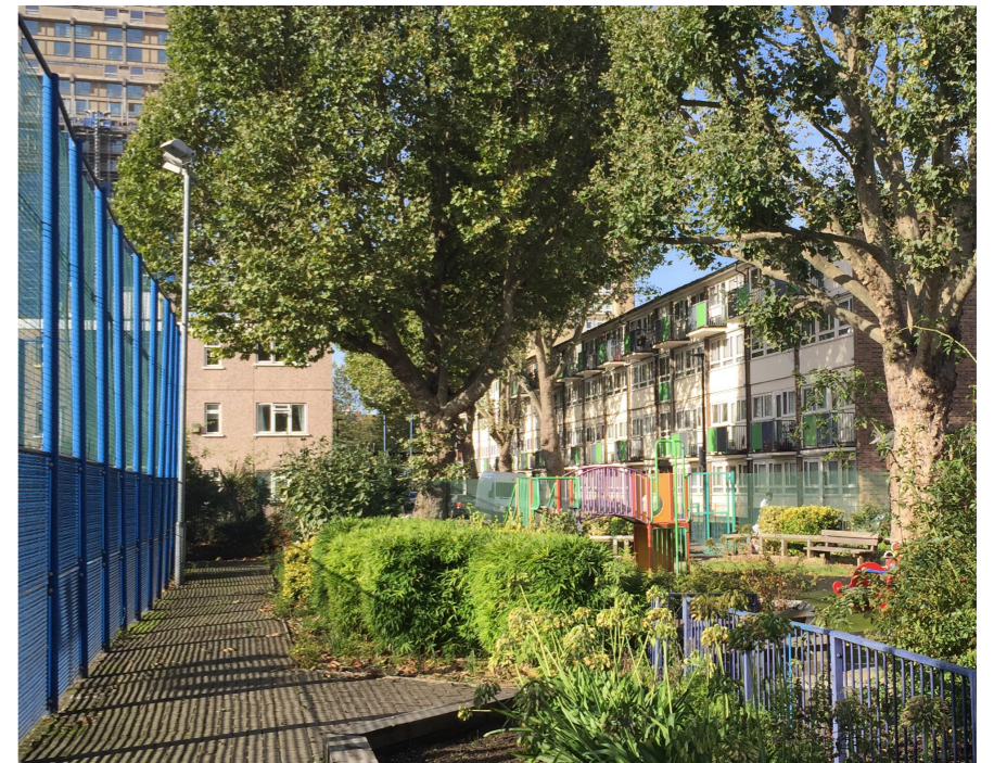
7 View to North / West boundary of plot F to Kilbrennan and Tartan House