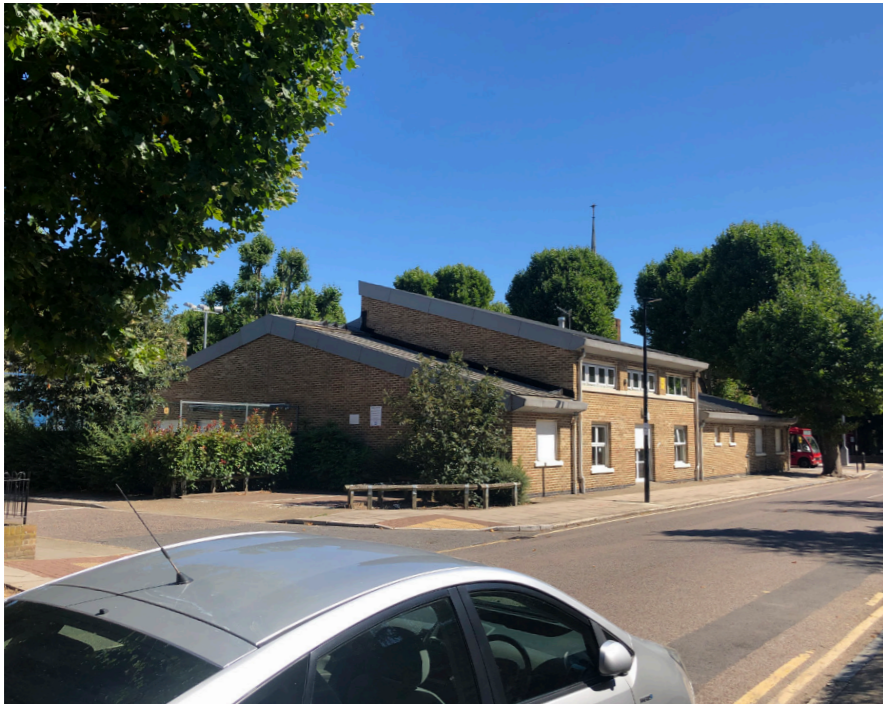
1 View looking North-East towards the existing Aberfeldy Community Centre to be demolished.