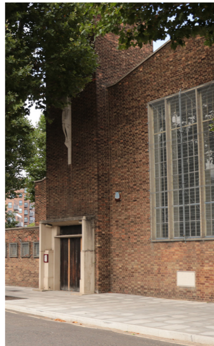
6 Views of St Nicholas' Church to the East of Plot F