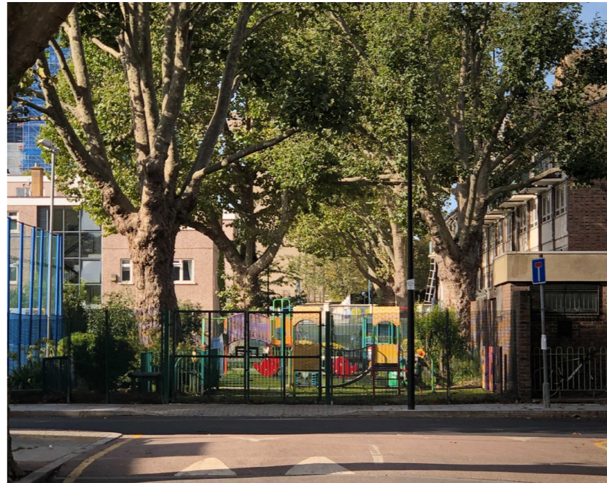
3 View to North boundary of Plot F and existing playspace / mature trees