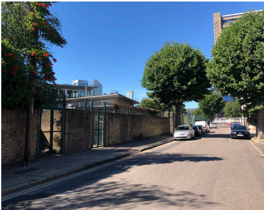
5 Low rise Culloden Primary School to the South-West