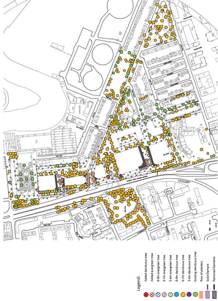
Figure 36: Wind Mitigation Mark-up