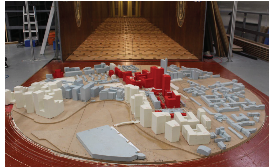
Figure 31: Proposed Development (Illustrative Scheme) and Phase A with Cumulative Surrounding Buildings (Configuration 9, Board 1) – View in the Wind Tunnel (from the north)