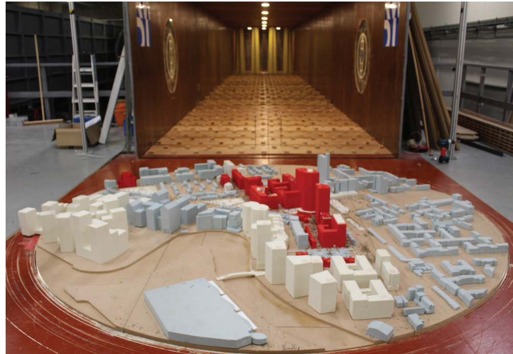
Figure 33: Proposed Development (Illustrative Scheme) and Phase A with Cumulative Surrounding Buildings, Proposed Landscaping and Wind Mitigation Measures (Configuration 10, Board 1) – View in the Wind Tunnel (from the south)