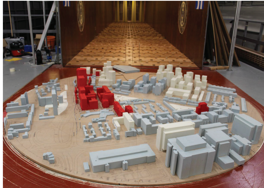
Figure 29: Proposed Development (Outline Proposals plus Detailed Proposals) with Cumulative Surrounding Buildings (Configuration 8, Board 2) – View in the Wind Tunnel (from the south)