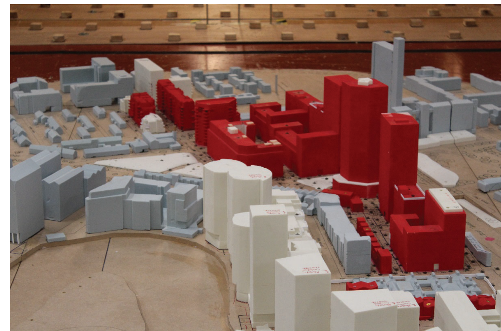
Figure 32: Proposed Development (Illustrative Scheme) and Phase A with Cumulative Surrounding Buildings (Configuration 9, Board 1) – View in the Wind Tunnel (from the north)