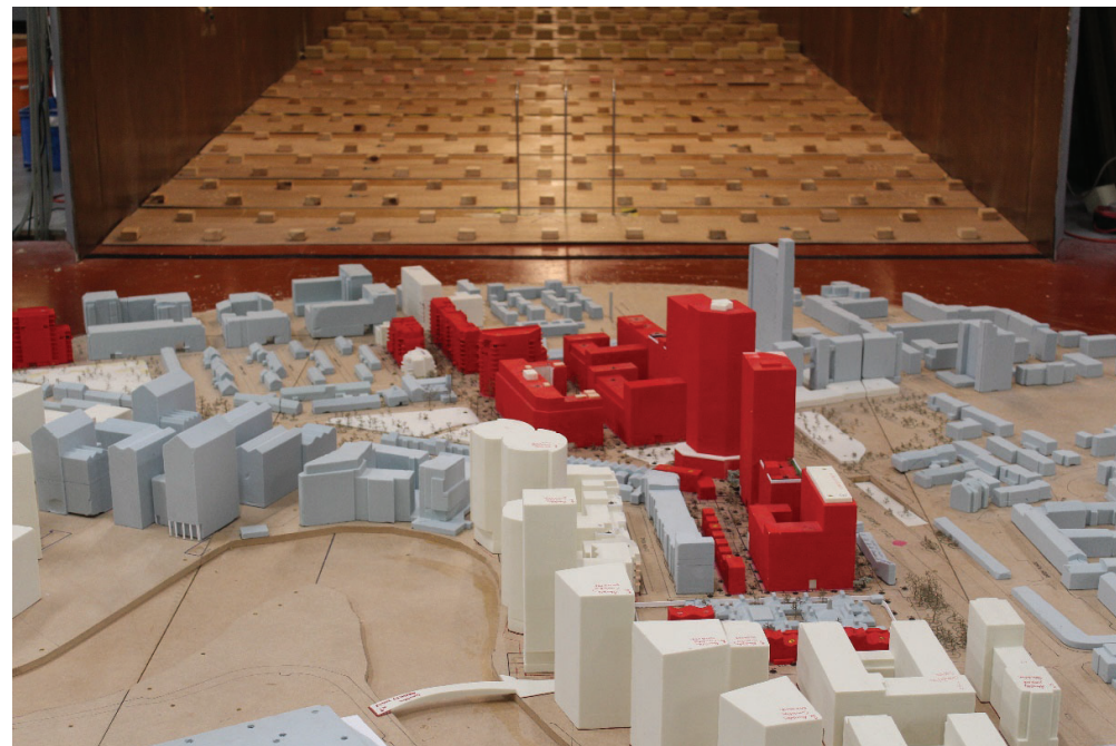
Figure 34: Proposed Development (Illustrative Scheme) and Phase A with Cumulative Surrounding Buildings, Proposed Landscaping and Wind Mitigation Measures (Configuration 10, Board 1) – View in the Wind Tunnel (from the south)