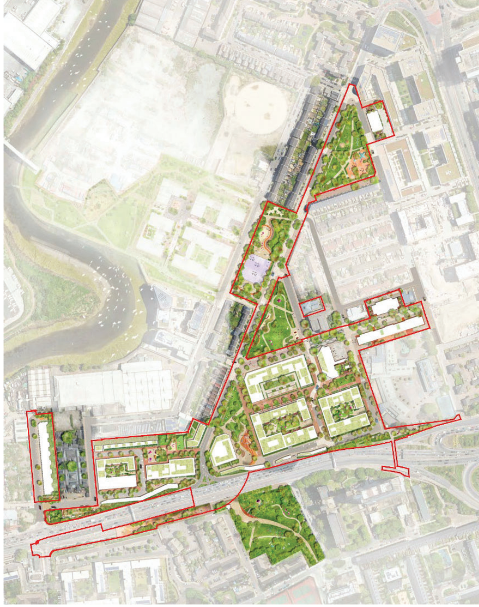
Figure 35: Proposed Landscaping Scheme (Ref. AVL-LDA-SBX-XX-DR-L-0004.pdf received on 05/10/2021)