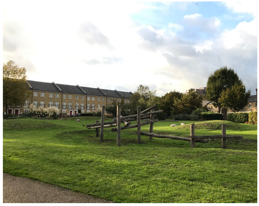
Play elements and open space with undulating mounds