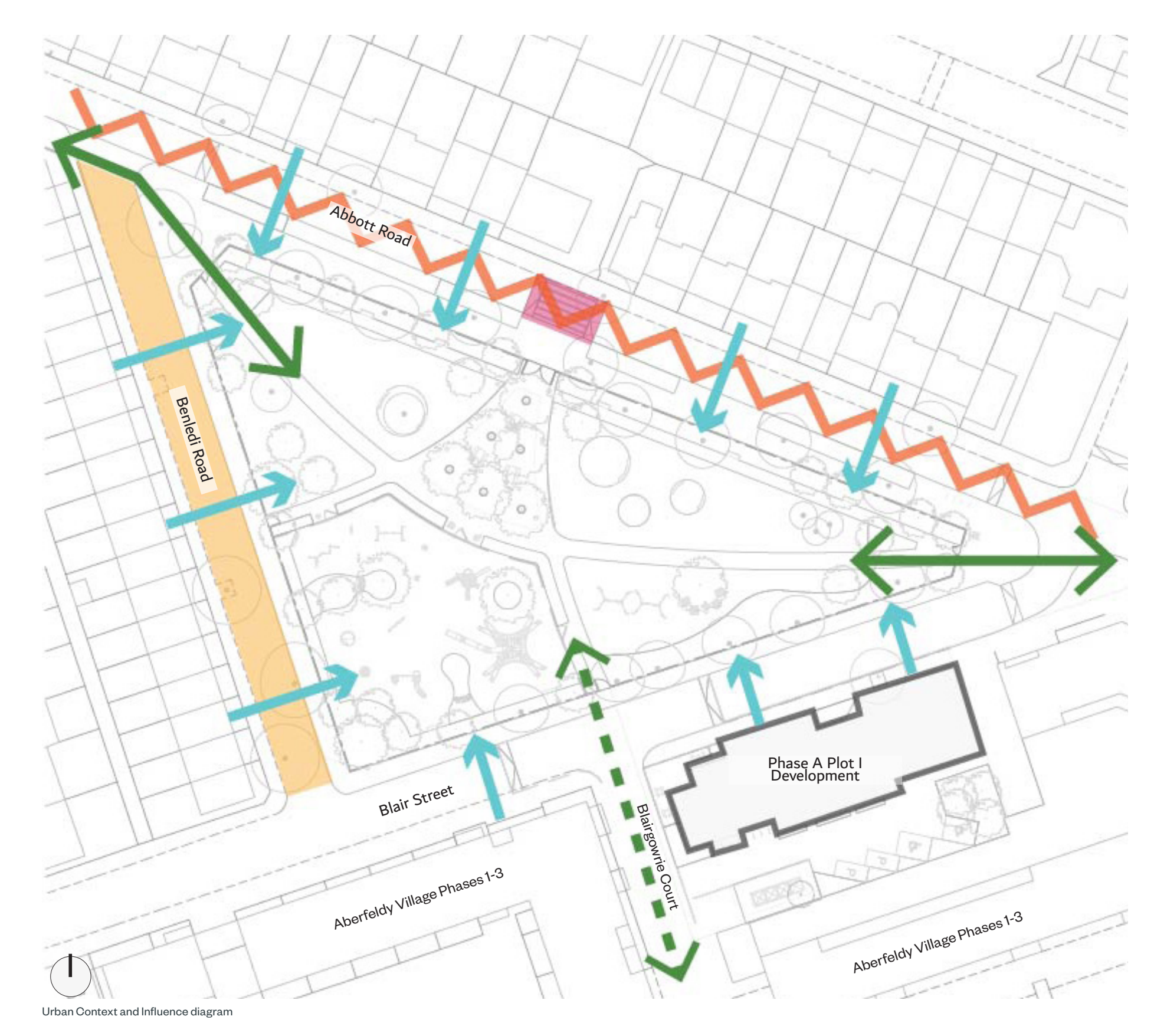
Aberfeldy Village Masterplan | Design and Access Statement: Phase A