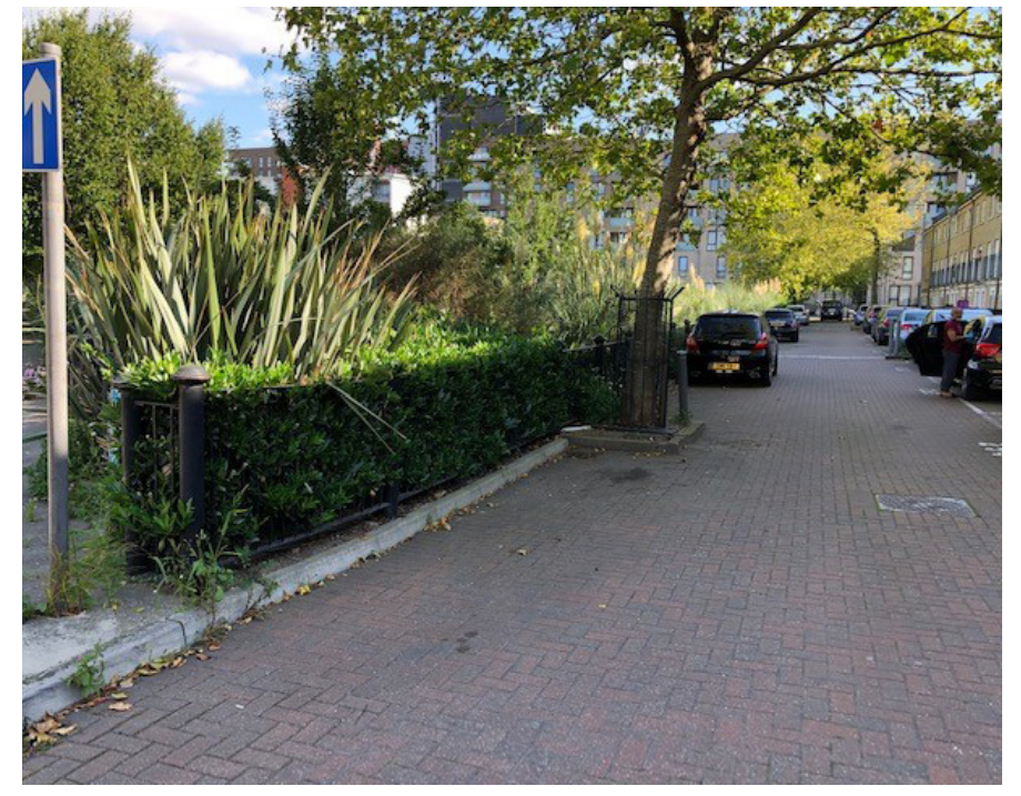
Existing Benledi Road boundary