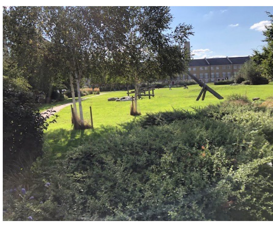
Existing boundary planting