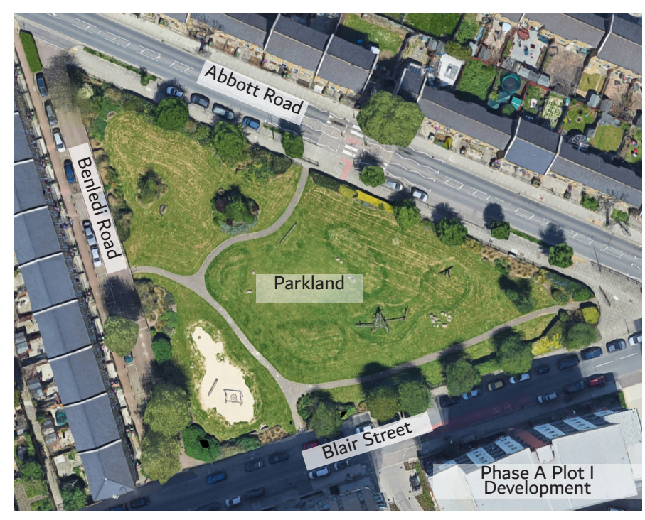
Existing map of park

The existing planting buffer to the edges should be retained (where in good condition) and diversified with a mixture of planting. Improvements to the parks entrances, range of play equipment, additional seating (including within areas with more shade) and a better organisation of the space could encourage more users to enjoy this park.