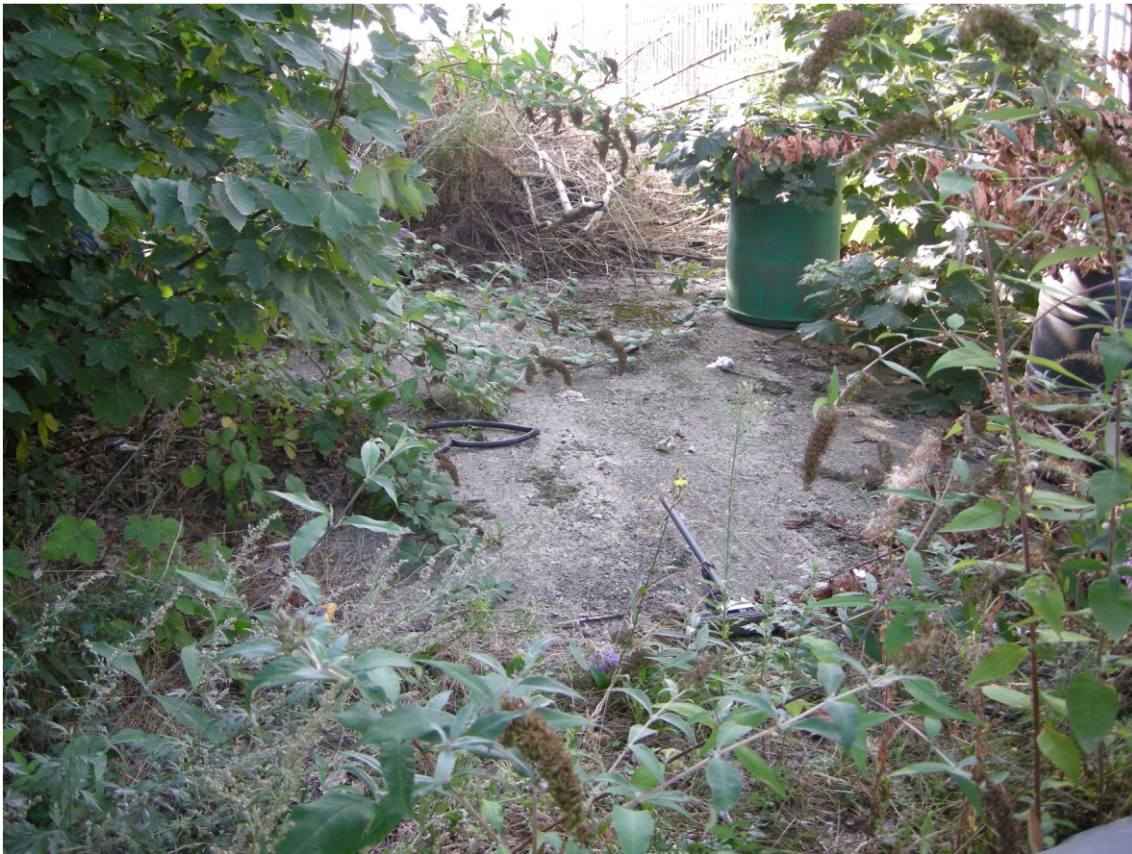
Fig 12 Photo showing the rail embankment extending from the site towards the River Thames. Taken facing south