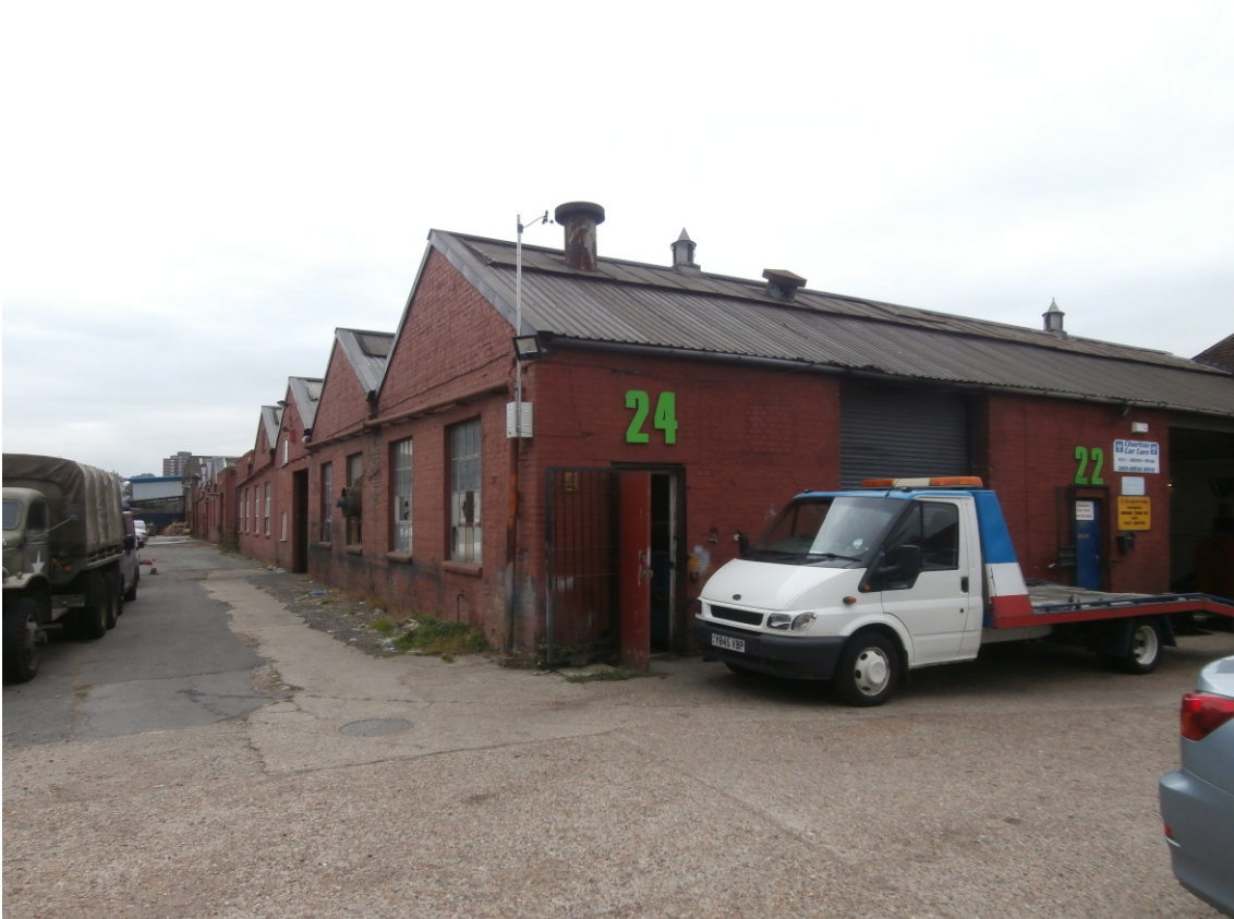
Fig 13 Photo showing the extant early-20th century ropery buildings converted for industrial use.