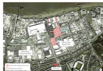
Anchor & Hope Lane sites - location map

Soundings 148 Curtain Road London EC2A 3AT