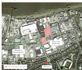
Anchor & Hope Lane sites - location map

Soundings 148 Curtain Road London EC2A 3AT Tel. +44 (0)20 7729 1705 Email. hello@charltonconversations.com Website. www.charltonconversations.com