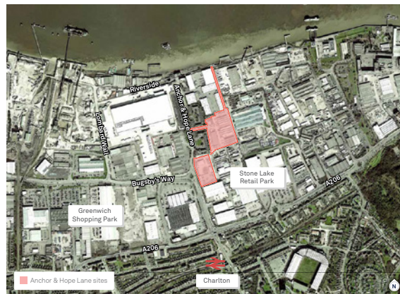
Anchor & Hope Lane sites - location map

Soundings 148 Curtain Road London EC2A 3AT