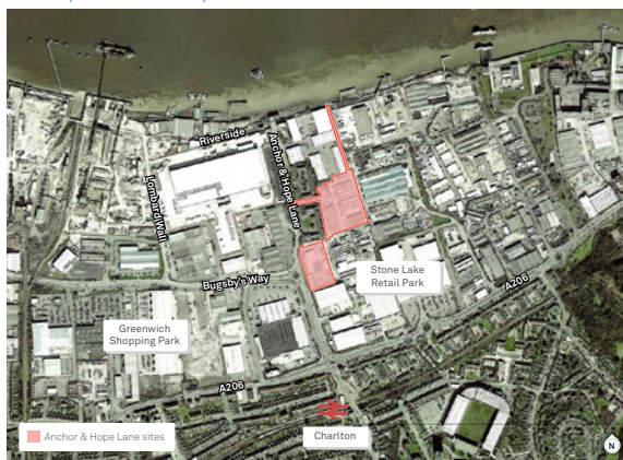
Anchor & Hope Lane sites - location map

Soundings 148 Curtain Road London EC2A 3AT Tel. +44 (0)20 7729 1705 Email. hello@charltonconversations.com Website. www.charltonconversations.com