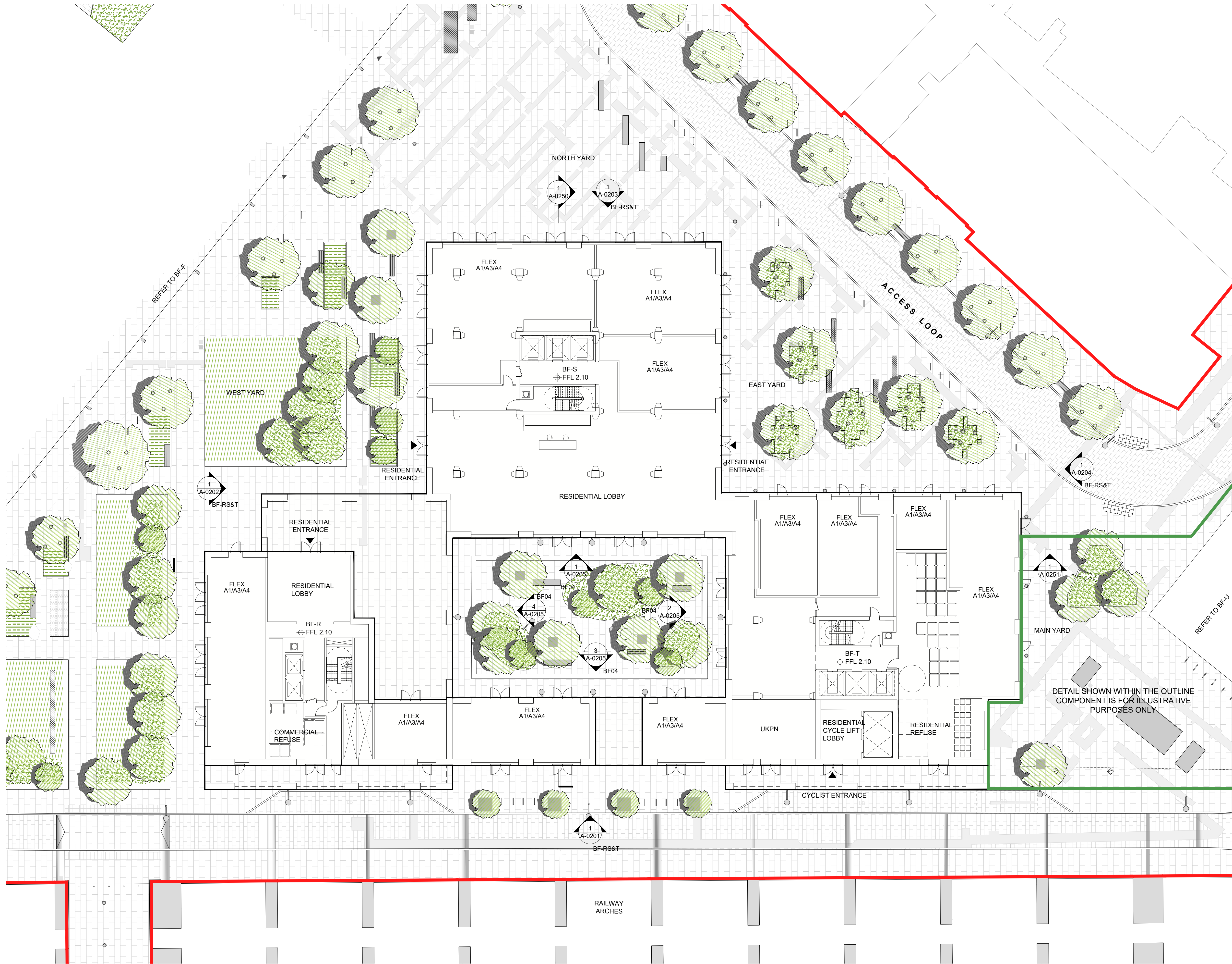
BF-RS&T GROUND FLOOR PLAN SCALE: 1:200 @ A1