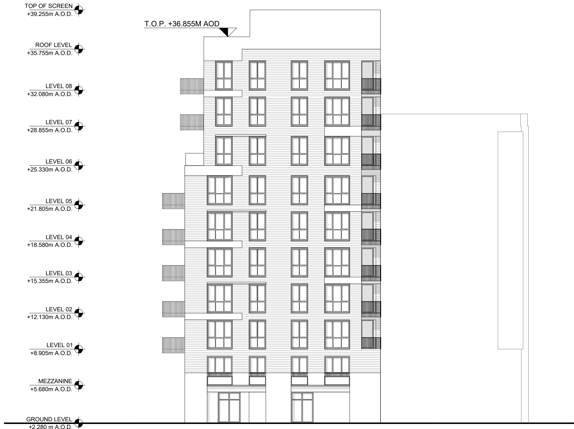
1 BF-P SOUTHEAST ELEVATION SCALE: 1:200 @ A1