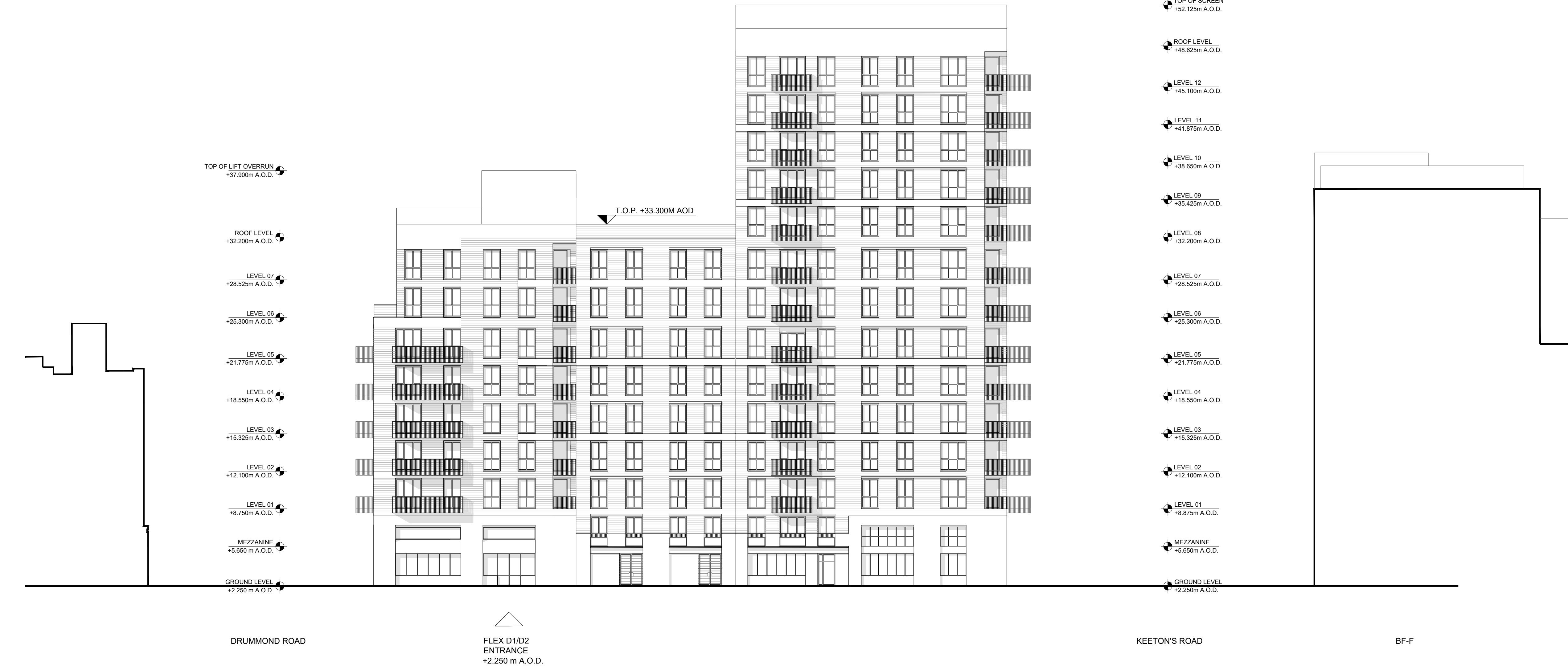
1 BF-O&Q NORTHWEST ELEVATION SCALE: 1:200 @ A1

Filename: H:\2607_Project\Sunbeam\Drawings\CAD\Sheet\2607-KPF-BF03-XX-DR-ELE-A-0203.dwg Plotted by: Ascoglu, Bekir Plot Time: 9/11/2019 5:37 PM