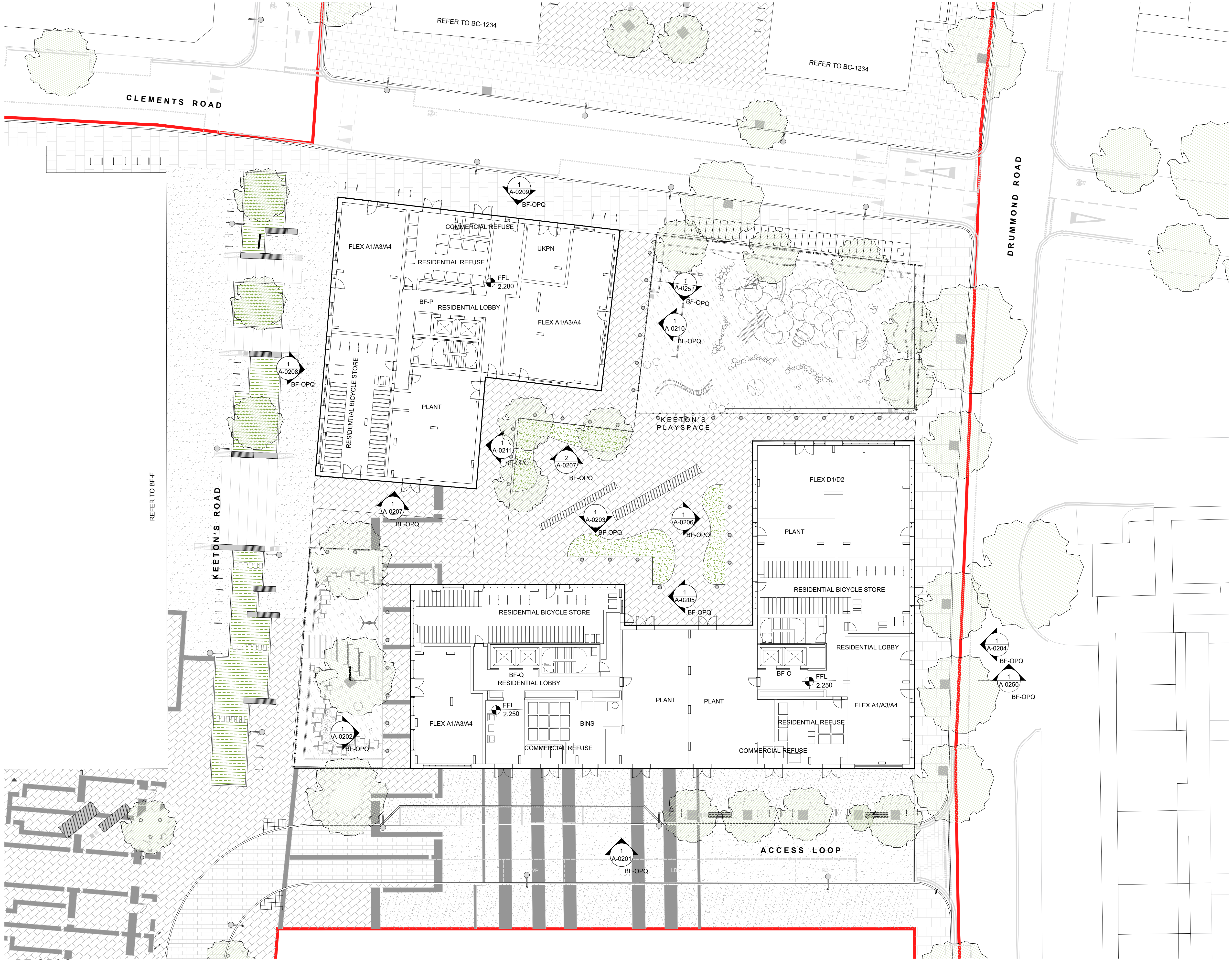
BF-OP&Q GROUND FLOOR PLAN SCALE: 1:200 @ A1