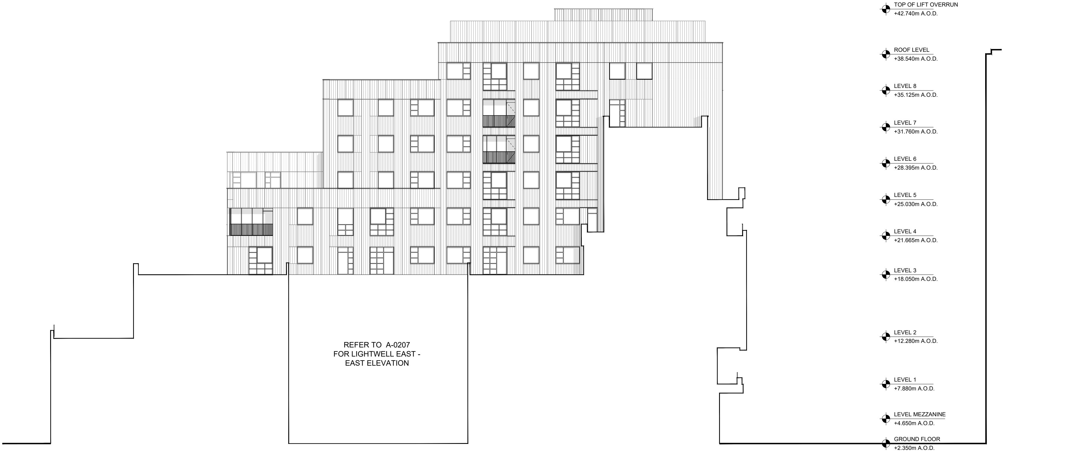
2 BF-F LIGHTWELL EAST - SOUTHWEST COURTYARD ELEVATION SCALE: 1:200 @ A1