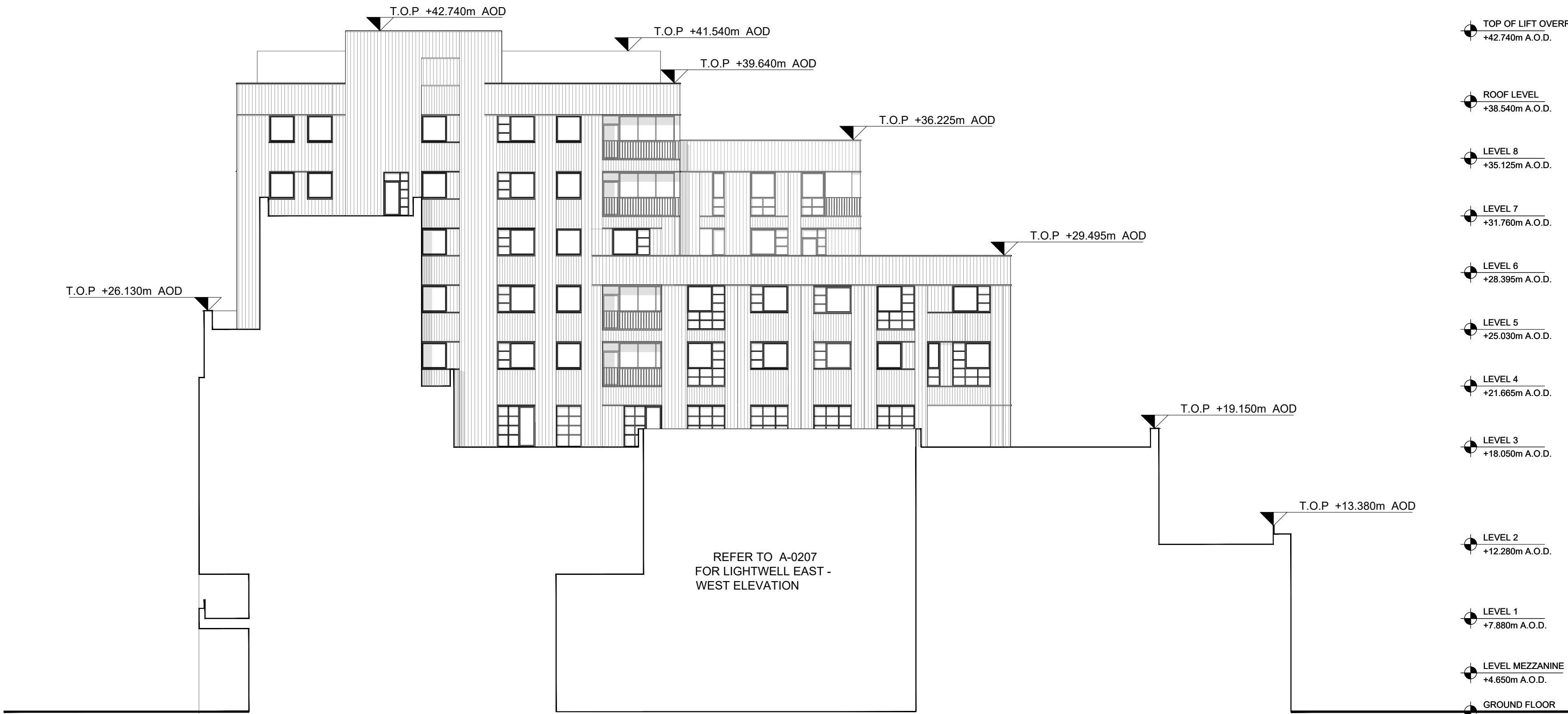
1 BF-F LIGHTWELL EAST - NORTHEAST COURTYARD ELEVATION SCALE: 1:200 @ A1

Structural Engineer (Building F) AKT II Tel: 020 7250 7777