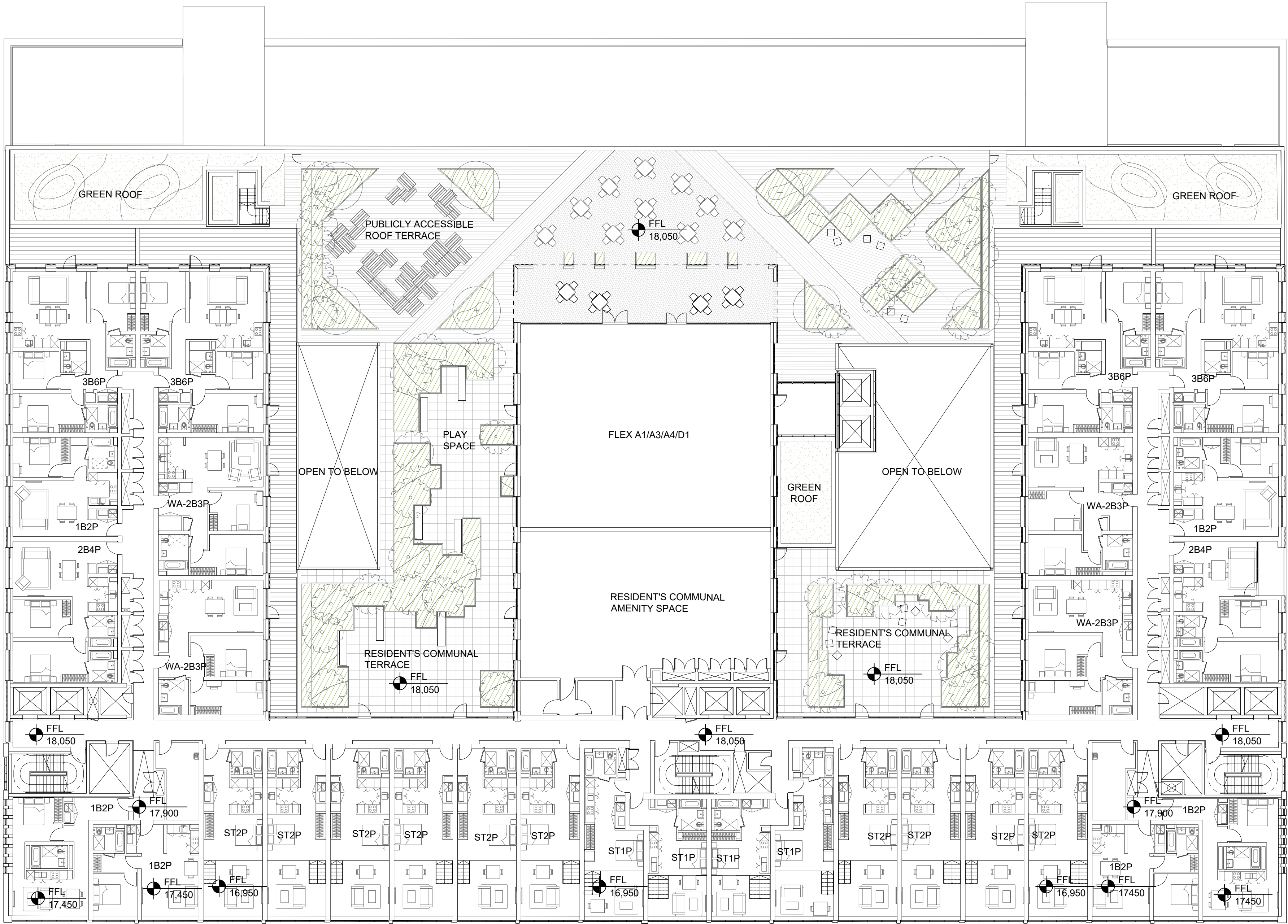
BF-F LEVEL 03 FLOOR PLAN SCALE: 1:200 @ A1

Drawing Ref. Rev. 2607-KPF-BF02-03-DR-PLN- A-0104 B