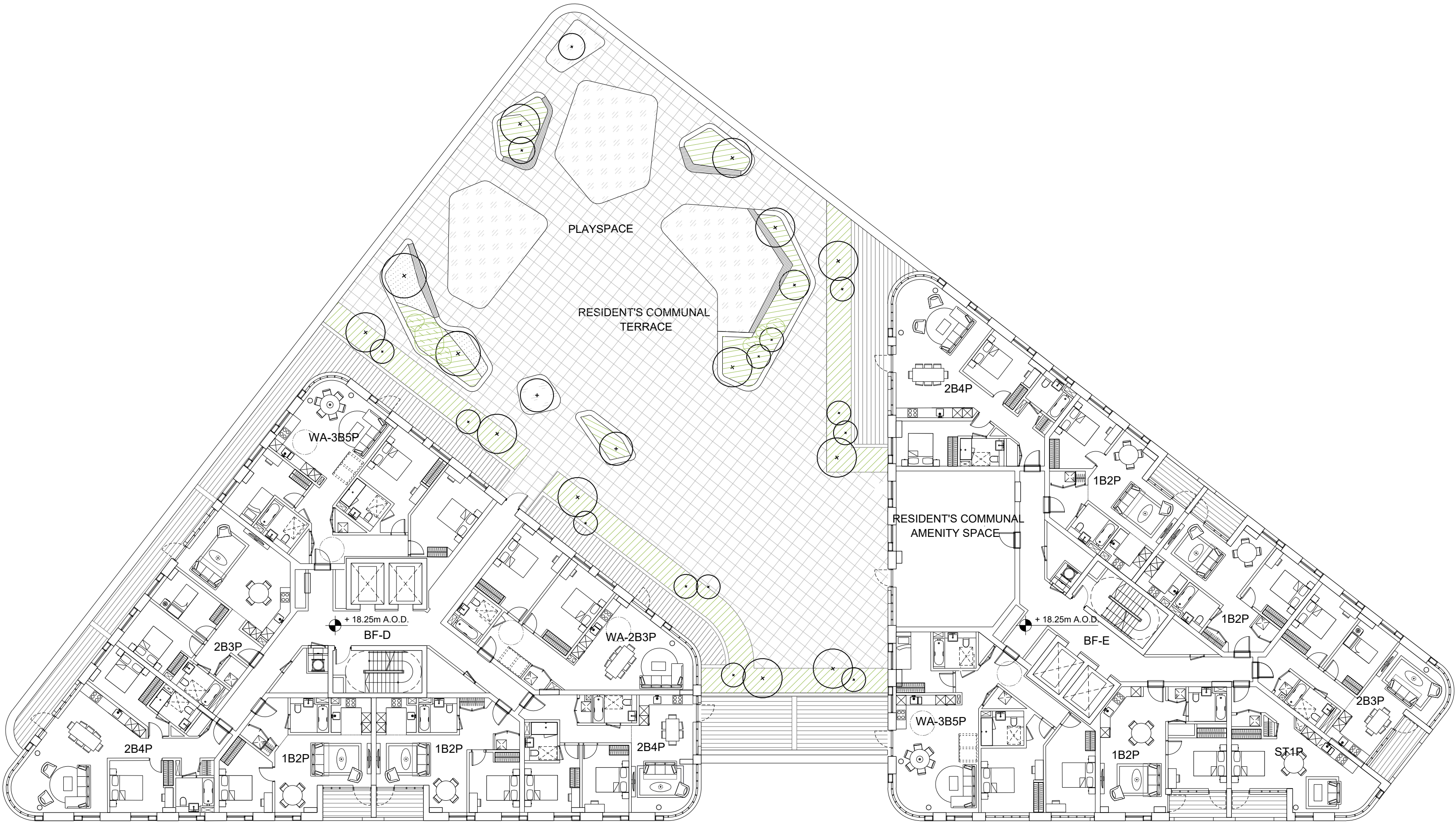
BF-D&E LEVEL 03 FLOOR PLAN SCALE: 1:200 @ A1

Drawing Ref. 2607-KPF-BF01-03-DR-PLN- A-0104 Rev. B